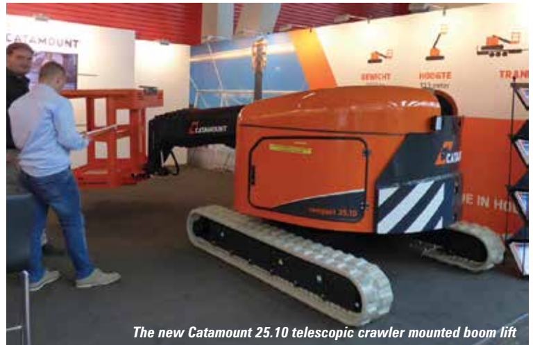
The new Catamount 25.10 telescopic crawler mounted boom lift

The Netherlands-based company is owned by Caspar van Woerden of Van Woerden Trading International, who said: "The development work has taken two years with the whole machine - including boom and undercarriage - fabricated by us in-house. Production capacity is around two units a week and we have plans for a larger machine weighing about 5,500kg and with a working height of about 12 to 13 metres."