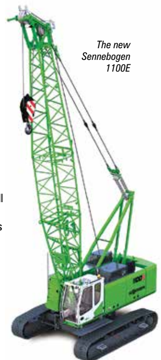
The new Sennebogen 1100E

Sennebogen has announced a new 50 tonne lattice crawler crane, the 1100E, the smallest model in its current range. Boom lengths range from 10.3 to 52.3 metres and as with other Sennebogen cranes the 1100E switches into a safe mode when the capacity on the hook exceeds 90 percent of the load chart. It can also lift on slopes of up to three degrees. Overall weight of the basic machine is just 30 tonnes and transport width three metres. Power comes from a Cummins Tier IV diesel coupled to multi-circuit hydraulic system for simultaneous crane operations. A Tier IIIa option is available for developing markets. The main hoist has a maximum speed of 125 metres a minute and is driven by a high pressure adjustable hydraulic motor for maximum efficiency.