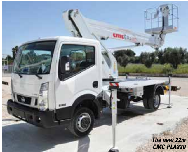
The new 22m CMC PLA220

The new model has an innovative open frame superstructure design and offers up to 15 metres of outreach with 80kg while maximum platform capacity is 220kg. Jacking can be inboard or with front outriggers extended to provide the maximum performance though 360 degrees. A 25 metre version, the PLA 250 is on the drawing board for launch later this year.