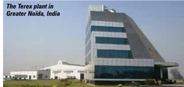
The Terex plant in Greater Noida, India