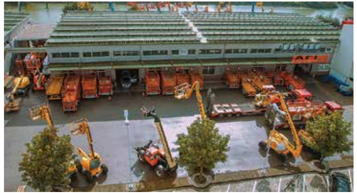
AFI Germany runs a fleet of more than 1,300 aerial lifts and telehandlers.