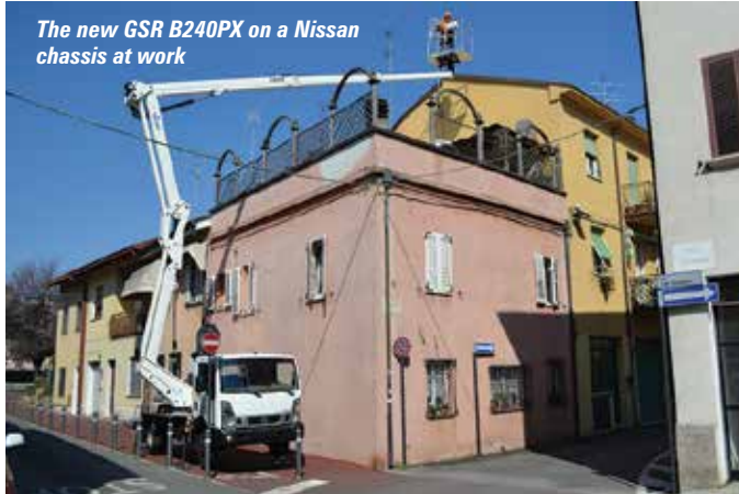
The new GSR B240PX on a Nissan chassis at work

The new machine features a dual sigma type riser and three section telescopic boom with 12.3 metres of outreach and an up and over clearance of around eight metres. Maximum platform capacity is 250kg with 140 degrees of platform rotation and the new machine is available on either the Nissan NT400 or Mercedes Sprinter MB311 chassis.