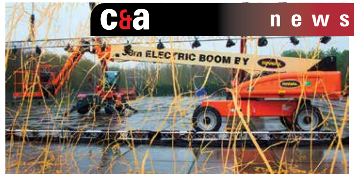
Rival's all electric version of the JLG 1200SJP

The operator was lowering the boom while lifting an 800kg compressor, when the pressure transducer on the boom lift cylinder sheared off causing the boom to descend rapidly. The operator was able to retract the boom and little and slew a little to avoid injuries and damage. The full report is on the Vertikal.Net online Library.