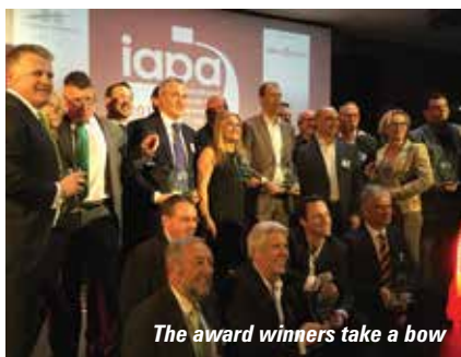
The award winners take a bow