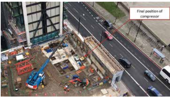
The scene after the boom came down - the operator managed to slew and possibly retract the boom a little before it hit the boundary wall.