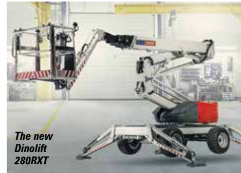
The new Dinolift 280RXT

Thanks to a new high strength steel boom design, it manages to maintain an overall weight of well under five tonnes. Standard features include four wheel drive, four wheel steer, oscillating front axle, a state of the art Moba control system and a higher 10kph stowed drive speed. The new machine will be on display at Vertical Days.