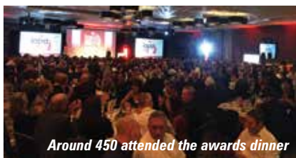
Around 450 attended the awards dinner