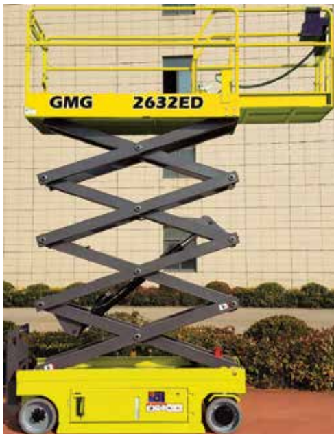
The first GMG product - a 26ft 2632-ED.