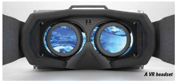
A VR headset