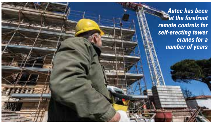
Autec has been at the forefront remote controls for self-erecting tower cranes for a number of years

includes a four light arrangement for system feedback, two or three-axis digital or analog joysticks, and a user identification function that allows the creation of individualised access avoiding unauthorised use and user tracking. The key holds the unique address of the radio control which is not reproducible and information that defines the operating mode. A tower crane for example typically has sensors that detect the weight lifted by the hook, the hook height, the position of the carriage on the jib, the load moment and the wind speed. Thanks to continual bi-directional communication, information on the status of the machine can easily be sent and displayed on the operator's remote control unit.