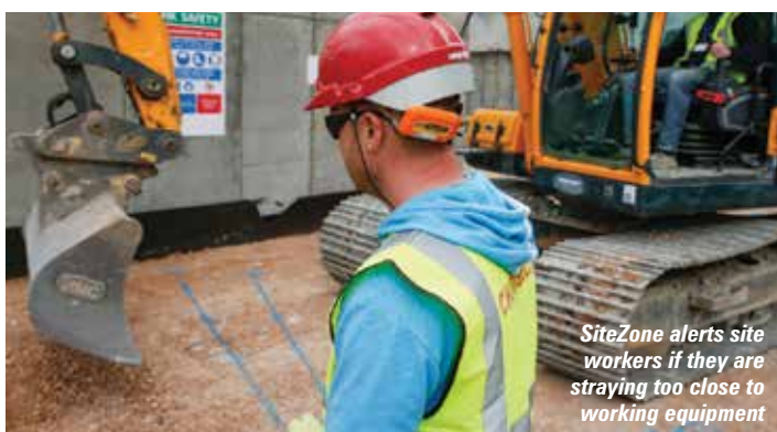
SiteZone alerts site workers if they are straying too close to working equipment

OverSite - which combines SiteZone's RFID technology with telematics and Big Data analysis from Trakm8 - goes one step further, by providing real-time alerts on zone breaches to site managers, as well as the analytics that contractors can use to identify and eliminate bad practice. Hosted in the Cloud, users can remotely access OverSite via a dedicated log-in. A dashboard provides key performance indicators such as the number of unauthorised breaches of a safety zone and the amount of time spent within it. The user-friendly system also enables managers to quickly generate reports that highlight key issues and trends. This helps companies effectively monitor the interaction on site between vehicles, equipment and personnel. Managers can then use the information take steps to change behaviour or provide re-training. Hot spots - where equipment and people are frequently required to work in close proximity - are easily identified and monitored more closely to help reduce the risk of further incidents.