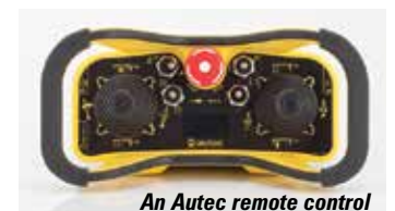
An Autec remote control

Italian company Autec has been at the forefront of such controls for self-erecting tower cranes for a number of years. Its AIR Series now include dual band radio frequencies - 433MHz and 915MHz - automatic frequency search at start up, this together with automatic frequency search at start-up means better reliability, faster response to commands and fast switching in case of interferences. The AIR also