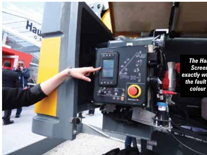
The Haulotte Activ Screen indicates exactly what and where the fault is with a full colour illustration