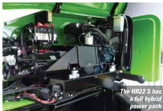
The HR22 S has a full hybrid power pack