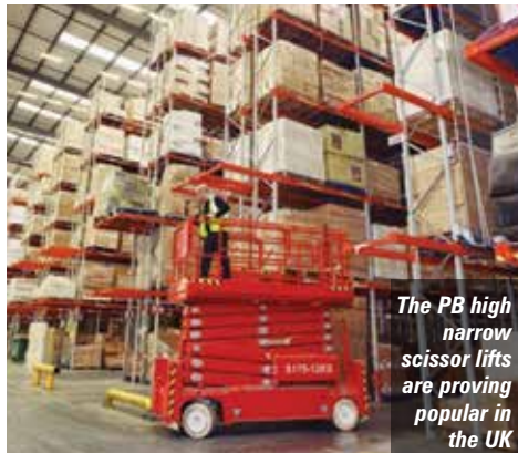
The PB high narrow scissor lifts are proving popular in the UK

The company has also ordered the 2.4 metre wide 82ft diesel 4x4 S270-24D 4WD, which is driveable at full height, has auto-levelling jacks and a 1,000kg platform capacity with a 1.8 metre by almost eight metre extended platform.