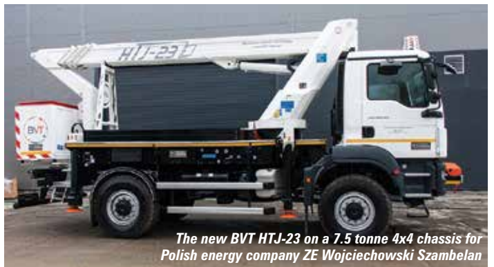
The new BVT HTJ-23 on a 7.5 tonne 4x4 chassis for Polish energy company ZE Wojciechowski Szambelan

The first unit has been delivered to Polish energy company ZE Wojciechowski Szambelan. The HTJ-23 provides 17 metres of outreach and a platform capacity of 300kg. It has been designed for mounting on a 7.5 tonne chassis. The new platform - mounted on an MAN 13.250 4x4 chassis - was delivered to ZE Wojciechowski Szambelan based in Mogilno in central Poland.