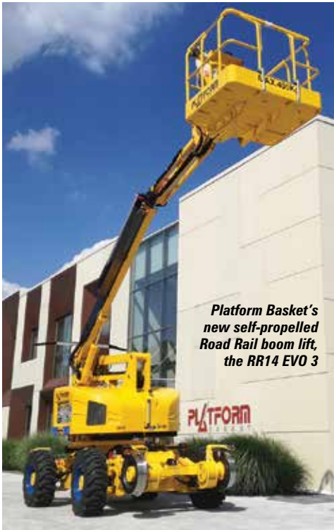
Platform Basket's new self-propelled Road Rail boom lift, the RR14 EVO 3

The new machine offers up to 14 metres of working height and is aimed at the maintenance of electrical catenaries and lighting systems along rail tracks. Features include four wheel drive and steer, with a maximum travel speed on tracks when stowed of 19kph. The new model is based on the existing RR 14 EVO and includes Platform Basket's well proven superstructure levelling system. The short sigma-type dual risers