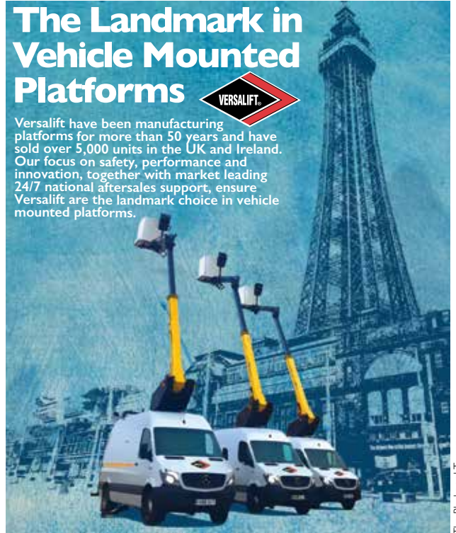
The Blackpool Tower

Versalift have been manufacturing platforms for more than 50 years and have sold over 5,000 units in the UK and Ireland. Our focus on safety, performance and innovation, together with market leading 24/7 national aftersales support, ensure Versalift are the landmark choice in vehicle mounted platforms.