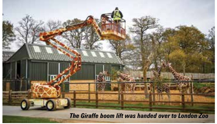
The Giraffe boom lift was handed over to London Zoo