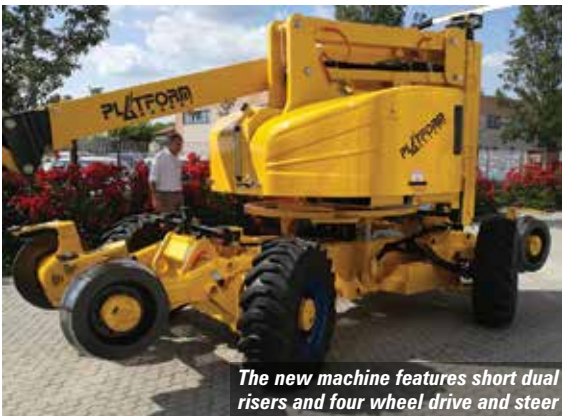
The new machine features short dual risers and four wheel drive and steer

stow within an overall height of three metres. Two digital display screens are provided, one on the platform controls and one next to the lower controls. The machine includes a standard spring loaded pantograph system with a choice of blades and a highly sensitive encoder to measure the distance between the track and the overhead cables. The results are displayed on the two display screens, while a larger screen mounted to the side of the superstructure is available to display the measurement results to those working alongside. A standard manual winch helps fit and remove the pantograph, while a new light weight trailer with a 2,200kg payload, can be towed behind the boom lift.