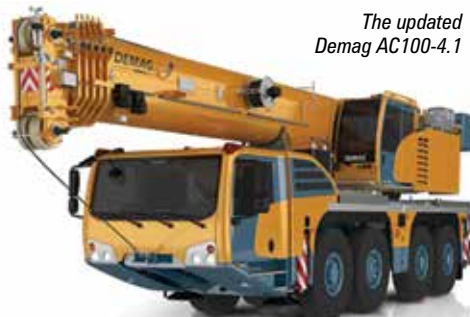
The updated Demag AC100-4.1

The crane maintains its 2.55 metre overall width, even with larger 445/95R25 tyres, its 59.4 metre main boom and 19.1 metre bi-fold swingaway which can be extended with an extra eight metre lattice insert for a maximum tip height of 81.6 metres. The AC 100-4L carries the 19 metre swingaway, blocks and up to 4.3 tonnes of counterweight within the 12 tonne axle weights. Power comes from Euromot 4/Tier 4 Final diesel with a Euromot 3a/Tier 3 option where permitted.