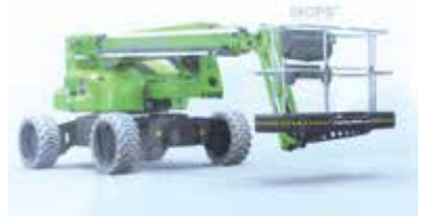
The new 62ft Nifty HR21E all-battery version of the updated HR21

Niftylift also launched the HR21E last month, a new all-battery electric version of the updated 62ft HR21 articulated boom lift, with direct electric drive, 13 metres of outreach, 250kg platform capacity, 150 degree articulating jib, 30 percent gradeability and an overall weight of 6,640kg.