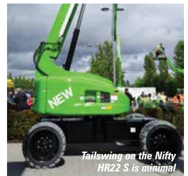
Tailswing on the Nifty HR22 S is minimal

Just glancing at a few key specification points, the new product does very well, with class leading outreach, platform capacity, overall weight, power choice and jib articulation. Its tailswing also looks to be out in front, although we found that methods of measuring it vary widely, which is why it has not been included. Not everyone will want a hybrid of course, so price and residuals will play a key factor in decision making.