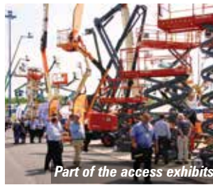
Part of the access exhibits

The ground - all hard standing - probably made the largest difference although not being hostage to incidents on the M6 motorway may also have played a part. An estimated 500 to 600 cranes, aerial lifts and telehandlers were displayed, with around 2,650 visitors attending - some of them for both days. The weather also played its role with the sun shining for both show days. The consensus is to return to Silverstone in 2018 and discussions are underway, with mid-May as the target for the 12th event next year. A full pictorial review can be found on page 41.