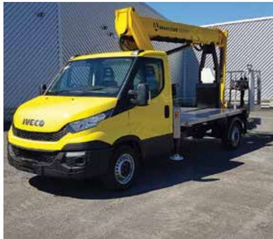
Skyking is to distribute Ascendant truck and van mounted lifts in the UK.

Skyking, now part of the Martin group, will sell new machines and provide replacement parts and after-sales service for all of Ascendant's van and light truck mounted platforms in the UK. Ascendant will continue to sell its tracked and specialist machines direct to customers in the UK and handle its own export sales.