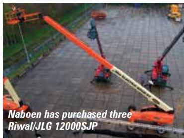
Naboen has purchased three Rival/JLG 1200SJP

Dutch sales and rental company Rival has sold three of its new 120ft battery electric JLG 1200SJP conversions to Norwegian general equipment rental company Naboen.