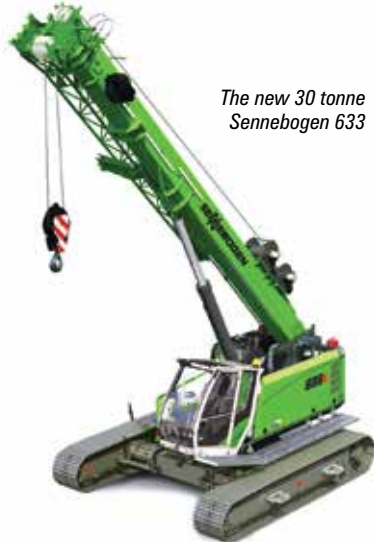
The new 30 tonne Sennebogen 633

The crane features a new Multicab II which tilts by 15 degrees and includes full climate control and air-sprung heated seat as standard. Views of the winch, rear and the right side are displayed on the seven inch in-cab screen which also displays the output from the Sencon control and diagnostics system. Power comes from a Cummins Tier 4f diesel with exhaust after treatment.