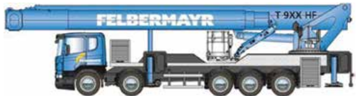
The first Ruthmann T900XXHF has been ordered by Felbermayr.