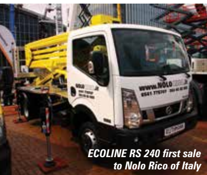
ECOLINE RS 240 first sale to Nolo Rico of Italy

The RS240 has a working height of 23.6 metres and when mounted on a 3.5 tonne Nissan Cabstar for example, is less than seven metres long and 2.56 metres high. Platform capacity is 250kg with which it can manage 8.3 metres of outreach. This increases to 9.1 metres with 200kg and 11.4 metres with just 100kg in the platform. One of its main features is a new, patented easy to set-up three lever levelling system which always gives equal weight on each of the outriggers negating any torsion in the chassis.