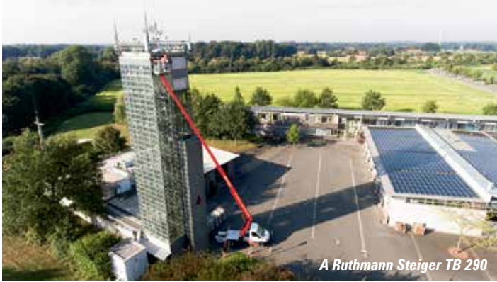
A Ruthmann Steiger TB 290

230kg platform capacity and both claim class-leading 16.5 metres of outreach with 100kg in the platform and 170 degrees of platform rotation. The Palfinger is based on the 21 metre P 210 BK and offers below ground level reach. The company has also incorporated the premium outrigger system from its larger machines as standard, complete with auto-levelling, automated variable positioning and axis ground clearance monitoring. Ruthmann says its TBR 250 - which can set up on slopes of up to five degrees - is the ideal substitute for similar sized platforms mounted on 7.5 tonne chassis.