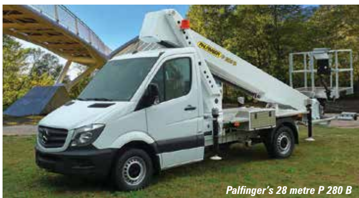
Palfinger's 28 metre P 280 B

Both Palfinger and Ruthmann have also recently launched 25 metre platforms. On the surface both look similar, but the main difference is the boom - the Ruthmann TBR 250 has a high tensile steel four section boom, while the Palfinger P 250 BK has a five section aluminium boom - now common on the Palfinger Italia platform range. Both feature 185 degrees of jib articulation and