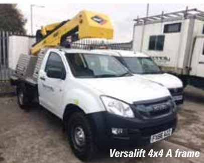
Versalift 4x4 A frame