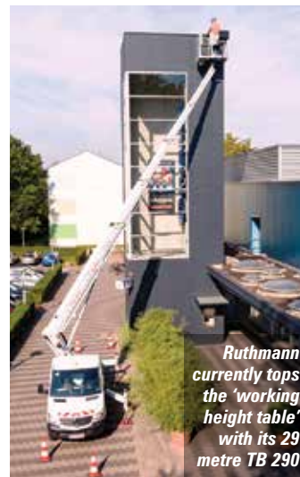
Ruthmann currently tops the 'working height table' with its 29 metre TB 290

Last year the introduction of platforms with working heights over 25 metres had calmed down with manufacturers concentrating on expanding the 'bread & butter' mid-range platforms particularly in the 20 to 25 metre range. However the increased availability and use of ultra-high strength steels and intelligent weight-saving designs