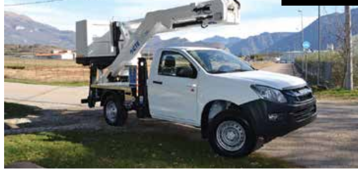
The CTE Zed 15.2 has 6.3 metres of outreach and a platform capacity of 230kg

tonne truck mount - the 32 metre MP 32.19 with twin telescopic booms with slew ring between the two, plus a two section telescopic jib with almost 180 degrees of articulation. The unit offers a 300kg platform capacity, and up to 19 metres outreach at an up and over height of over 12 metres.