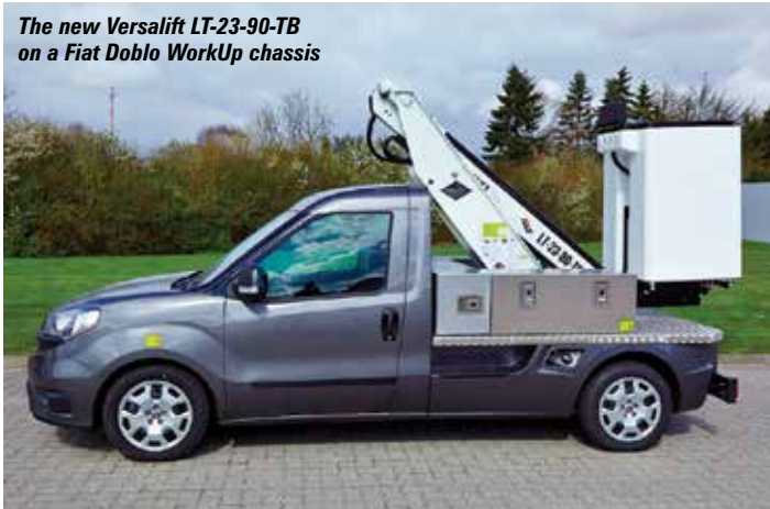
The new Versalift LT-23-90-TB on a Fiat Doblo WorkUp chassis