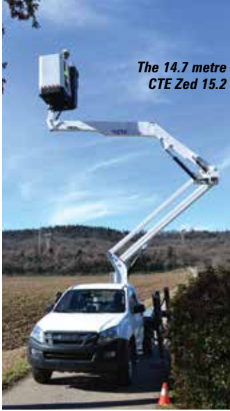
The 14.7 metre CTE Zed 15.2

motion. Slew is 360 degrees, while the 1.4 metre wide platform has 120 degrees of rotation.