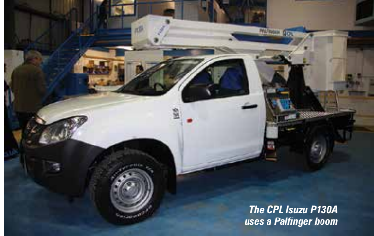
The CPL Isuzu P130A uses a Palfinger boom

CPL says that the switch to the Palfinger boom has resulted in a stronger, smoother and more stable platform. Working height and outreach are similar and the controls are identical making it easier for operators to switch between the two platforms. Other improvements include moving the lower controls to just behind the cab on the passenger side which is beneficial in an emergency. The boom has been relocated to the right hand