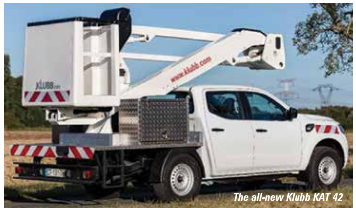
The all-new Klubb KAT 42

Another company with a wide range of platforms on 3.5 tonnes or less is Versalift. Its latest is a compact platform - the nine metre LT-23-90-TB - mounted on a two wheel drive Fiat Doblo WorkUp chassis which has an overall weight of just 2.5 tonnes it manages up to 4.2 metres of outreach with its 120kg/one-man fibreglass platform without the need for outriggers. Aimed at mainland Europe - particularly France - Versalift says that a capacity upgrade and optional detachable