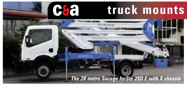
The 28 metre Socage forSte 28D E with X chassis