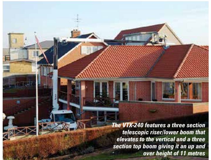
The VTX-240 features a three section telescopic riser/lower boom that elevates to the vertical and a three section top boom giving it an up and over height of 11 metres

CMC has launched a new 22 metre telescopic truck mount on a 3.5