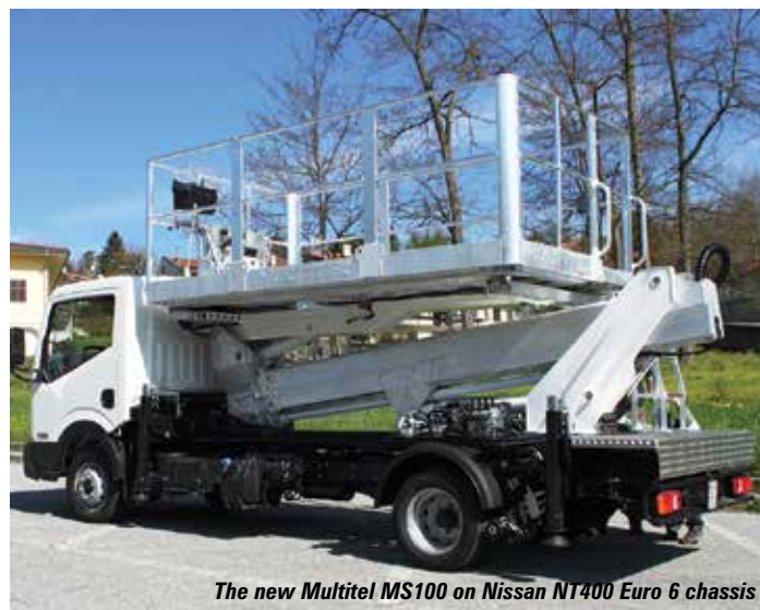
The new Multitel MS100 on Nissan NT400 Euro 6 chassis

The E (electric) series of platforms - which includes articulated and telescopic platforms with or without a jib - use electric controls, mounted on the new X-shaped chassis. Socage says that nearly all the structural components now use lightweight high tensile steel. Socage also has a new Series 4 range of articulated and telescopic models, with working heights from 15 to 24 metres. These also feature the X-shaped chassis with manually extendable outriggers to keep weight down, reduced height and longer outrigger extensions resulting in a better balanced platform.