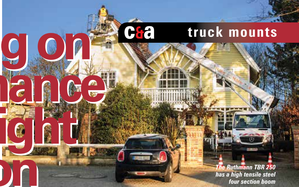
The Ruthmann TBR 250 has a high tensile steel four section boom

If one equipment sector has had to reinvent itself it is the 3.5 tonne truck mounted platform. Just when you thought it had reached its limit, the latest launches have surprised yet again with new designs and innovation producing improved performance yet still within the increasingly restrictive 3.5 tonne GVW limitations.