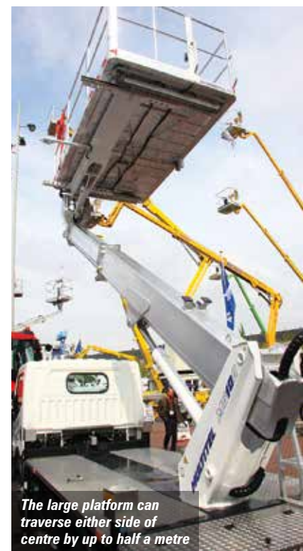
The large platform can traverse either side of centre by up to half a metre

telescopic boom topped by a 3.3 metre long, 1.85 metre wide platform giving a working height of 10 metres with a platform capacity of 400kg. The work platform can also move laterally by up to 500mm either side, reaching around 450mm beyond the width of the chassis, which is 1.9 metres wide including stabilisers. This allows the operator to get closer to the point of work. The lift is mounted on a 3.5 tonne Nissan NT400 Euro 6 chassis and can work up to six metres without setting the stabilisers. An optional hydraulic friction drive allows it to travel at speeds of up to five kph at this height.