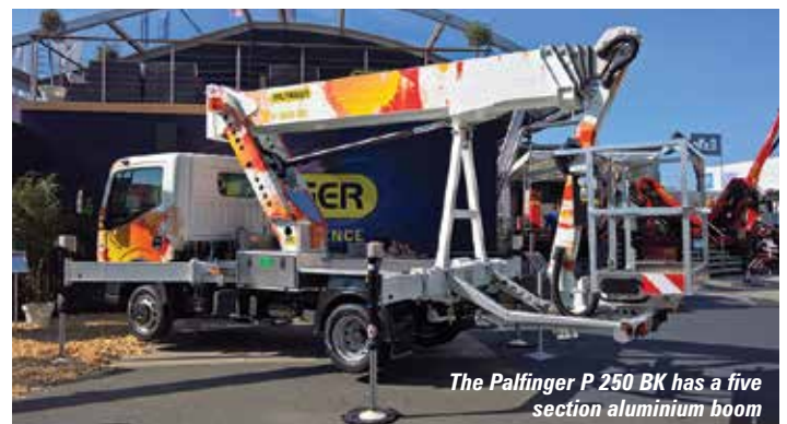
The Palfinger P 250 BK has a five section aluminium boom