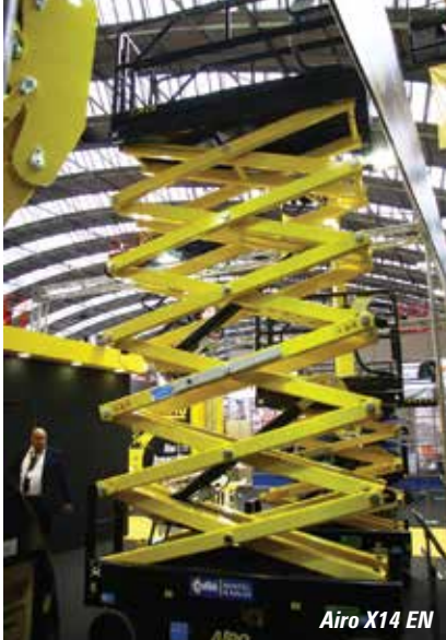
Airo X14 EN

in fork lift pockets, lifting eyes on the outriggers, the innovative RAHM control and diagnostics system for remote diagnostics and troubleshooting.