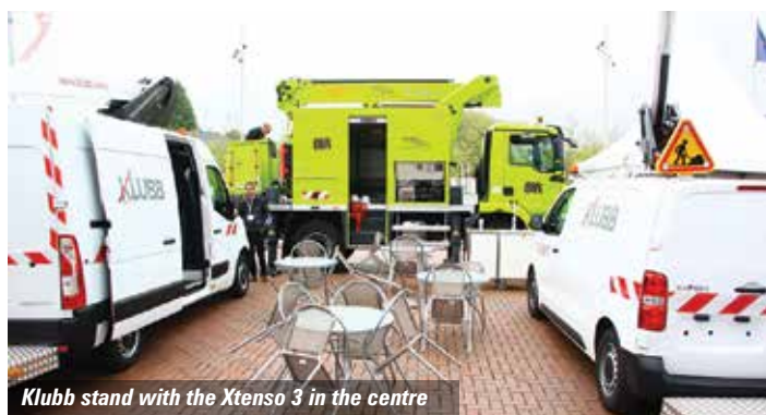
Klubb stand with the Xtenso 3 in the centre