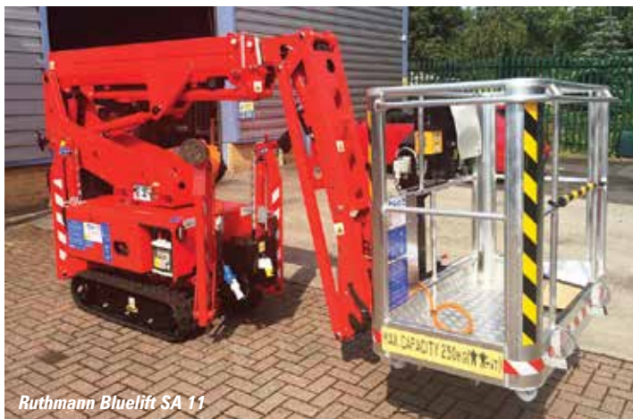
Ruthmann Bluelift SA 11

boom of the T 9XX HF does not need to be fully raised and locked before the platform can be used. This new design allows it to be used with the lower boom at 72 degrees or above rather than 90 degrees. With the 30 metre upper boom and jib this provides an extra six metres of outreach - possibly up to a maximum of 39 metres. The lower boom only needs to be locked for maximum height.