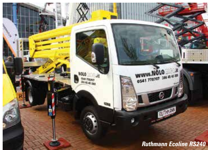
Ruthmann Ecoline RS240