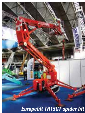
Europelift TR15GT spider lift

JLG has plenty of new products and technology in the pipeline and is concentrating on Hybrid technology showing its latest H800AJ 80ft hybrid articulated boom lift which uses a small Kubota diesel coupled to an electric motor to boost power. Hungarian trailer lift manufacturer Europelift showed off its first spider lift, the 15 metre TR15GT a 'solid' auto-levelling unit with 7.6 metres outreach and 200kg capacity.