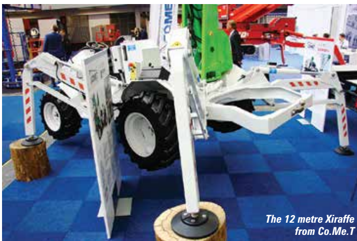
The 12 metre Xiraffe from Co.Me.T