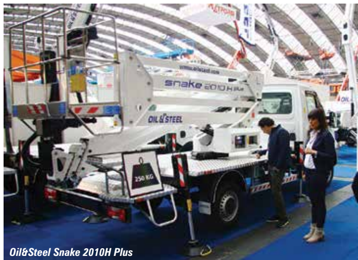
Oil&Steel Snake 2010H Plus

GSR launched its new 23.6 metre, 12.3 metre outreach B240PX with 250kg capacity mounted on a 3.5 tonne chassis.