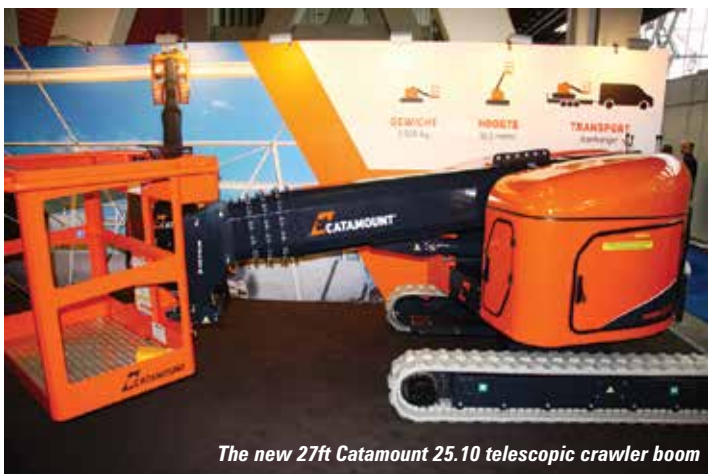
The new 27ft Catamount 25.10 telescopic crawler boom