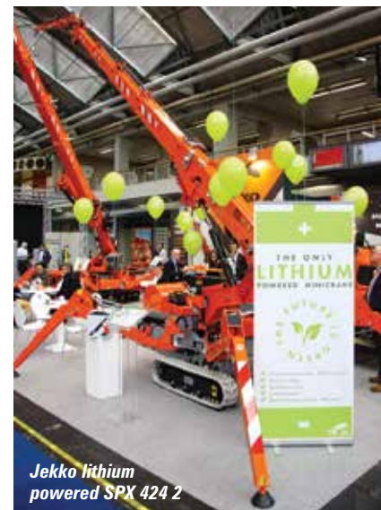
Jekko lithium powered SPX 424 2

Business is also good for Arnham, Netherlands-based crane company Hoefflon which showed an updated version of its C1. The company says that its new larger facility - will help it cope with increasing demand. It is currently producing between two to three cranes a week.