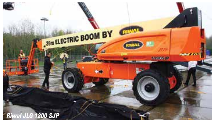
Rival JLG 1200 SJP

interest - it may start building them in the UK.