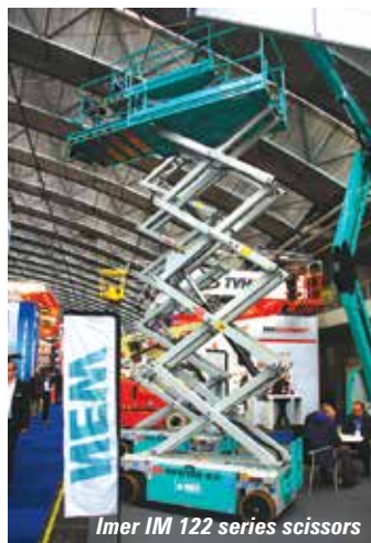
Imer IM 122 series scissors

Imer Access showed two of four new electric scissor lifts in the IM 122 series - the 20ft IM 8122, the 26ft 10122, 33ft 12122 and 55ft 14122 - all with 1,300mm deck extensions. The IM 122 lifts replace the IM 80/90 series scissors.