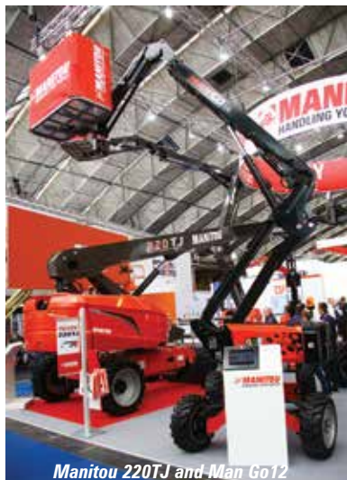
Manitou 220TJ and Man Go12

Manitou launched a new 66ft telescopic boom lift, the 220TJ and a heavier, larger platform + version. The new machines combine the running gear of the 60ft 200ATJ articulated boom lift, with a three-section version the 80ft 260T's telescopic boom and two metre articulated jib. Unrestricted platform capacity is 230kg or 350kg for the 220TJ+. Outreach is 17.6 and 17.8 metres respectively, while the overall weights are 11,850 and 13,800kg.