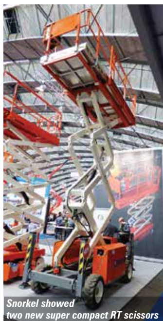
Snorkel showed two new super compact RT scissors

Easily missed were Snorkel's two new super compact Rough Terrain scissors - the 22ft S2255RT and the 27ft S2755RT. Both have an overall width of 1.45 metres/55 inches and have been available in Australia/ New Zealand for several years. At 2,360kg and 2,580kg - including standard self-levelling outriggers, a 1.2 metre roll-out deck extension and non-marking tyres - they can be towed behind a van or 4x4. Snorkel says that if there is sufficient demand - particularly from Germany where there is already a lot of