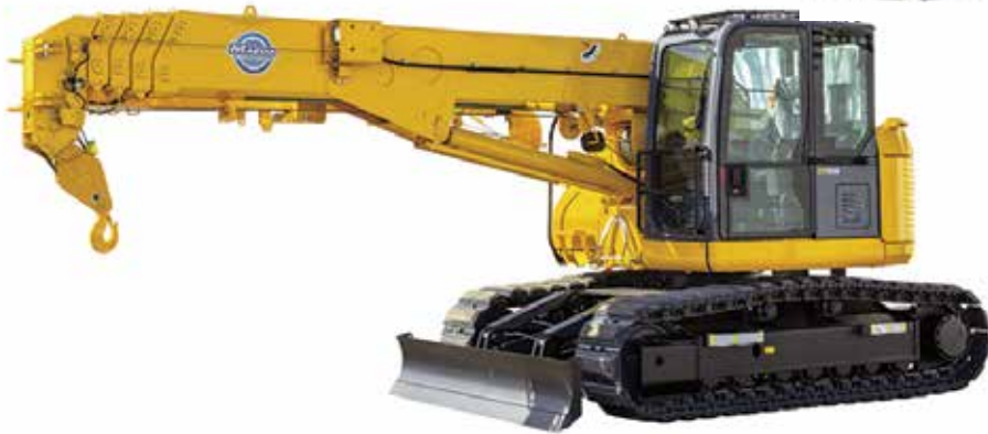
The new Maeda CC1908

It can also pick & carry up to 3.5 tonnes. The crane weighs 19.4 tonnes with optional jib, has an overall width of 2.49 metres with short tailswing. Other features include a fully enclosed air conditioned cab with link slide door, a 10 inch touchscreen display, surround view camera and monitor, extra wide skylight with standard sun shade and visor and is powered by a Yanmar EU Stage V and EPA Final Tier 4 diesel with hydrostatic transmission.