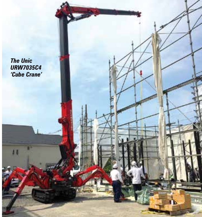
The Unic URW7035C4 'Cube Crane'