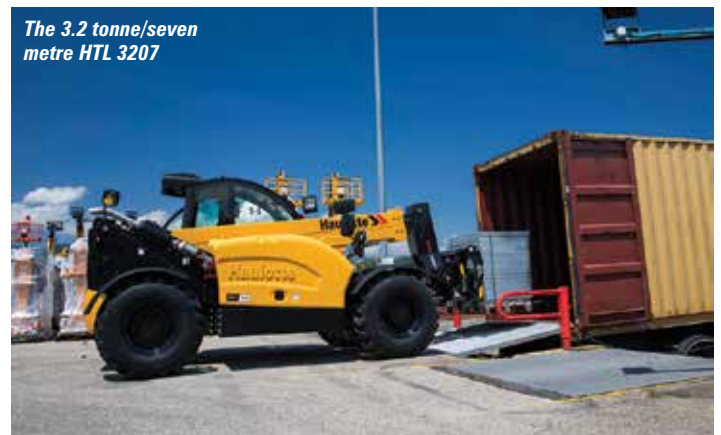
The 3.2 tonne/seven metre HTL 3207