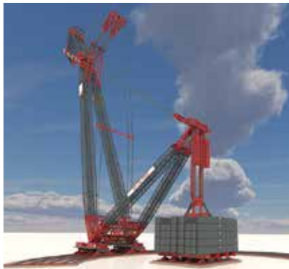
ALE's new 10,000 tonne SK10,000