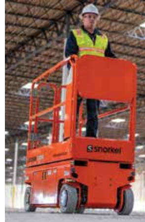
Snorkel's ultra-low S3019E

The new lift has direct electric drive and steer eliminating hydraulic hoses, while extending battery life between recharging. Overall width is 770mm, platform capacity 250kg while the overall weight is 1,581kg with deck extension.