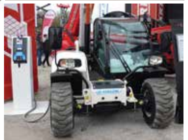
The new Faresin 626 Full Electric telehandler