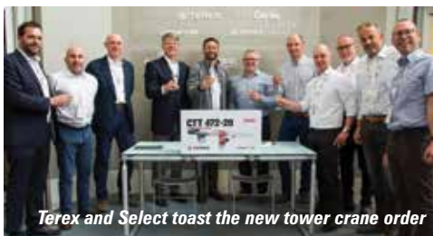
Terex and Select toast the new tower crane order

UK-based Select Crane Hire has ordered nine new Terex tower cranes. The deal, confirmed at Bauma, includes five 18 tonne CTL 272-18 luffing jib tower cranes and four 10 tonne CTT 202-10 flat top cranes.