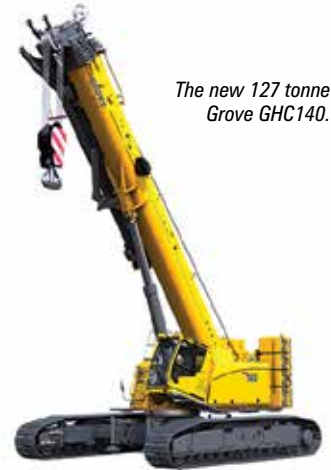
The new 127 tonne Grove GHC140.

A choice of Cummins Tier 4 Final or Tier 3 diesels are available with ECO and Auto Idle modes for improved fuel efficiency. As with other Grove cranes from Sennebogen they will only be available in the Americas.