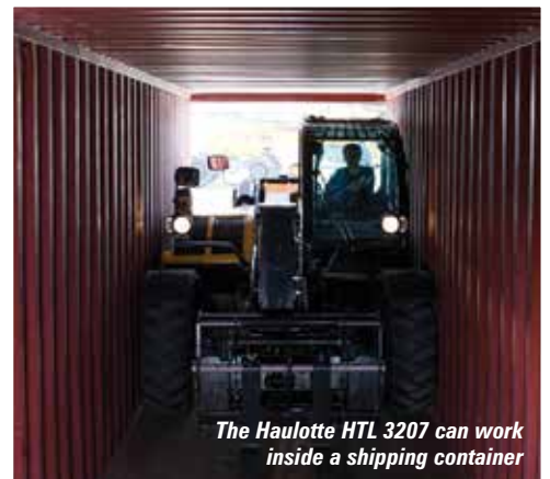
The Haulotte HTL 3207 can work inside a shipping container

The cab is just under a metre wide, and features a large glazed area to maximise visibility, a fully adjustable seat with shock absorbers and 4 in 1 joystick for single handed operation. The load moment indicator includes an automatic cut off when operating in a danger zone, with automatic reset in the case of a malfunction.