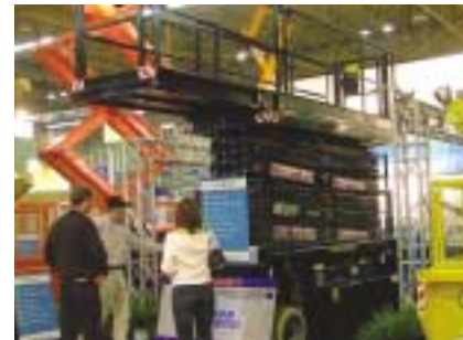
The new 21 metre lift height N19EL120 one of three new big narrow aisle electrics.

lifts and the new Rough terrain models with dual deck extensions were first seen at last years SAIE exhibition in Bologna. The units have been refined and are now in production.