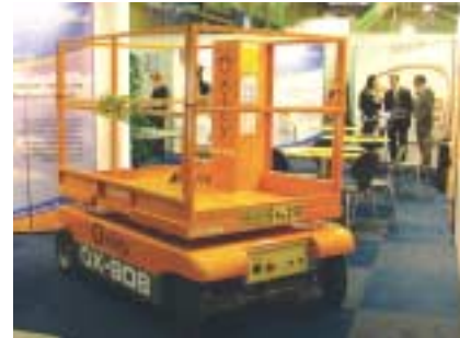
The 980 mast lift from Oxley

A number of mast climber producers attended the show, one company,