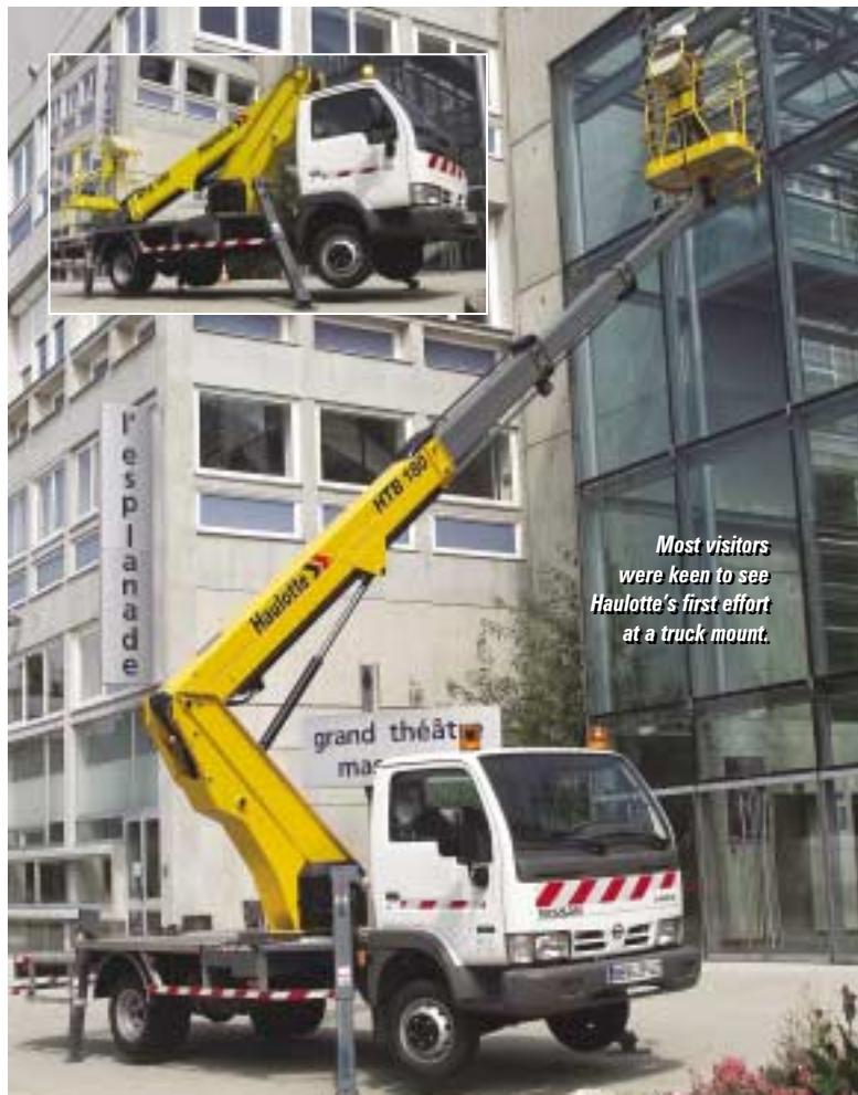
Most visitors were keen to see Haulotte's first effort at a truck mount.