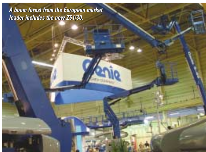
A boom forest from the European market leader includes the new Z51/30.

Most new product introductions came from truck mount producers, topped out by Bronto with its 89 metre lift, the company also announced that it is