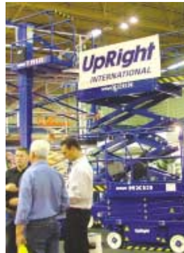
UpRight surprised many with a large stand, including the new self levelling Speed level, and TL50 trailer lift.

Leader also exhibited a patented twin telescopic boom truck mount, designated the Cicogna, with 20 metre work height and 5.7 metre overall length. We understand that RAM, the long established Italian producer, build this unit for Leader. Finally Pagliero debuted an even more radical design for maximum overreach, its new MX 200 has a three section telescopic lower boom mounted to a low profile superstructure and a three section top boom with pedestal mounted platform. The entire lift