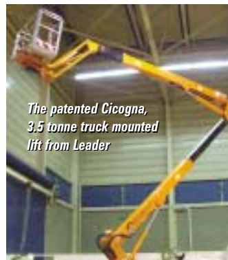
The patented Cicogna, 3.5 tonne truck mounted lift from Leader