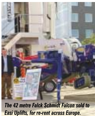
The 42 metre Falck Schmidt Falcon sold to Easi Uplifts, for re-rent across Europe.

The product most visitors were keen to see was Haulotte's first effort at a truck mounted lift. Haulotte has developed a three model line for 3.5 tonne truck chassis, with direct input from its rental company LEV, which operates one of the largest truck mounted fleets in Europe at around 500 units. The three models, the HTB 160, 180 and 200, all of them straight telescopic, offer working heights of 16, 18 and 20 metres.