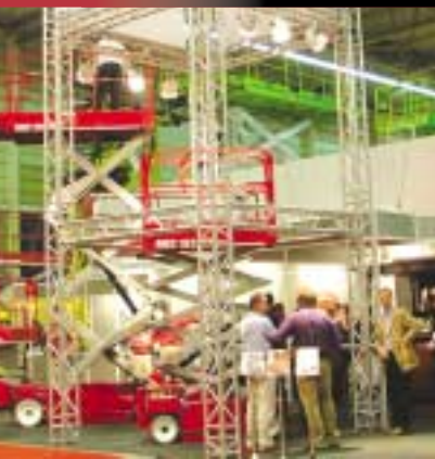
The MEC stand was busy throughout the show.