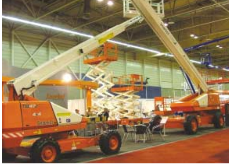
Snorkel made a big show, as part of its return to Europe.

articulating booms were on display, led by CMC with its unique lift mechanism, which includes a three section main boom, two section top boom and a jib with up to 90 degrees of articulation. The design provides a wide working envelope, from around three metres below ground to 21 metres above with an outreach of up to 11 metres. This is the most compact in this category with an overall length of only 5.3 metres.