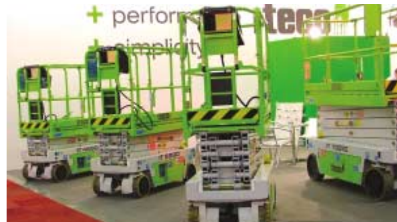
Iteco showed all of its most recent products in a new corporate livery.