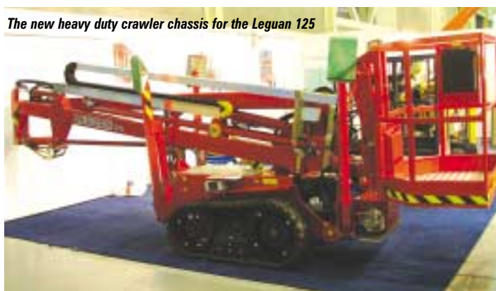
The new heavy duty crawler chassis for the Leguan 125

CTE featured a new mini crawler boom lift, the CS135, its first venture into this market. Other such products came from Leader and Sogage with its upgraded Navaho range. Leguan has also ventured