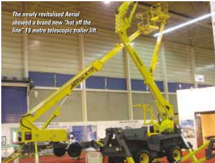
The newly revitalised Aerial showed a brand new "hot off the line" 19 metre telescopic trailer lift.

The new model is only being offered in Europe for the moment and has been produced in response to customer demand following the introduction of 51 ft platform height models from JLG and Manitou.