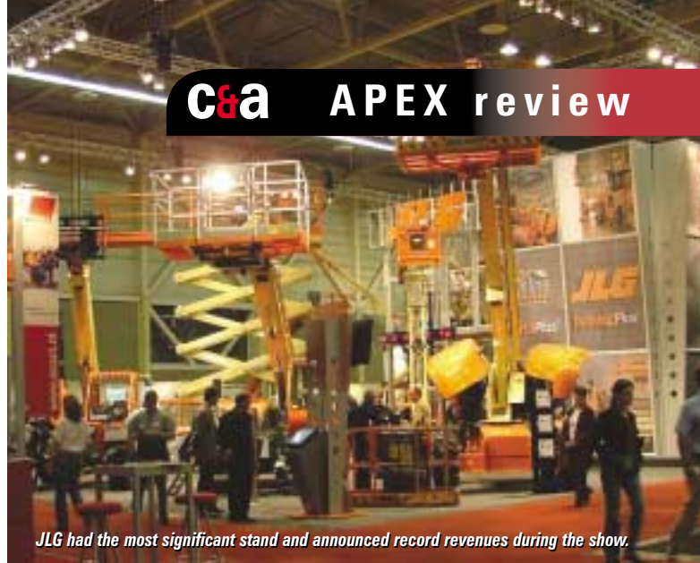
JLG had the most significant stand and announced record revenues during the show.

into this growing market with its 125 a 12.5 metre unit, featuring a heavy duty in-house designed and built chassis. We take a look at this type of lift on page 30. At the top end of the crawler market was the new Teupen Leo 50GT.