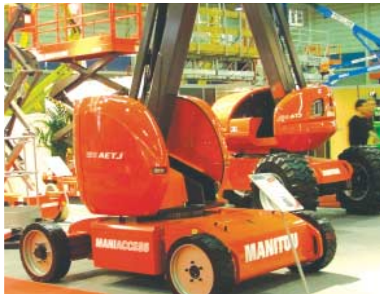
Manitou previewed the 150AETJ, the start of a new electric boom lift line.

offers almost 12 metres of outreach at around six metres lift height. Automatic self levelling is available as is self propelled drive and outrigger setting from the basket. Iteco surprised everyone with a large range of new electric and diesel powered scissor lifts in a totally new corporate livery. The new Micro/mini electric drive scissor