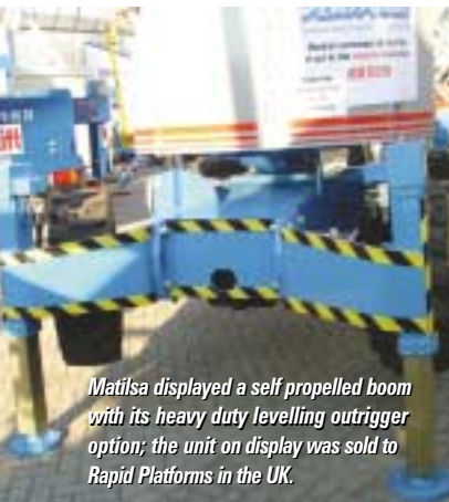
Matilsa displayed a self propelled boom with its heavy duty levelling outrigger option; the unit on display was sold to Rapid Platforms in the UK.

Genie showed its new 51 ft/15.4metre Z51/30 articulated self propelled boom. The new product is a development of its market leading and long established Z45/25. The base machine has been