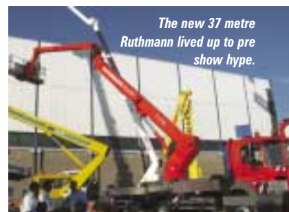
The new 37 metre Ruthmann lived up to pre show hype.

mechanism is constructed from aluminium for minimum weight. The unit measures under 2.5 metres high and six metres long with zero