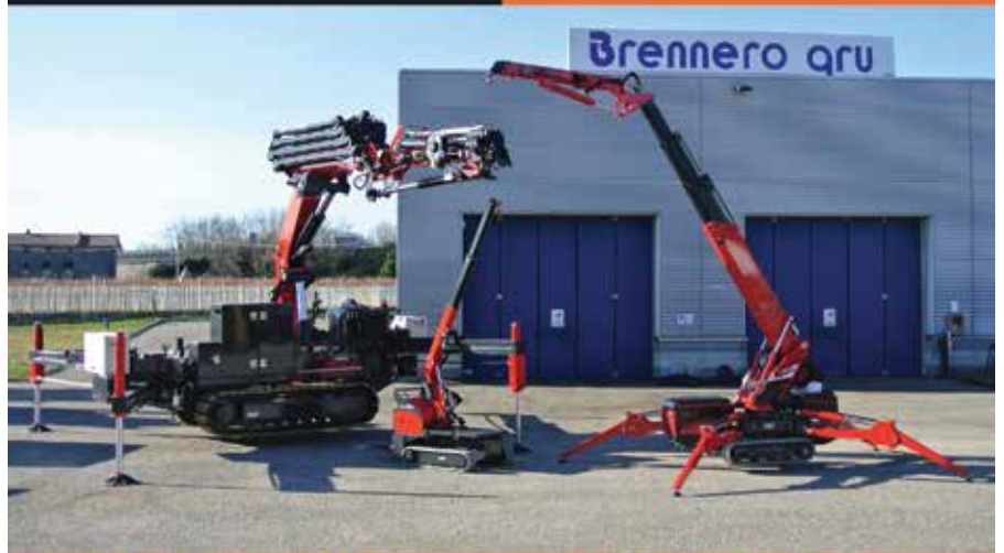
CWE 525: Max hydraulic outreach: m 30 Load capacity Kg 14500 – Easy access: Max width mm 1850 M250: Full hydraulic JIB with 195° opening Max hydraulic outreach m 15.65