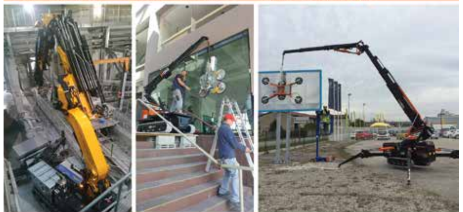
M060: PICK AND CARRY - Max hydraulic outreach: m 3 – Max load capacity Kg 240 – Width mm 780