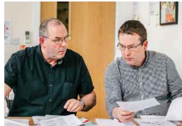
IPAF's UK auditors are ready roll out the new audit regime.

rental businesses and reduce time and cost spent completing other pre-qualifying questionnaires. It also supports or leads to ISO9001, 14001 and 18001 certification.