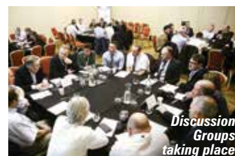
Discussion Groups taking place