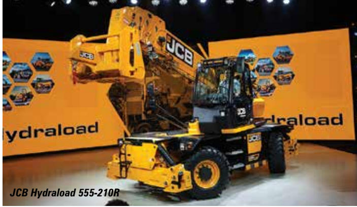
JCB Hydraload 555-210R