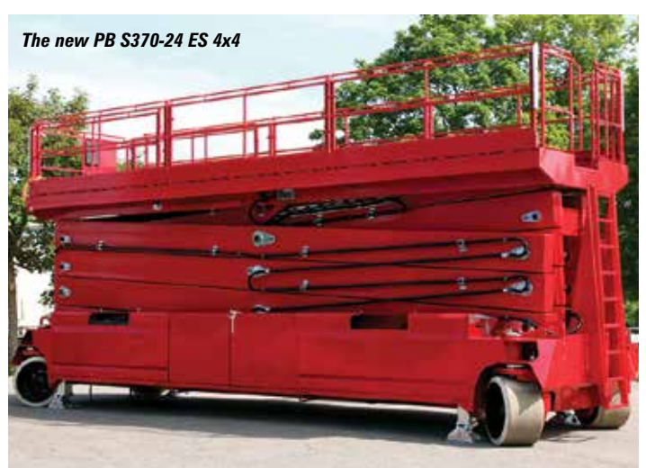
The new PB S370-24 ES 4x4