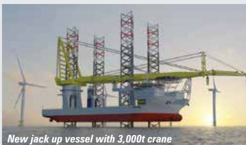
New jack up vessel with 3,000t crane

Benelux-based Jan De Nul has ordered a new offshore jack up installation vessel from China's Cosco. Named Voltaire it will be equipped with a 3,000 tonne crane and have a transport payload of 14,000 tonnes making it the largest in the company's fleet and will be used for the installation of the latest offshore wind turbines. It will also be one of the most environmentally friendly craft afloat with Euro Stage V compliant engines, a Selective Catalytic Reduction system and Diesel Particulate Filters. Delivery is scheduled for 2022.