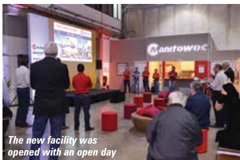
The new facility was opened with an open day