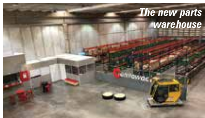
The new parts warehouse

Manitowoc has opened a new support facility in São Paulo, Brazil, for Grove, National Crane and Crane Care. The new facility brings the relevant customer service staff together under one roof and includes offices, a spare parts warehouse and training centre along with space to display cranes.