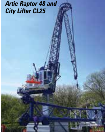
Artic Raptor 48 and City Lifter CL25