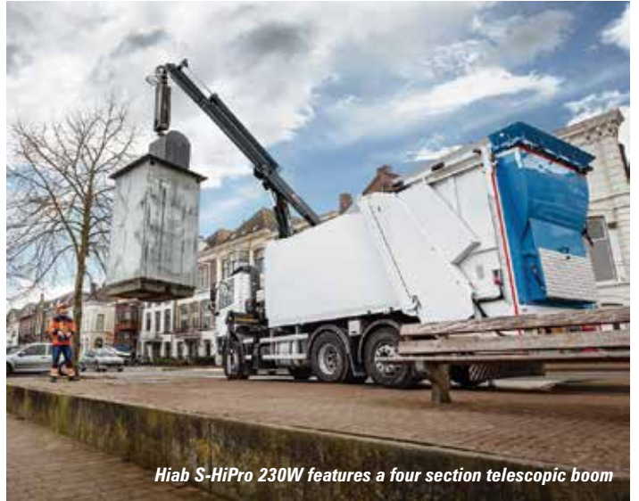
Hiab S-HiPro 230W features a four section telescopic boom

It features a four section full power telescopic boom and the whole crane folds flat on top of the truck's waste hopper. It is also equipped with the latest HiPro remote control system which is aimed at making it easier for novice crane operators to use, along with Hiab's Semi-Automatic Motion system, said to further simplify crane operation.