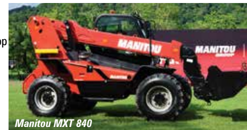
Manitou MXT 840