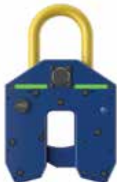
The new 50 tonne Elebia NEO50 automatic hook.

The NEO50 is powered by rechargeable battery, with three hours charging providing enough power for 5,000 cycles or 250 hours in standby mode. A four colour LED indicates battery status. It is also equipped with a fully integrated load cell.