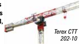
Terex CTT 202-10

Polish tower crane rental company Corleonis has purchased 19 Terex flat top tower cranes including the CTT 91-5, CTT 132-6, CTT 162-8, CTT 561-32 and the new CTT 202-10 which was launched at Bauma.