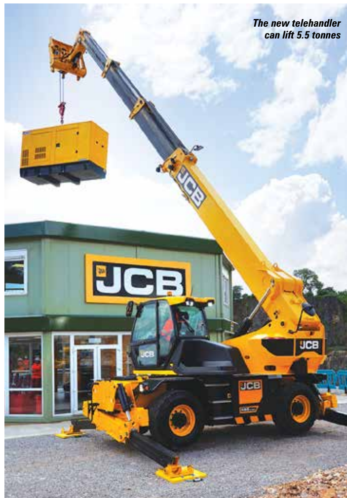
The new telehandler can lift 5.5 tonnes

A range of specially developed RFID technology attachments are available that can be identified by the machine and then automatically offer the correct load chart for safe operation.