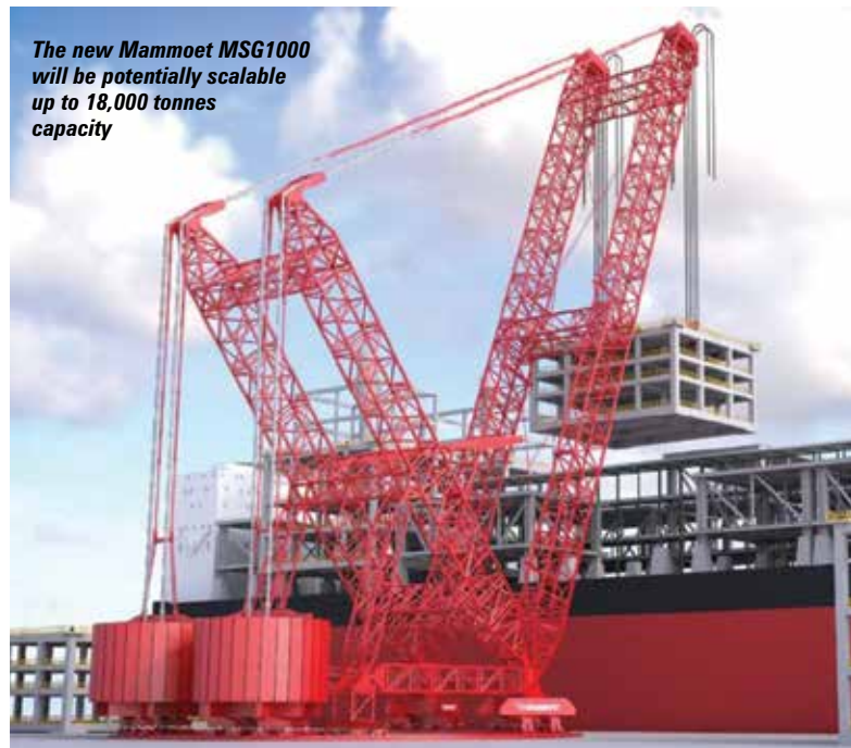
The new Mammoet MSG1000 will be potentially scalable up to 18,000 tonnes capacity

functionality and explore additional developments. The announcement of the new crane came just 24 hours after rival ALE unveiled its plans for a 10,000 tonne SK10,000. (See Heavy Lift feature on page 17) Global director market development and innovation Jacques Stoof said: "The MSG80 and PTC cranes have revolutionised construction and maintenance efficiency in the past decade. However, we see from developments in modular