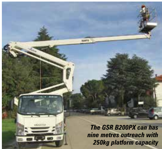
The GSR B200PX can have nine metres outreach with 250kg platform capacity

The platform is now available on a 3.5 tonne Isuzu M21 chassis which has an overall length of 6.8 metres, compared to 7.65 metres when mounted on the Mercedes Sprinter chassis. It is also available on the Nissan NT400, Renault Maxity and Iveco Daily chassis.