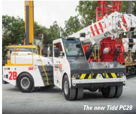
The new Tidd PC28