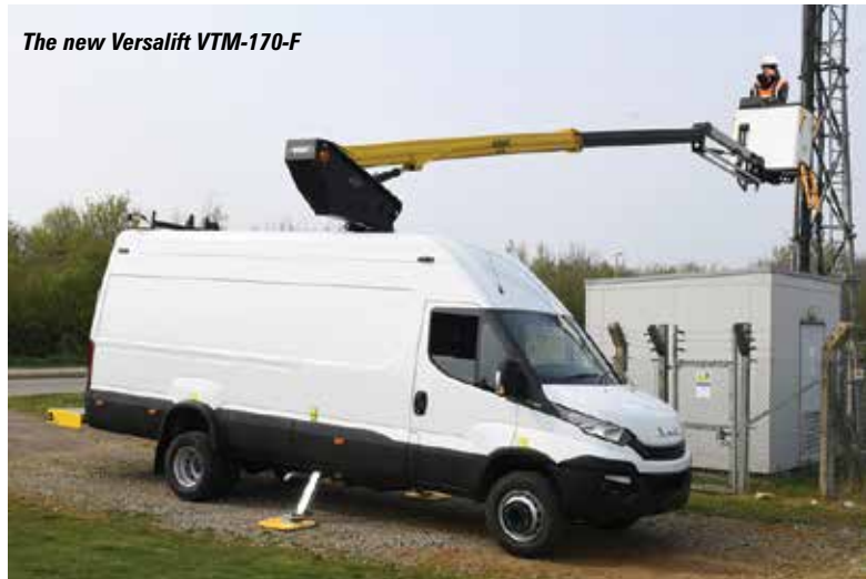
The new Versalift VTM-170-F

Andy Bray of Versalift said: "The VTM-170-F is ideally suited for motorway and dual carriageway use, equipped with intuitive LMC load sensing providing variable outreach based on pressure in the boom lift cylinder. Other features include zero tail swing and the choice of walk in or duck under bucket."