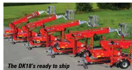
The DK18's ready to ship

The DK18 was chosen because it offers 11.3 metres of outreach with an unrestricted platform capacity of 200kg and yet weighs just 1,975kg, made it ideal for working on the upper decks of the gantries, while its overall width of 1.86 metres also made it easy to ship to the remote location in standard sea containers.