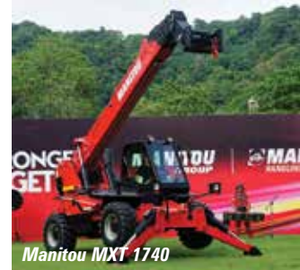
Manitou MXT 1740

Product manager Kévin Arnou, said: "Our ambition is to develop the telehandler market through models that are easy to use, robust and that have a total ownership cost suitable to the local users."