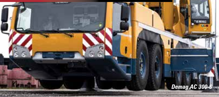
Demag AC 300-6