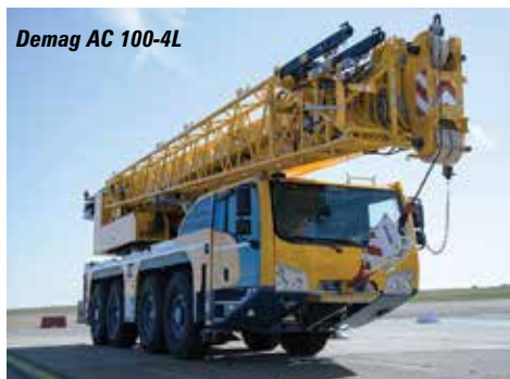
Demag AC 100-4L