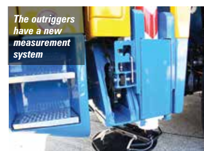
The outriggers have a new measurement system