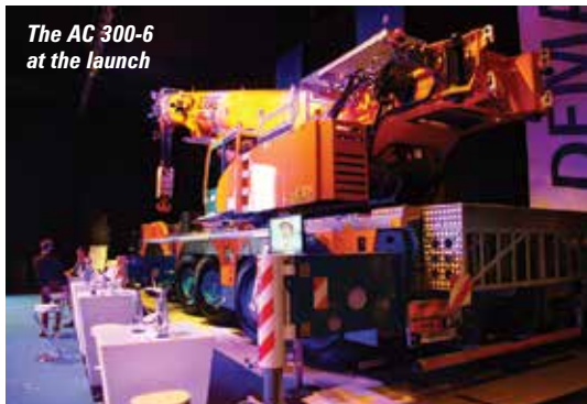
The AC 300-6 at the launch

momentum across Terex. All three segments - Cranes, AWP and Materials Processing - increased sales, improved operating margins and grew backlog," says Garrison.