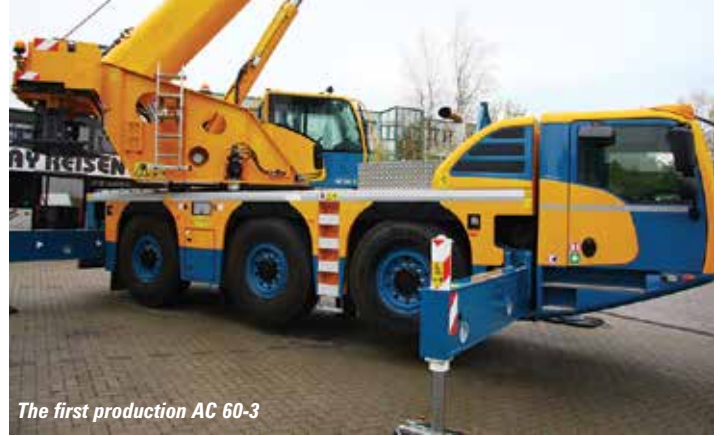
The first production AC 60-3