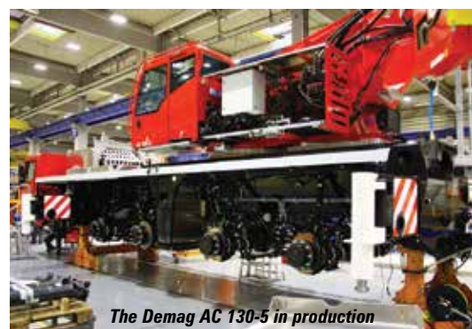
The Demag AC 130-5 in production

"Our third quarter financial results demonstrate the accelerating