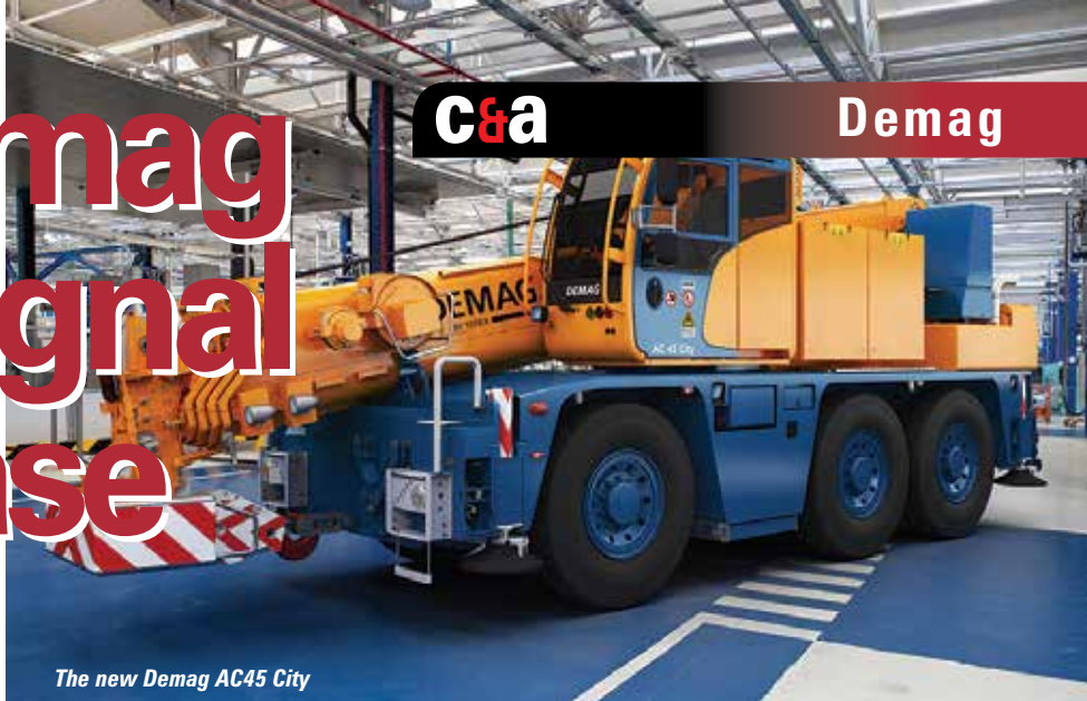
The new Demag AC45 City

Terex Cranes launched several new cranes earlier this month, including the new AC 45 City. Is this the start of a new 'Demag' era for the company or is it just papering over the cracks? Mark Darwin reports from the company's facility in Watterscheid, Germany.