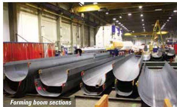
Forming boom sections

"Having completed the first element of our strategy - focusing the portfolio on our three core segments - our strategy deployment efforts are now concentrated on simplifying the company and implementing our 'Execute to Win' business system. Footprint consolidation progress in the quarter included completing the sale of manufacturing locations in Jinan, China and Bierbach, Germany. Used and refurbished cranes will be moved from Bierbach to the crane facility in Watterscheid, and parts will be run like a business and not an 'after thought', sharing the Genie facility in Roosendaal, the Netherlands which should be up and running by the middle of next year.