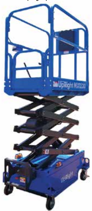
The new UpRight products are built by Mantall and badged by Instant UpRight.

by Mantall and badged by Instant UpRight hence they are not actually newly designed models. The 13ft MX1330 push around is larger than the original lifts having a six metre working height and weighing 565kg, although the 240kg platform capacity is the same. Platform size is 1.15 metres long by 760mm wide, it has a stowed height of 1.94 metres and is powered by a 12 volt/100 Ah battery. Of the new selfpropelled range, the 14ft MX1430 has an overall width of 760mm, an overall length of 1.49 metres and weighs 810kg and features a good standard specification. It has a 240kg platform capacity with 100kg on the 550mm platform extension. The MX1930 may remind some