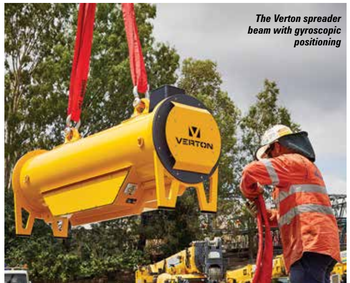
The Vertron spreader beam with gyroscopic positioning