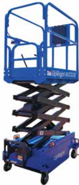
The UpRight MX1330 push around scissor lift

The new platforms are manufactured for the company by Chinese manufacturer Mantall and will be available in Europe from an inventory at a new European warehouse and distribution hub that the company has set up in Venlo, the Netherlands operated by Seacon Logistics. The facility will also stock a full range of replacement parts for the new scissors along with the company's range of tower related access products. It will also be home to a technical help desk. A further technical support team for the powered access products will be based at the company's Dublin headquarters where it has moved into a new 10,000 square metre manufacturing facility. The initial focus will be on European and Asian markets selling to small and medium sized rental companies both direct and through dealers.