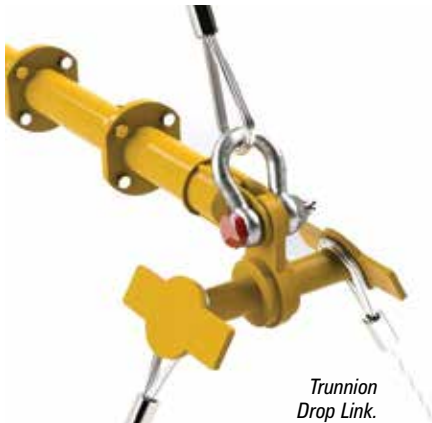
Trunnion Drop Link.

The Trunnion Drop Link is an alternative trunnion option that can be quickly attached to a sling. It requires one top shackle instead of two, allowing for safer and quicker sling attachment and is compatible with Modulift spreader beams from the MOD6 up to MOD110 with a capacity of up to 55 tonnes. It also works with flat webbing slings up to the MOD50 and wire rope and synthetic slings up to the MOD110.