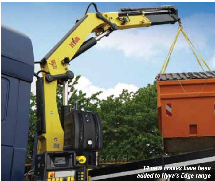
14 new cranes have been added to Hyva's Edge range