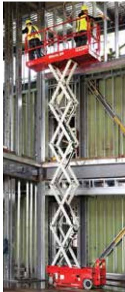
The new MEC Micro 26

As with the smaller Micro models, drive is direct electric for long battery life between recharges and fewer hoses reducing the chance of leaks. The company's new Leak Containment System is also available as an option.