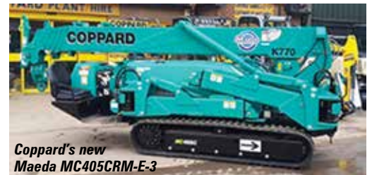
Coppard's new Maeda MC405CRM-E-3

Kranlyft has also sold the first 3.83 tonne Maeda MC405CRM-E-3 spider crane to UK-based rental company Coppard Plant Hire. The MC405CRM can lift its maximum capacity at a radius of 2.7 metres, while its maximum radius is 16 metres, with power coming from an EU Stage V compliant diesel.