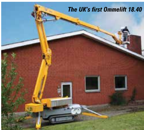
The UK's first Ommelift 18.40

Delivered by UK distributor Access Platform Sales (APS), the lift has been already gone out on its first job, inspecting new build houses. The 18.40 has a 10.5 metre outreach and 200kg capacity. It is 4.85 metres long, 790mm wide and just under two metres high. In the hybrid version it weighs 2,900kg.