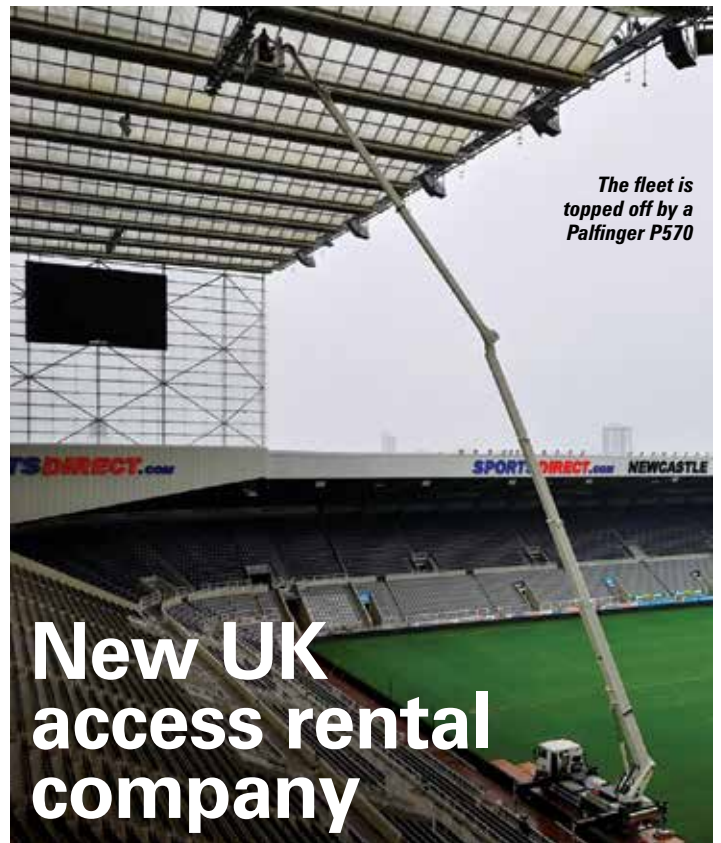
The fleet is topped off by a Palfinger P570