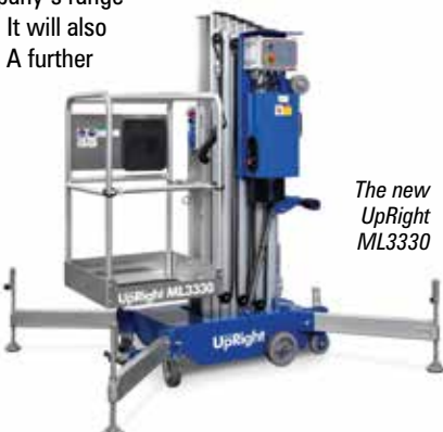
The new UpRight ML3330