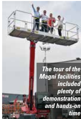
The tour of the Magni facilities included plenty of demonstration and hands-on time