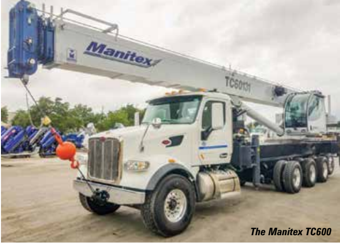
The Manitex TC600