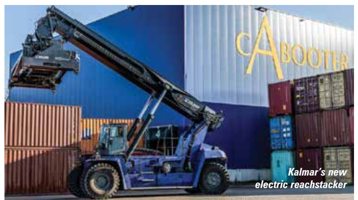
Kalmar's new electric reachstacker