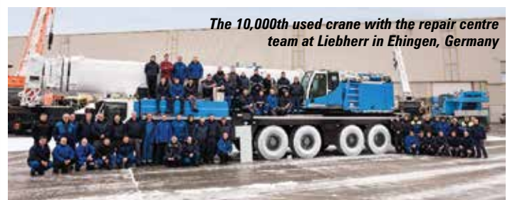
The 10,000th used crane with the repair centre team at Liebherr in Echingen, Germany