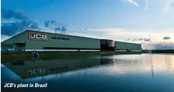
JCB's plant in Brazil