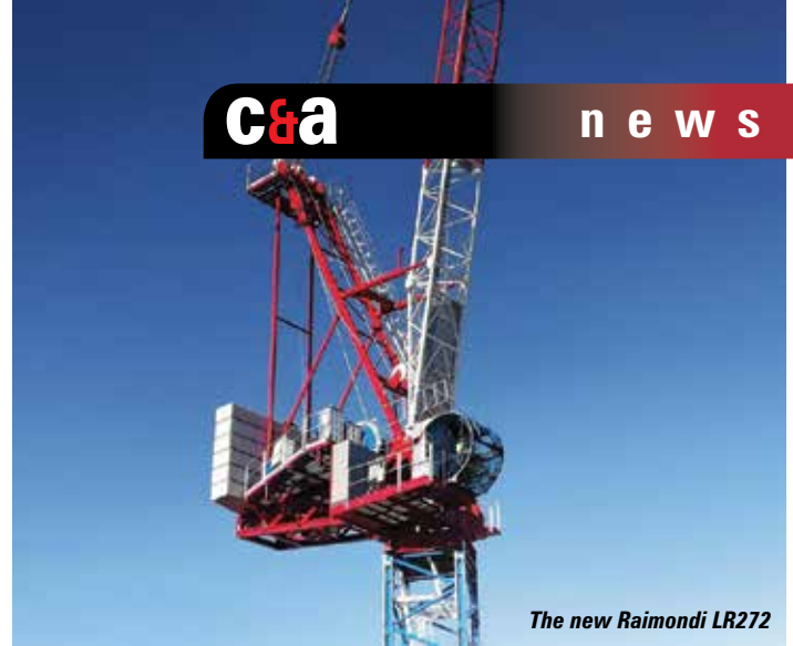
The new Raimondi LR272