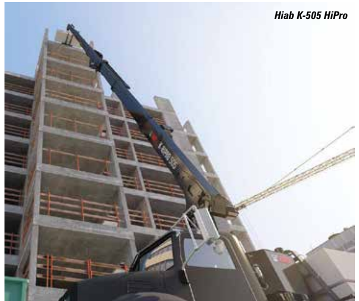
Hiab K-505 HiPro