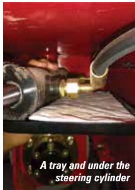
A tray and under the steering cylinder