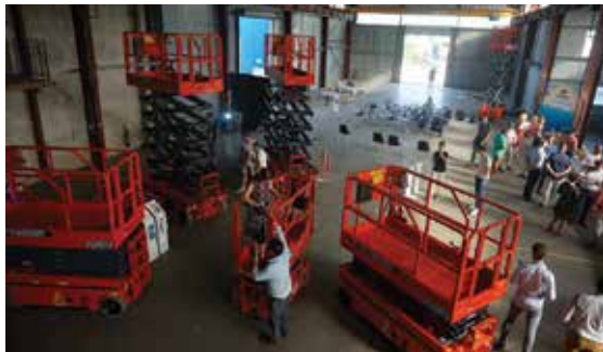
Sinoboom officially opened its wholly owned subsidiary Sinoboom France last month with an Open Day at its premises in Tonneins.

The 2,000 square metre facility includes a showroom, paint shop and maintenance/service area with offices located nearby. The company has started with seven employees. Eight Sinoboom electric scissor models ranging from 12 to 46ft will initially be available in France, with additional models added in the near future including a mast boom.