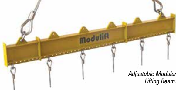
Adjustable Modular Lifting Beam.

Spreader beam manufacturer Modulift has launched two new products, the Adjustable Modular Lifting Beam and the Trunnion Drop Link. The adjustable lifting beam offers the same flexibility and benefits as existing Modulift spreader beams but features multiple pad eyes so that the beam can be adapted to lift various weights and sizes. Three models are available - light up to 50 tonnes, medium up to 170 tonnes and heavy up to 240 tonnes. It has a maximum span of 19 metres and can be used either as a lifting beam or a semi spreader beam.