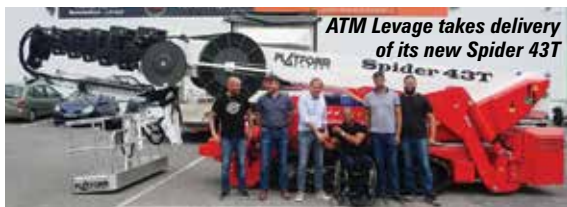
ATM Leverage takes delivery of its new Spider 43T