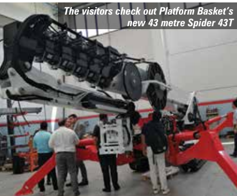
The visitors check out Platform Basket's new 43 metre Spider 43T

The group also visited the Magni Telehandlers facility in Castelfranco Emilia near Modena, as Dingli is also the exclusive distributor for Magni in China and holds a 20 percent equity stake in the telehandler manufacturer. The Magni facility is also home to the Dingli European (Italy) R&D centre, which has designed the latest range of Dingli's European specification boom lifts.