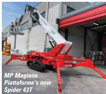
MP Magione Piattaforme's new Spider 43T

MP Magione Piattaforme's opted for the hybrid version with lithium ion batteries.