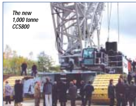
The new 1,000 tonne CC5800

In addition to its impressive plans for the larger models in the 800 series, Terex is also planning some developments to its smaller models, with a Narrow track (NT) version of its 600 tonne CC2800-1 and a "power kit" for the boom which adds stronger boom sections near the base.