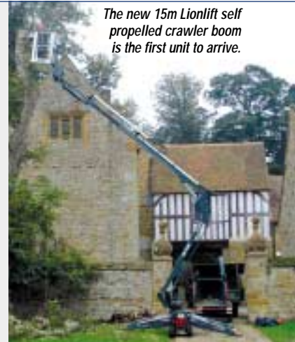
The new 15m Lionlift self propelled crawler boom is the first unit to arrive.