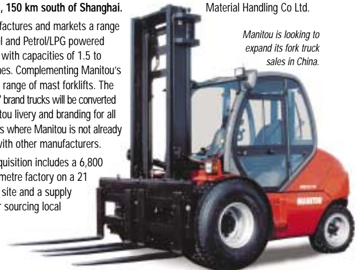
Manitou is looking to expand its fork truck sales in China.

components. The company also plans to establish a commercial entity, in order to accelerate the sales of Manitou products in China. The current managing director will retain a 10 percent holding, and the company will be renamed Manitou Hangzhou Material Handling Co Ltd.