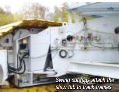
Swing out legs attach the slewing tub to track frames

Terex has announced a massive programme to develop its 1,000 tonne plus crawler crane range.