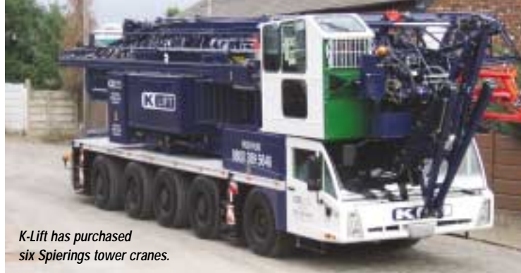
K-Lift has purchased six Spierings tower cranes.

Cross Lane, Tong, Bradford, West Yorkshire BD4 0SU. Tel: 01274 683131. Fax: 01274 651006. E-mail: handusales@eu.gardnerdenver.com www.eu.gardnerdenver.com