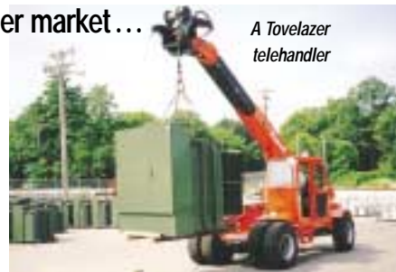
A Tovelazer telehandler

Thomas has also agreed to expand its strategic OEM agreement with Hyundai Heavy Industries, Ltd, to include the Tovel line of products. Hyundai purchases Thomas products to market under its own brand. Tovel, which is based in Concord near Toronto, was founded in 1970 to build 4x4 Rough Terrain masted forklifts and entered the telehandler market in 1990.