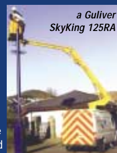
a Guliver SkyKing 125RA

See www.vertikal.net news archive for full versions of all these stories