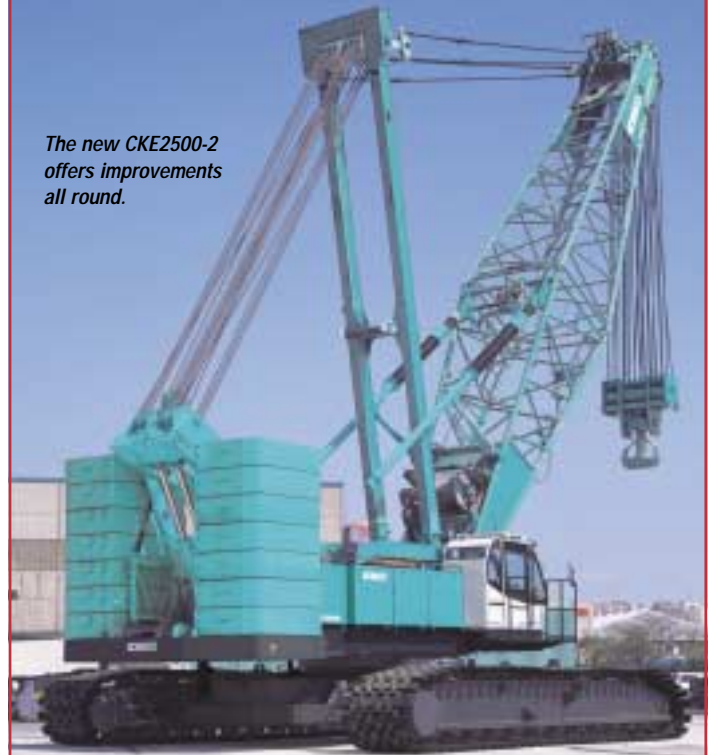
The new CKE2500-2 offers improvements all round.