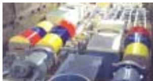
First cranes from the New Liebherr plant in Rostock.

The new plant has a total area of 220,000 square metres, fabrication, assembly and painting are currently carried out in a single building. A large assembly shop and the administration building are under construction and are due for completion by the end of the year. A total of 214 employees are already at work in Rostock, with additional staff undergoing training in Nenzing/Austria.