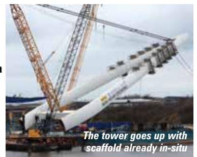
The tower goes up with scaffold already in-situ