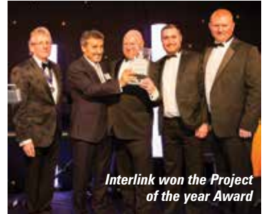
Interlink won the Project of the year Award

The NASC 2017 Scaffolding Project of the Year Award was won by Interlink Scaffolding for its work on the New Wear Crossing in Sunderland, where it installed multiple scaffolds on the central support tower prior to it being erected. There were 12 entries in all, with just three points separating the first three. In the view of the judges, Interlink's 'Interface with the client' was one of the key criteria in its success, they were also impressed by the degree of off-site preparation prior to erection of the bridge structure, complete with scaffolding.