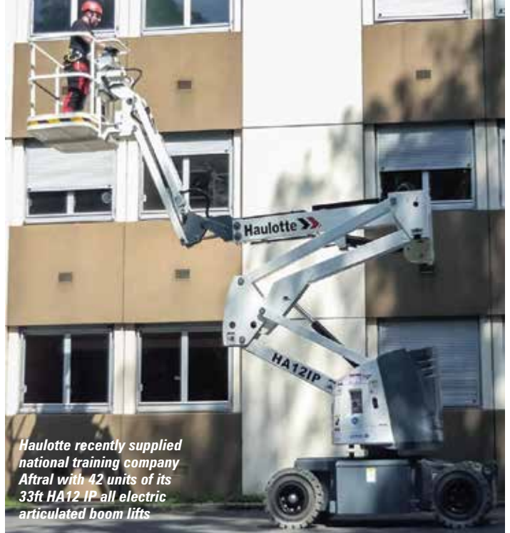
Haulotte recently supplied national training company Aftral with 42 units of its 33ft HA12 IP all electric articulated boom lifts

Haulotte says that its customer feedback in the UK generally acknowledges that non diesel aerial work platforms are the future. Since the bold statement of 'no more diesels' made at the launch of the Blue Orientation strategy and the all electric HA20 LE 'many end users and rental companies have assumed that all Haulotte machines will be