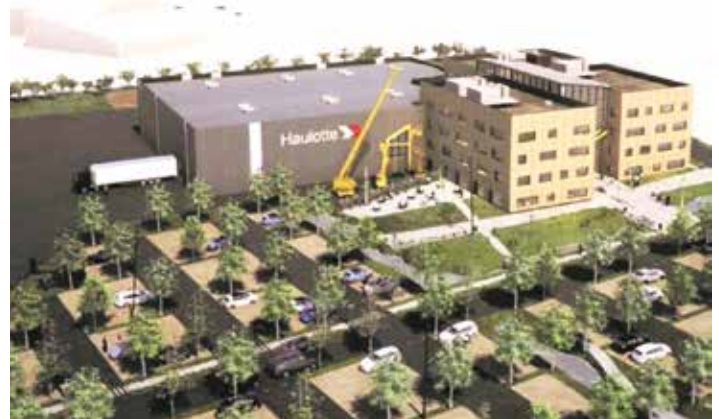
An artists impression of the new global headquarters in Lorette which includes a new research and development centre.