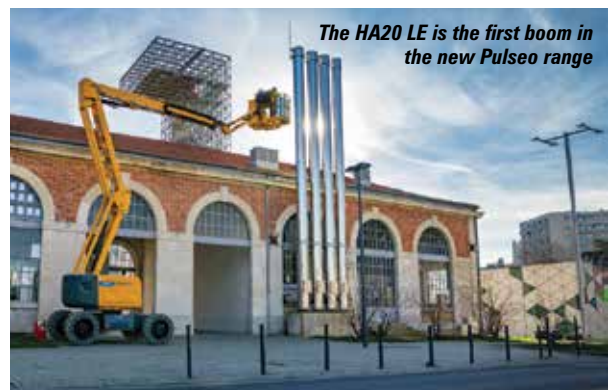
The HA20 LE is the first boom in the new Pulseo range