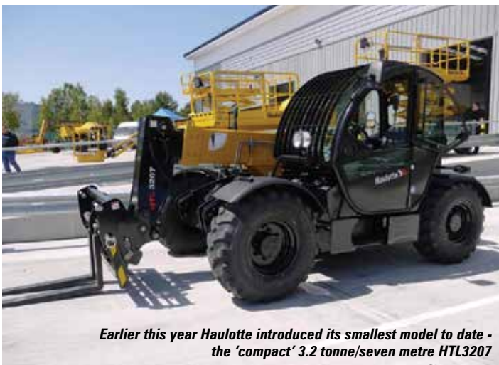
Earlier this year Haulotte introduced its smallest model to date - the 'compact' 3.2 tonne/seven metre HTL3207

With JCB, Manitou and Merlo being so dominant Haulotte - like many other telehandler manufacturers that entered the market late - has