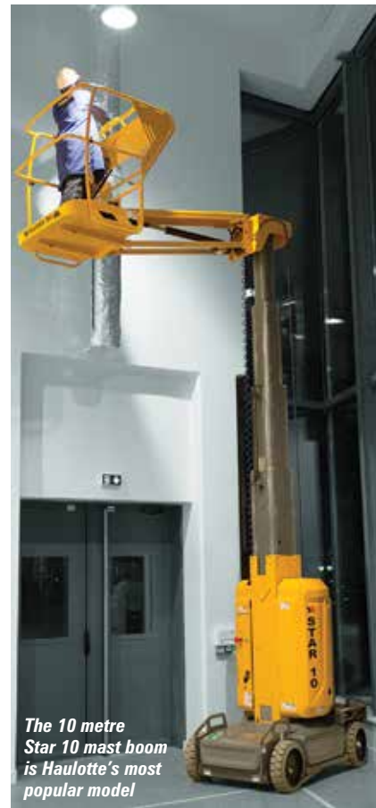
The 10 metre Star 10 mast boom is Haulotte's most popular model

It will be interesting to follow sales figures and take up of its electric work platforms. If slower than anticipated would this mean that older existing models will have their lifespan extended, rather than being replaced with potentially a less popular electric/hybrid versions? The company prefers not to comment. The market however is changing rapidly, so perhaps Haulotte has timed its new strategy perfectly?