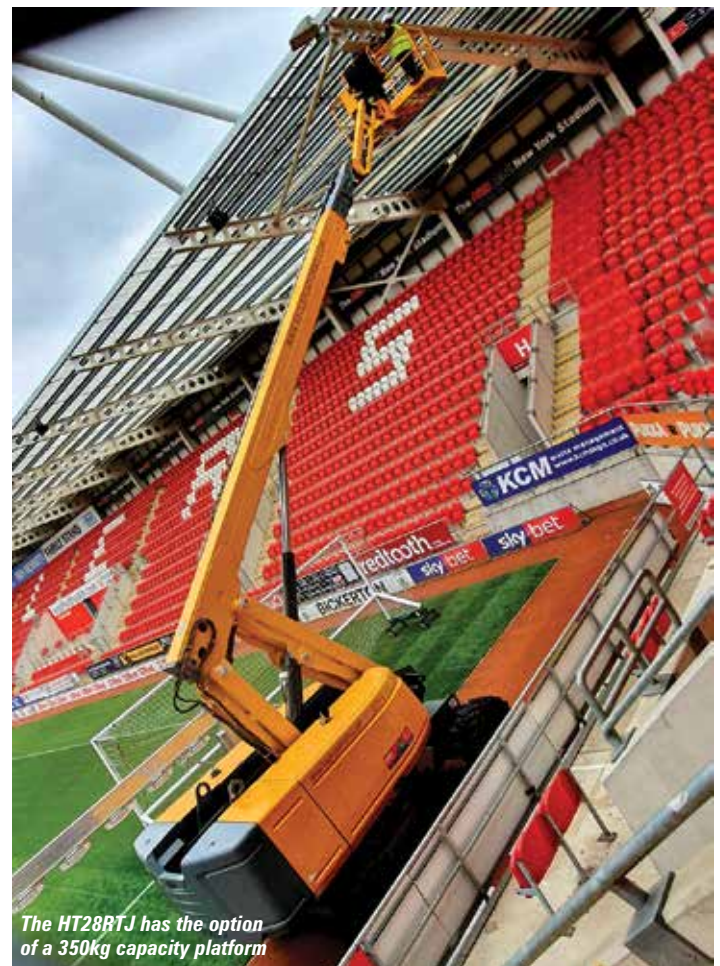
The HT28RTJ has the option of a 350kg capacity platform