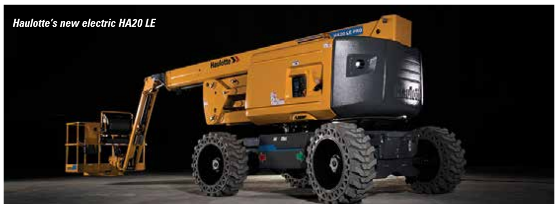
Haulotte's new electric HA20 LE

The first model in Haulotte's new electric Pulseo range is the 61ft HA20 LE and LE Pro articulated booms. Two of the first LE Pro units were ordered by Indian rental company Shakti Equipments at the end of 2018. However Germany appears to be one of the best markets for the new boom, as might be expected. It is also Niftylift's largest hybrid market. German rental company Udert Mietgeräte is one of several companies to have already ordered the HA20 LE Pro and the latest to have taken delivery.