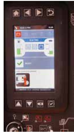
Part of the HA20 LE's control panel showing fuel and battery charge remaining.

Haulotte's policy of phasing out diesel models after 2020 is a bold and brave move and from an environmental point of view certainly puts it ahead of most competitors. It will be interesting to view how well each new 'electric'