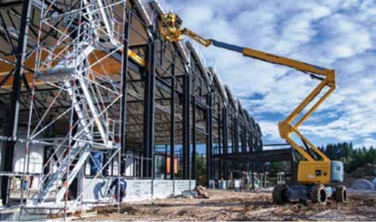
The HA20 LE has a small Stage V 'range extender' diesel engine that simply tops up the batteries