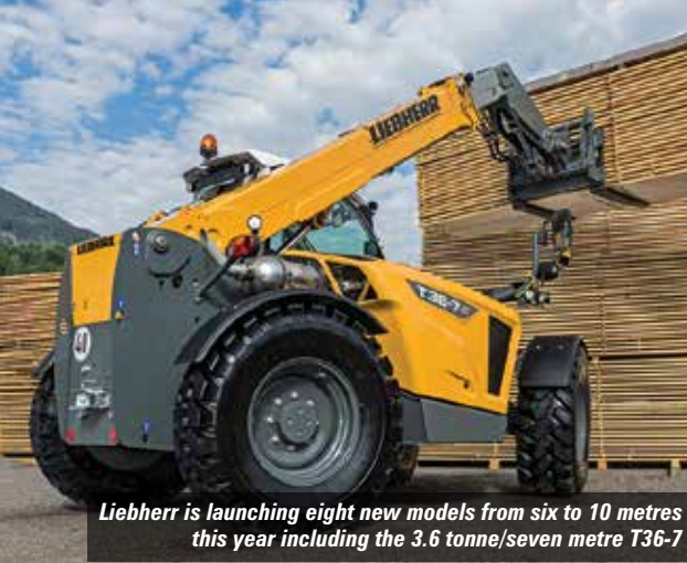
Liebherr is launching eight new models from six to 10 metres this year including the 3.6 tonne/seven metre T36-7