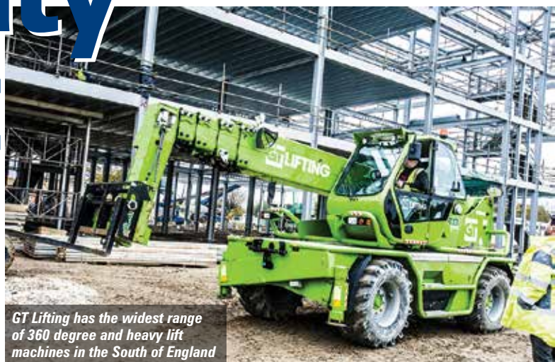
GT Lifting has the widest range of 360 degree and heavy lift machines in the South of England