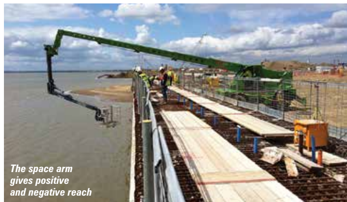
The space arm gives positive and negative reach