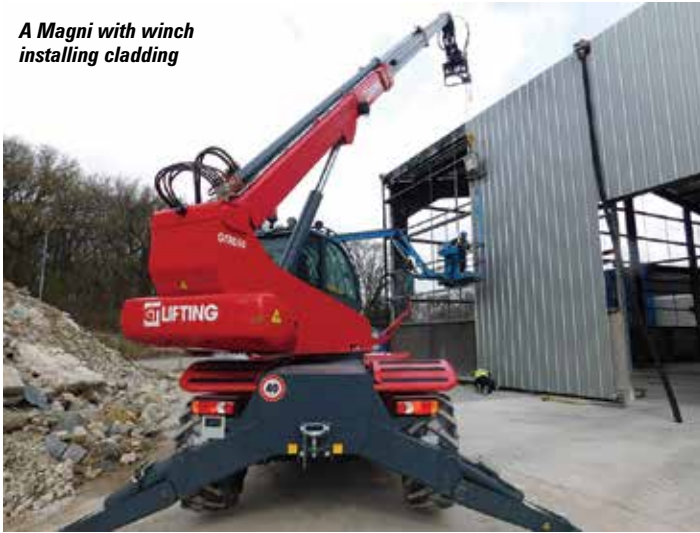
A Magni with winch installing cladding