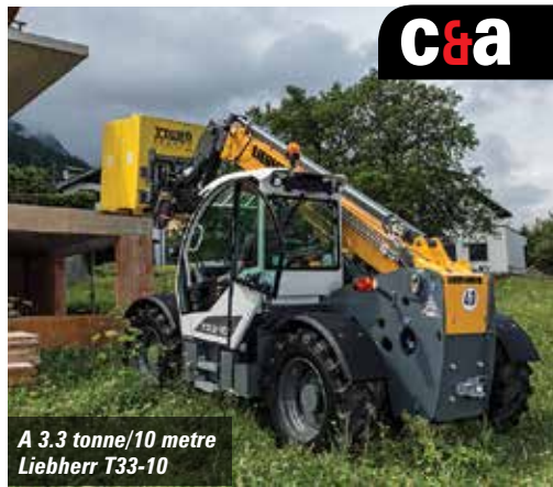
A 3.3 tonne/10 metre Liebherr T33-10