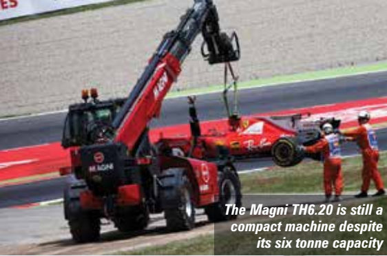
The Magni TH6.20 is still a compact machine despite its six tonne capacity