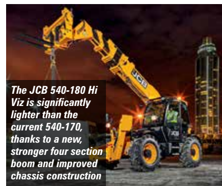
The JCB 540-180 Hi Viz is significantly lighter than the current 540-170, thanks to a new, stronger four section boom and improved chassis construction

JCB claims that its telescopic handlers with its Smart Power 55kw/74hp EcoMAX diesels are achieving fuel consumption of 4.1 litres an hour, from an engine that requires no after-treatment, catalyst or particulate filter. It is fitted to the new 17.5 metre 540-180 Hi Viz model, with 13.5 metres of forward reach, while handling a 2,500kg load at full height. Weighing 11,330kg the new model is significantly lighter than the current 540-170, thanks to a new, stronger four section boom and improved chassis construction. Other features include a reduced turning circle and 20 percent faster cycle times, while servicing costs beyond 1,000 hours are said to be half that of the current model. A regenerative smart hydraulic system on the optional single lever control uses gravitational force on boom lower and retract functions to reduce the energy required. The 540-180 is also more compact, at 2.35 metres wide and 6.26 metres long, allowing two machines to be transported on a single curtain side truck or low loader.