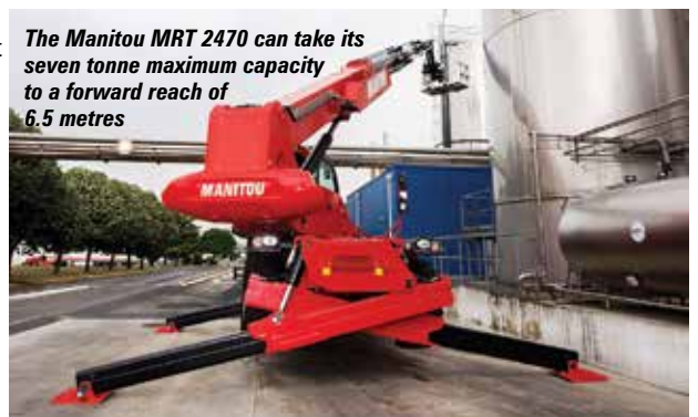
The Manitou MRT 2470 can take its seven tonne maximum capacity to a forward reach of 6.5 metres

translate into a physically larger machine. It is marginally wider, but 310mm shorter, surprising given that it has a four section, boom compared to the five section on the JCB. In terms of overall weight it is not surprisingly 1,515kg heavier.