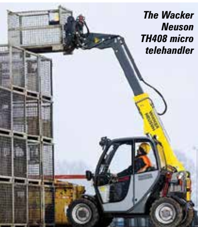
The Wacker Neuson TH408 micro telehandler

Given the Magni and Manitou are both 20 metre fixed frame telehandlers they are quite different beasts. The additional two tonnes lift capacity for the Magni does not