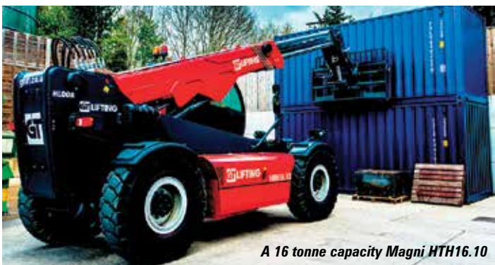
A 16 tonne capacity Magni HTH16.10

According to Porter, there is a serious lack of training on 360 degree telehandlers and attachments although there is a working group being put together by