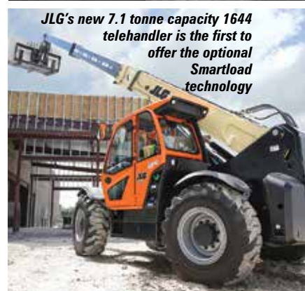
JLG's new 7.1 tonne capacity 1644 telehandler is the first to offer the optional Smartload technology