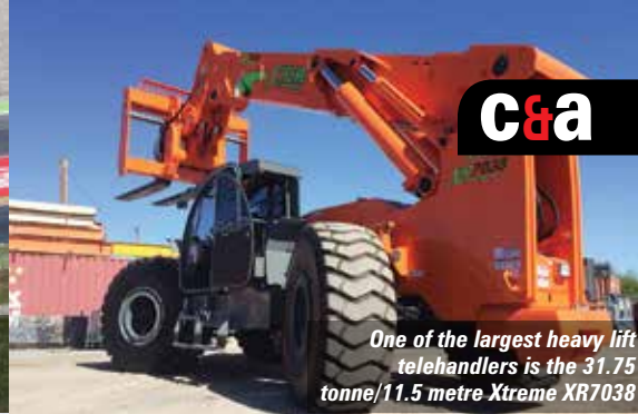
One of the largest heavy lift telehandlers is the 31.75 tonne/11.5 metre Xtreme XR7038