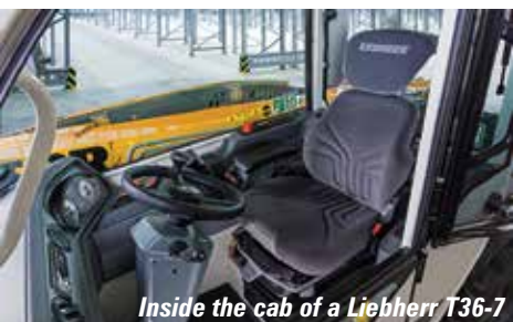
Inside the cab of a Liebherr T36-7