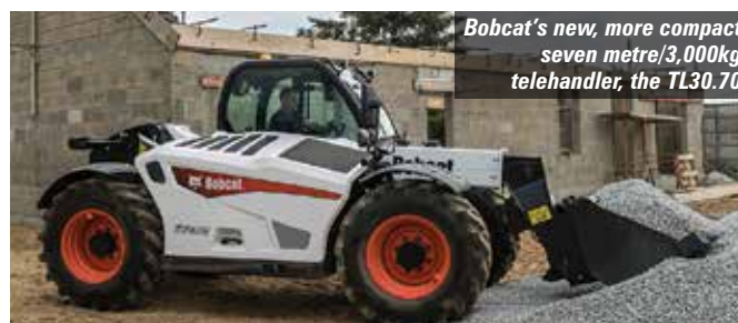
Bobcat's new, more compact seven metre/3,000kg telehandler, the TL30.70

and weight of the load sensing system, which checks the status several times a second. A new aluminium extendable aerial work platform offers a 365kg/three person platform capacity.