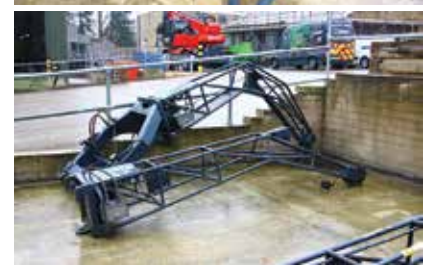
A selection of attachments.