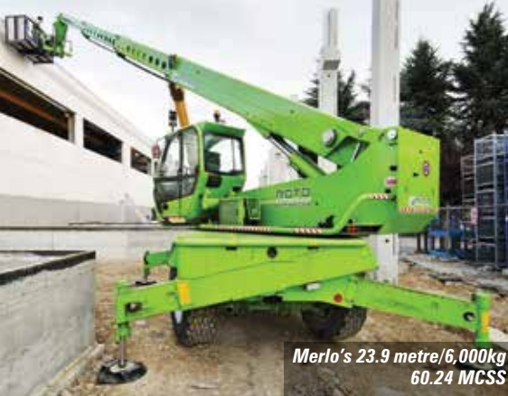
Merlo's 23.9 metre/6,000kg 60.24 MCSS

lack of competition the company expects to see strong growth in sales of its top end machines which also includes a 39 metre model.