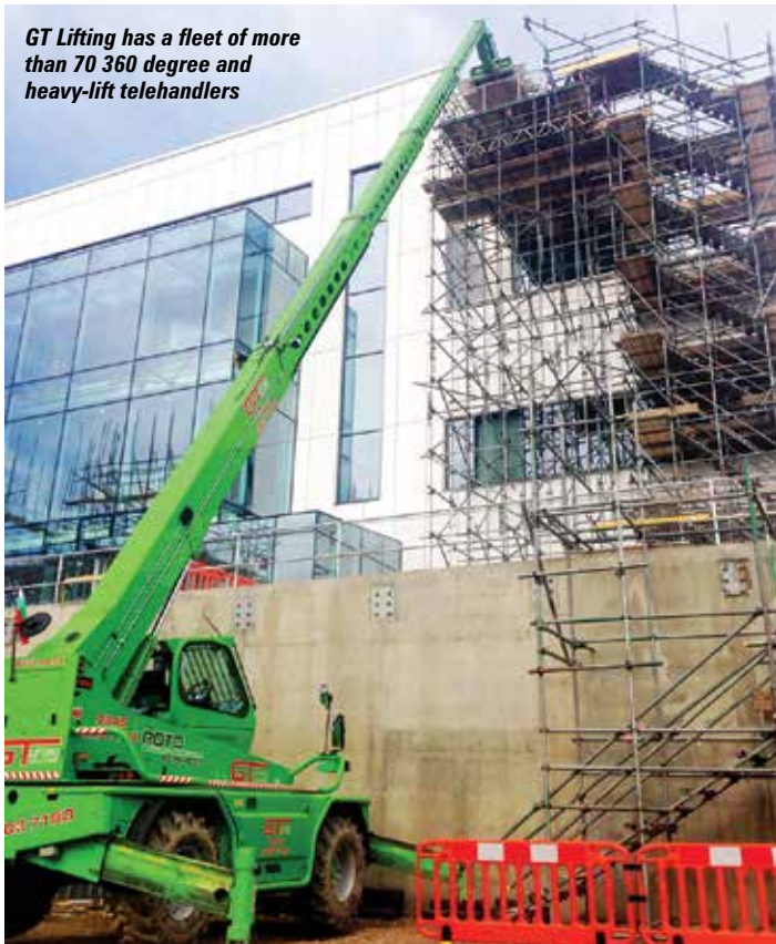
GT Lifting has a fleet of more than 70 360 degree and heavy-lift telehandlers

"We carry out simulated lifts and live tests for contract lifts, supplying engineers with site specific ground bearing pressures. We can calculate them without testing, but there are so many variables, so we have invested in equipment and can provide a readout of actual forces present when the machine and attachment is in the required position with load. If working on a suspended slab, underpropping may be required so exact information is essential and the only way to be certain is to actually carry out a live test. We have asked Magni about in cab readouts of the pressure on each outrigger and the actual load with real time information, I think you will see this feature soon."