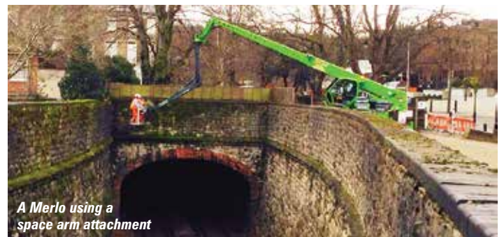
A Merlo using a space arm attachment

So why use a 360 degree telehandler rather than a crane, particularly if you have to go through exactly the same procedures and paperwork?