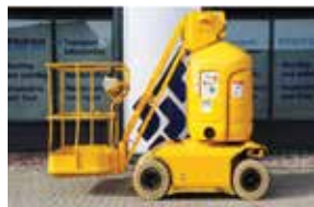
MANITOU - 105VJR2 Vertical mast lifts

Electric, 4x2 Drive, 10.0m Working Height, 2004 | PHM-Id 09285