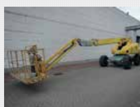
V21134 - Haulotte H23TPX - 2007