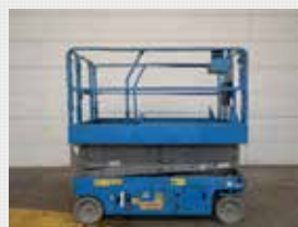
V24141 - Genie GS2646 - 2006