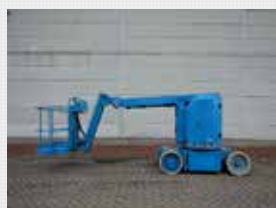
V23798 - Genie Z30-20N - 2000