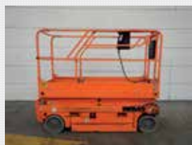
V23822 - Haulotte Compact 8 - 2007