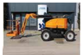
ATN - ZEBRA 12 Articulating boom lifts

Diesel, 4x4 Drive, 12.0m Working Height, 2013 | PHM-Id 09215