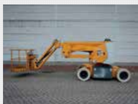
V24169 - Haulotte HA12IP - 2004