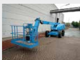
V18028 - Haulotte H16TPX - 2006