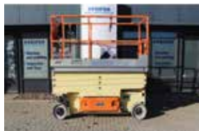
JLG - 3246ES Scissor lifts

Through our long established network of suppliers and by focusing on the purchasing of larger packages of equipment, we always have a diverse inventory of quality used stock on offer.