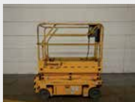
V23865 - Haulotte Optimum 8 - 2007