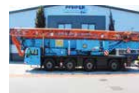
SPIERINGS - SK488-AT4 Tower Cranes

8t, 8x8x6, 40m Horizontal, 42m Lift Height 2003 | PHM-ID 08851