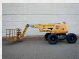
V21124 - Haulotte HA16PXNT - 2007