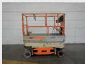
V23709 - JLG 1930ES - 2004