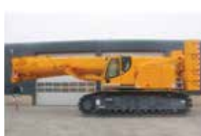
LIEBHERR - LTR1100 Telescopic Crawler Cranes

100t, 19m Dbl Jib, Dbl Winch, 52m Boom 2017 | PHM-ID 80079