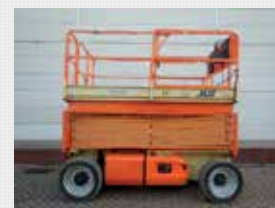
V22631 - JLG M4069LE - 2001