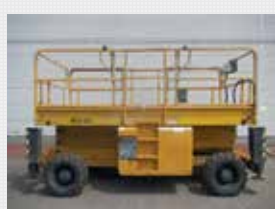
V21110 - Haulotte H12SX - 2007