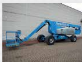
V23817 - Genie Z135-70RT - 2007