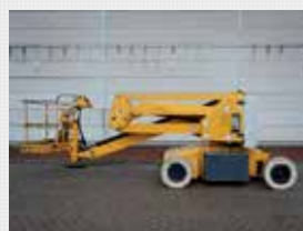
V24172 - Haulotte HA15I - 2004