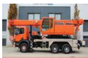
SENNEBOGEN - HPC40 Truck Cranes

40t, 6x6x2, 9m jib, Intarder 30m Boom 2002 | PHM-ID 09376