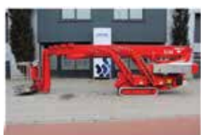
OMME - 3150RBDJ Track boom lifts

Bi Energy, Tracked, 31.0m Working Height, 2012 | PHM-Id 09118