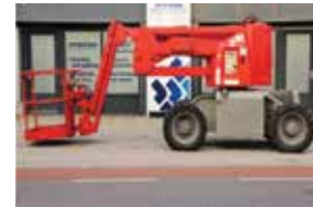
HAULOTTE - HAI2PX Articulating boom lifts

Diesel, 4x4 Drive, 12.0m Working Height, 2006 | PHM-Id 09296