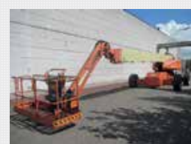
V19809 - JLG 1350SJP - 2008