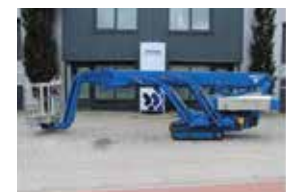
OMME - 3000RBD Track boom lifts

Bi Energy, Tracked, 29.0m Working Height, 2007 | PHM-Id 09115