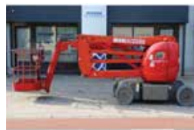
MANITOU - 150AETJC Articulating boom lifts

Electric, 4x2 Drive, 15.0m Working Height, 2007 | PHM-Id 09300