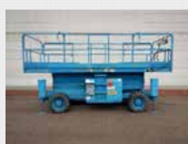
V24105 - Haulotte H15SXL - 2007