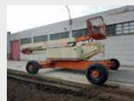
V22983 - JLG 150HAX - 1996