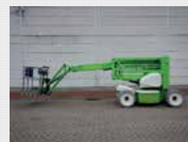
V22309 - Niftylift HR15NDE - 2008