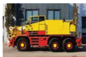
COMPACT TRUCK - CT3 Telescopic Cranes

70t, 6x6x6, 6m jib , Intarder 41m Boom 2000 | PHM-ID 09280