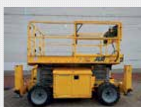
V22798 - JLG 260MRT - 2007