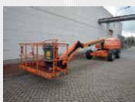
V22975 - JLG 460SJ - 2007