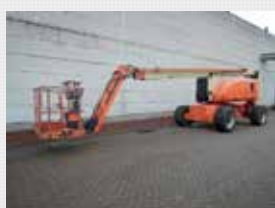
V22862 - JLG 800AJ - 2005