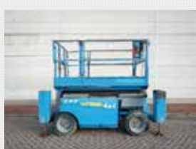
V24600 - Genie GS3268RT - 2007