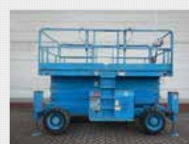
V24106 - Haulotte H18SX - 2007