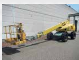
V21818 - Haulotte H21TX - 2007