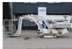
OMME - 2200RBD Track boom lifts

Bi-Energy, Tracked, 21.0m Working Height, 2006 | PHM-Id 09111