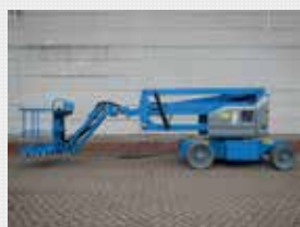
V24428 - Genie Z40-23NRJ - 2016