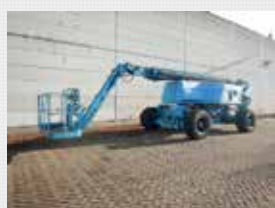
V22560 - Haulotte HA32PX - 2005