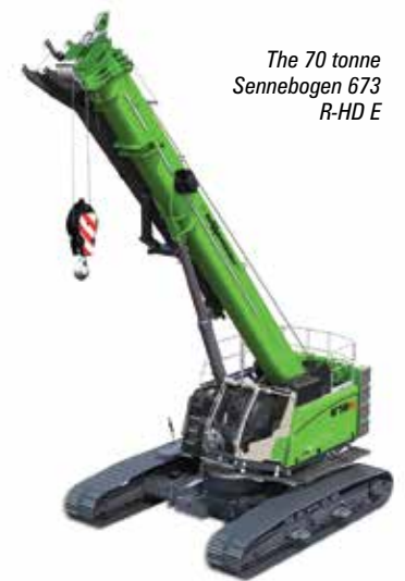
The 70 tonne Sennebogen 673 R-HD E

The 70 tonne 670 HD duty cycle crane fills the gap in the current range and has three engine options a Tier 3a and two Tier 4 diesels. Another development to look out for is the new 6113 E Mobile, a new pick & carry crane with a 120 tonne capacity. The telescopic crane has a six metre elevating cab and can carry 27 tonnes free on wheels. The first unit built is currently in use at the Sennebogen production facility.