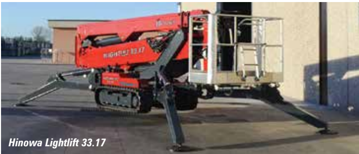
Hinowa Lightlift 33.17