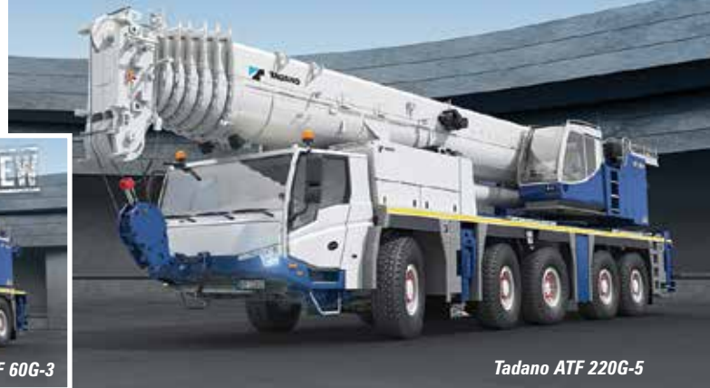
Tadano ATF 220G-5