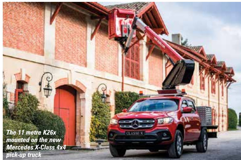
The 11 metre K26x mounted on the new Mercedes X-Class 4x4 pick-up truck

will have its new van and truck mounts on display, including the 11 metre K26x mounted on the new Mercedes X-Class 4x4 pick-up truck, with up to 5.2 metres of outreach and a new turret design