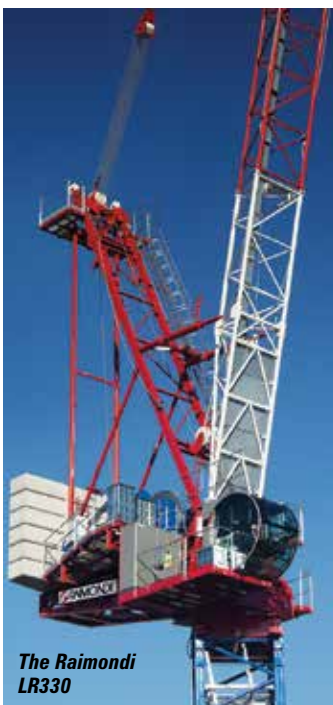
The Raimondi LR330

The Italian company is possibly the fastest growing tower crane manufacturer at the moment, in terms of sales growth, new dealer appointments and new product launches. At Intermat expect two new models including the all-new 18 tonne LR330 luffing jib crane announced last month which has a new triangular jib design and a maximum length of 60 metres at which it has a jib tip capacity of 3,300kg in Ultra-lift mode. It is also possible that the company will unveil its first all-new hydraulic luffing jib crane at the show!