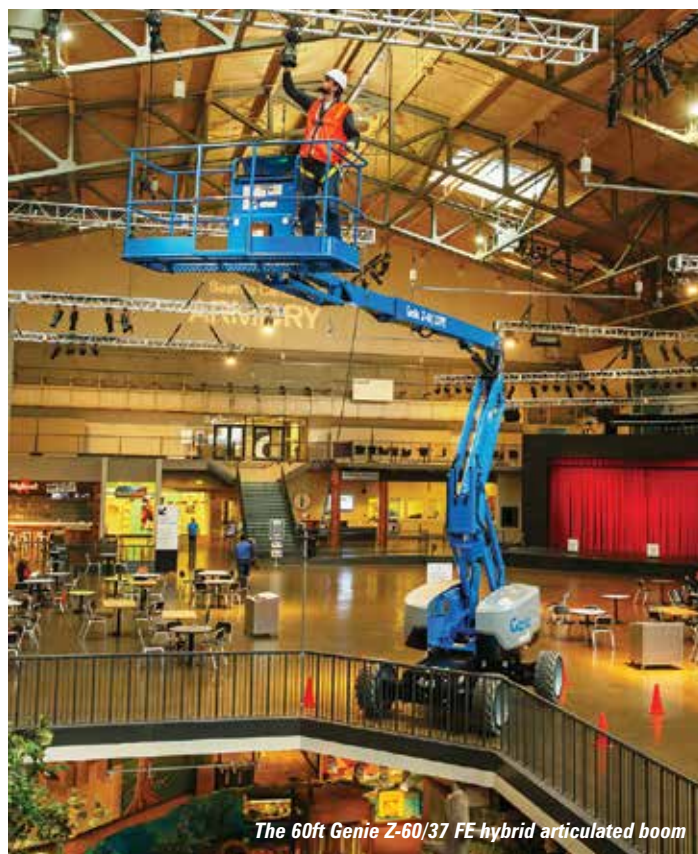
The 60ft Genie Z-60/37 FE hybrid articulated boom

that reduces rear overhang, providing more compact overall dimensions. Also look out for the new all-electric K20 van mounted platform on a cutaway Nissan e-NV200.