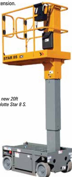
The new 20ft Haulotte Star 8 S.

The new 20ft Star 8 S self-propelled mast type lift - shown as the Star 20 S at Conexpo last year - starts shipping in June, while the new 13ft Star 6 Crawler is the company's first tracked mast lift with a six metre working height, direct AC electric drive and 400mm platform extension.