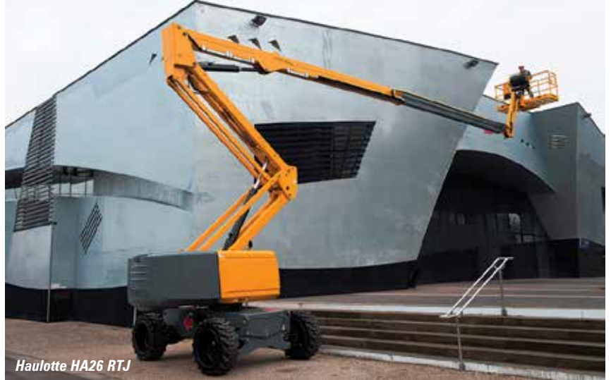
Haulotte HA26 RTJ