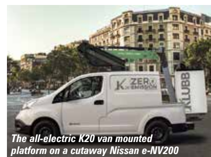
The all-electric K20 van mounted platform on a cutaway Nissan e-NV200

will have its new van and truck mounts on display, including the 11 metre K26x mounted on the new Mercedes X-Class 4x4 pick-up truck, with up to 5.2 metres of outreach and a new turret design