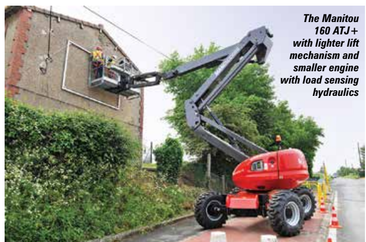
The Manitou 160 ATJ+ with lighter lift mechanism and smaller engine with load sensing hydraulics