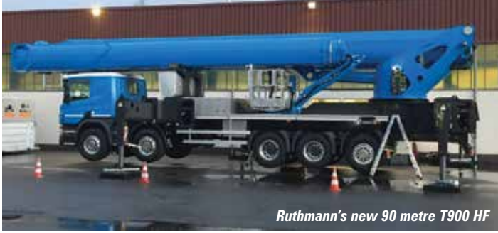
Ruthmann's new 90 metre T900 HF