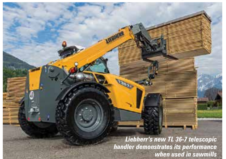
Liebherr's new TL 36-7 telescopic handler demonstrates its performance when used in sawmills