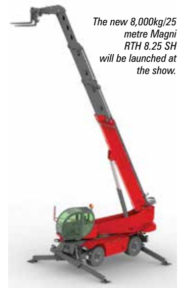
The new 8,000kg/25 metre Magni RTH 8.25 SH will be launched at the show.

Magni's main news is the 8,000kg/25 metre RTH 8.25 SH the highest capacity 360 degree telehandler in the world. Using the chassis from the 35/39 metre