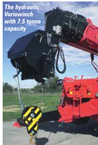
The hydraulic Variowinch with 7.5 tonne capacity

On home soil, Manitou will show several new models, including a Mark III version of its popular 46ft articulated boom lift the 160ATJ, which now has a lighter lift mechanism and smaller engine with load sensing hydraulics. Numerous other changes have been incorporated and are well worth a