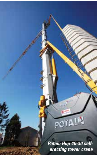
Potain Hup 40-30 self-erecting tower crane

Grove will exhibit its latest All Terrain crane the 90 tonne GMK4090 and possibly the upgraded six axle 300 tonne GMK6300L-1.