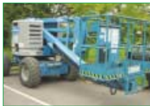
SELF PROPELLED TELESCOPIC PLATFORM 1998 GENIE Z45/22 15m. working height (50ft.). Deutz Diesel Choice of 20 machines.