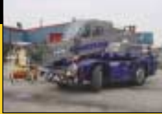
Kato CR100 Year 1998. Capacity 10 tonnes. City Crane

Used Cranes for Sale Direct from the UK's largest Crane Hirer Visit our Website: www.ainscough.co.uk