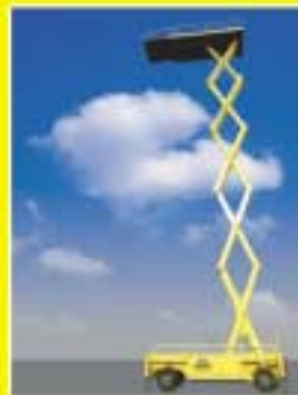
Scissor platforms Working height: 4 - 33 metres Platforms: sizes 0.74 x 1.30 m up to 2.80 x 6.64 m