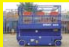
UPRIGHT X26N (1992) Self propelled scissor lift. 32' working height. Battery. Repainted, serviced & tested.