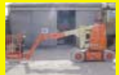
JLG E300AJP (2000) Self propelled boom. 32' working height. Battery. Serviced & tested.