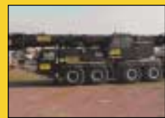
Liebherr LTM1070 Year 1996. Capacity 70 tonnes. All Terrain