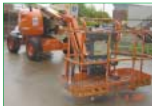
SELF PROPELLED TELESCOPIC PLATFORM 2000 JLG 450AJ 15m. working height (51ft.). Deutz Diesel. Choice of several machines.