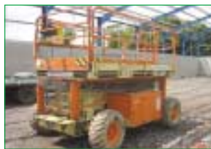
SELF PROPELLED SCISSOR PLATFORM 1999 JLG 33 RTS 12m. working height (39ft.). Deutz Diesel. Choice of several machines.