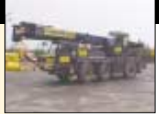
Liebherr LTM1040/1 Year 1995. Capacity 40 tonnes. All Terrain