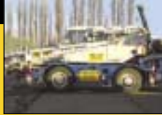
Kobelco RK200-3 Year 2000. Capacity 20 tonnes. City Crane