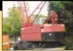
Jones 565 Year 1975. Capacity 30 tonnes. Mobile Lattice