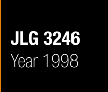
JLG 3246 Year 1998