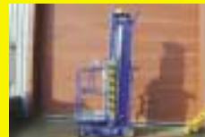
UPRIGHT UL40 (1998) Personel lift. 46' working height. Battery. Serviced & tested.