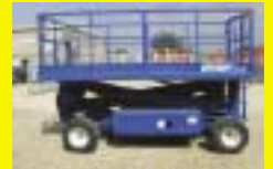
UPRIGHT SL26 (1990 & 1999) Choice of 2. Self propelled scissor lift. 32' working height. Diesel. 4wd Recently repainted, serviced & tested.