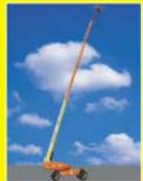
Telescopic and articulated telescopic platforms Working height: 1 - 43 metres Platform: sizes from 0.70 x 0.75 m to 1.00 x 1.50 m

NEW! Special ultra narrow machines up to 28 metres!