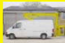
VOLKSWAGEN LT35 WITH K LIFT (2000) KV 10.5m. 36' working height. Serviced and tested.