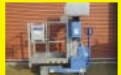
GENIE STOCKPICKER (1997) Personel lift. 20' working height. Battery. Serviced & tested.