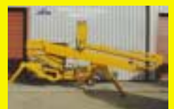
SPIDER TST29 (1999) Special high reach platform. 94' working height. Battery/mains electric. Repainted, serviced & tested.

Leewood Business Park, Upton, Huntingdon, PE28 5YQ Tel: +44 (0) 1480 891251 Fax: +44 (0) 1480 891162 e-mail: sales@accessplatforms.co.uk