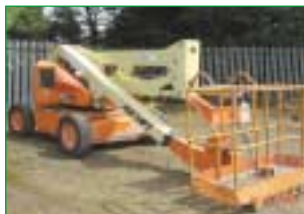
SELF PROPELLED TELESCOPIC PLATFORM 1998 JLG 45DC 15m. working height (50ft.) D.C. Battery Powered Choice of several machines.