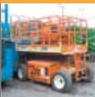
JLG 2658 Year 2000