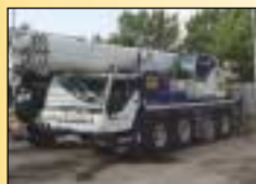
Liebherr LTM 1060 Year 2000. Capacity 70 tonnes. All Terrain