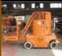
Grove Toucan 1010 Year 1998