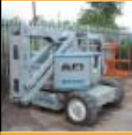
SKYJACK SJKB40 Year 1998