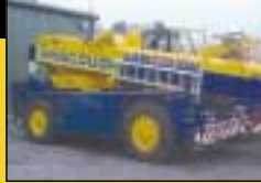
Demag AC75 Year 1997. Capacity 25 tonnes. City Crane