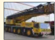
Liebherr, LTM1160 Year 1999. Capacity 160 tonnes. All Terrain