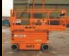
SKYJACK SJKB33N Year 1998