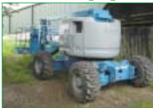
SELF PROPELLED TELESCOPIC PLATFORM 2002 GENIE Z45/22 4x4 15m. working height (46ft.). Oscillating axle. Deutz Diesel. Choice of 5 machines.