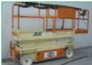
SELF PROPELLED SCISSOR PLATFORMS 1998 JLG 2033E. 8m. working height (26ft.). Battery/Electric. Choice of machines.