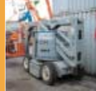
JLG 26MRT Years 1998/2000