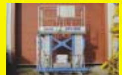
GENIE DPL35(1996/7/8 & 9) Choice of 4. Dual personnel lift. 41' working height. Battery. Serviced & tested.