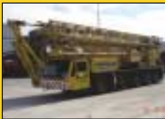
Spierings SK598 Year 2001. Capacity 8 tonnes. Mobile Tower