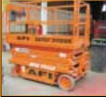
JLG 2646 Year 1998