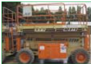
SELF PROPELLED SCISSOR PLATFORM 1998 JLG 40RTS. 14m. working height (46ft.). Deutz diesel. Choice of machines.