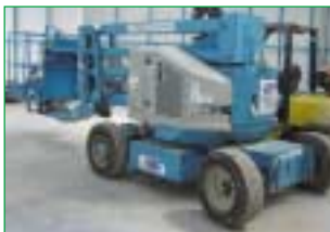
3SELF PROPELLED TELESCOPIC PLATFORM 1998 GENIE Z45/22. Bi-fuel 15m. working height (50ft.). Kubota Diesel & D.C. Battery Power. Choice of several machines.