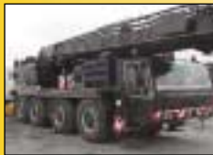
Tadano Faun, ATF70-4 Year 1996. Capacity 70 tonnes. All Terrain