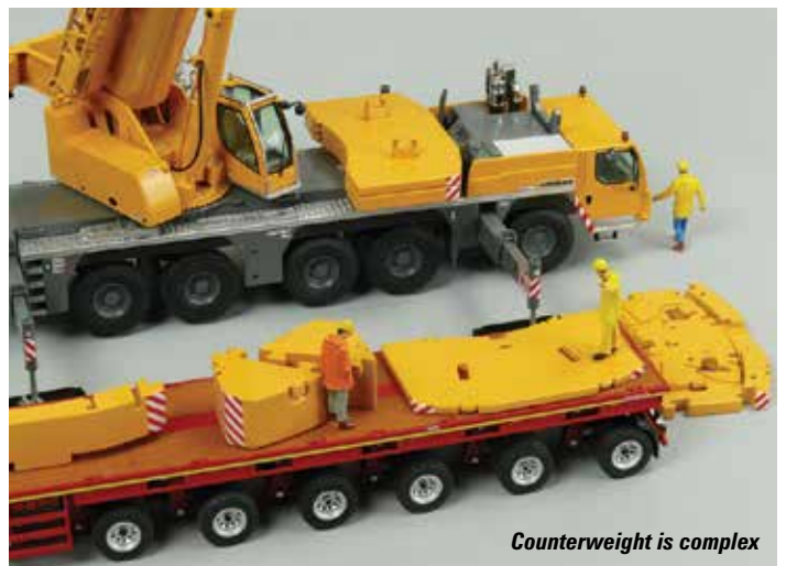
Counterweight is complex