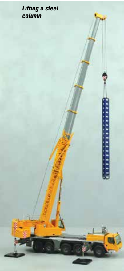
Lifting a steel column