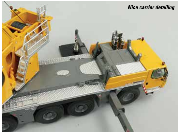
Nice carrier detailing