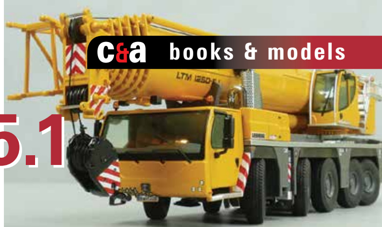
On the road