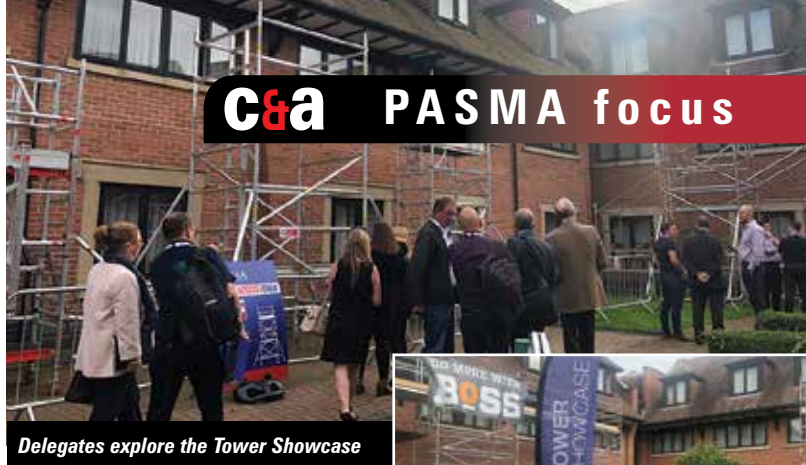
Delegates explore the Tower Showcase