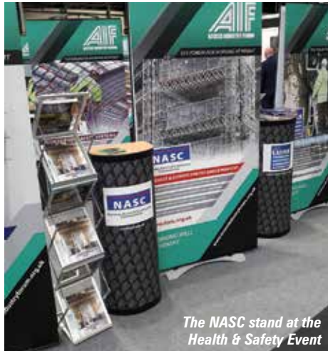
The NASC stand at the Health & Safety Event