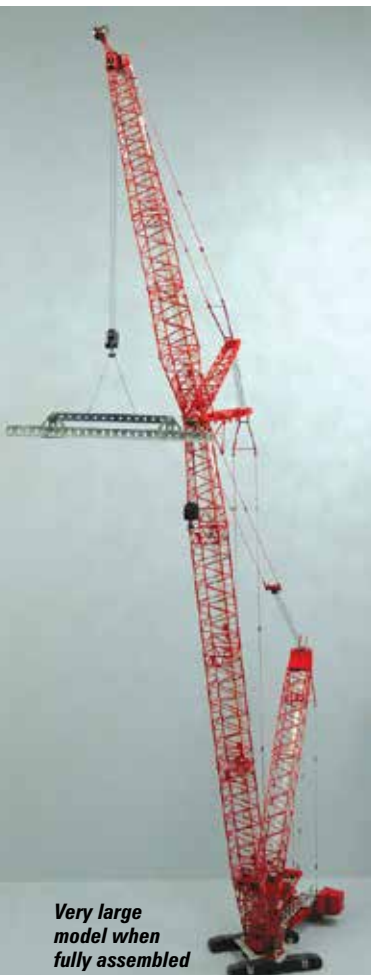
Very large model when fully assembled