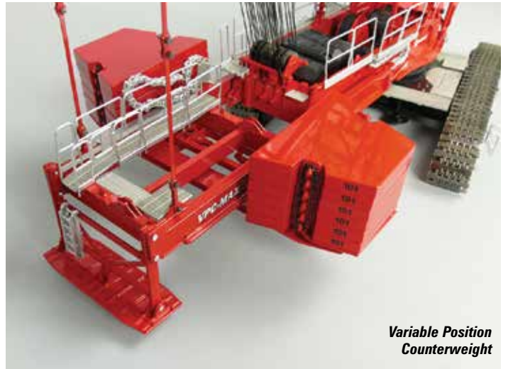
Variable Position Counterweight