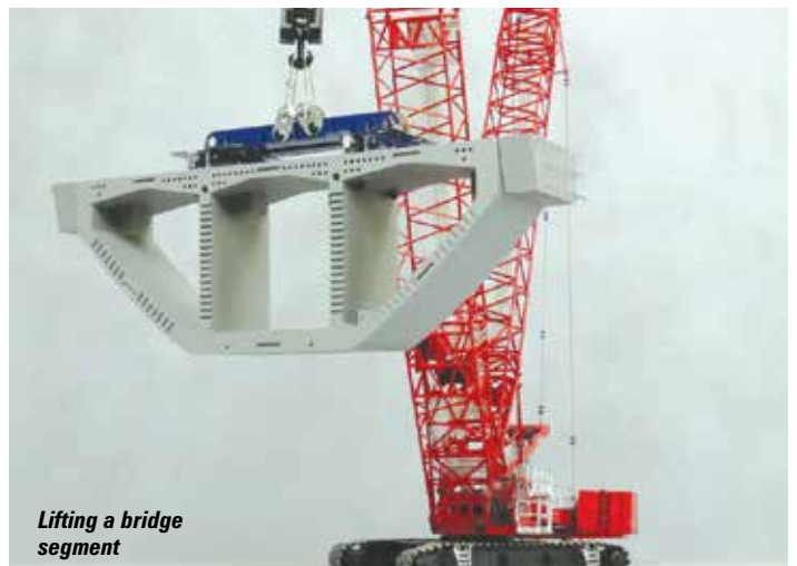
Lifting a bridge segment