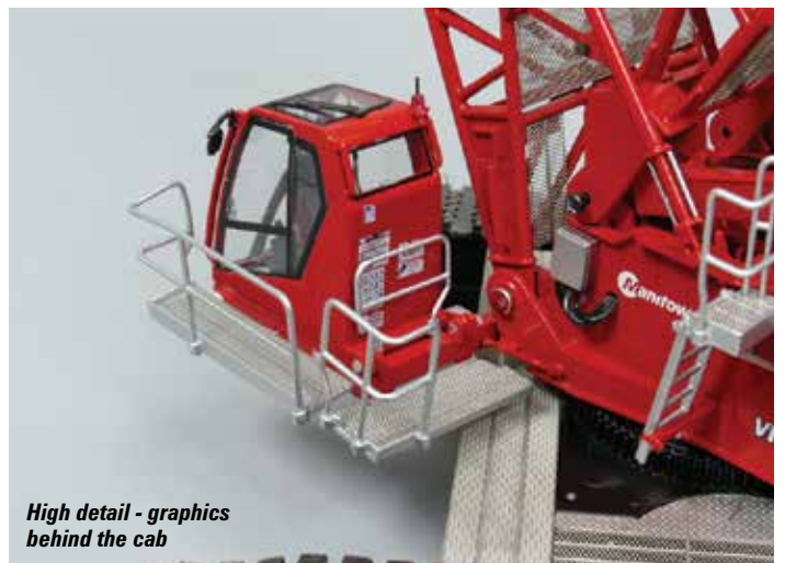
High detail - graphics behind the cab