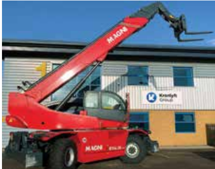
Magni RTH 6.30 SH

Magni has appointed Kranlyft UK as its telehandler dealer for southern England, it follows its appointment as Magni distributor for Sweden earlier this year. Kranlyft will provide sales, parts and service across the south of England from its base in Avonmouth. The company also distributes Maeda and Klaas cranes.