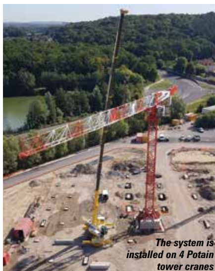
The system is installed on 4 Potain tower cranes

The system calculates the distances between the cranes and their loads in three dimensions and merges the data with the actual real time movement speeds to maintain safe distances between each crane. When complete by the end of 2020 the plant will cover 25,000 square metres and will make 'off the shelf' bags and small leather goods.