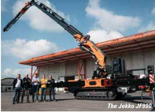
The Jekko JF990

It is also possible to equip the crane with either a gravity suspended platform or a fully integrated work platform attachment, effectively converting it to a spider lift with a working height of 38 metres and up to 34 metres of outreach. The diesel powered crane was also equipped with an AC electric power unit and was sold and delivered by local dealer Jekko Norge.