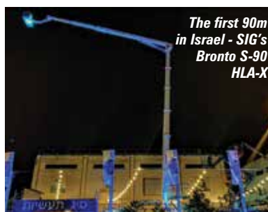
The first 90m in Israel - SIG's Bronto S-90 HLA-X

Bronto's Israeli distributor SIG has taken delivery of the first 90 metre Bronto Skylift S-90 HLA-X truck mounted lift to arrive in the country and the first 90 metre work platform to be based in Israel. The company celebrated the arrival of the new machine with an open day/launch evening.