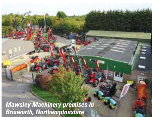
Mawsley Machinery premises in Brixworth, Northamptonshire