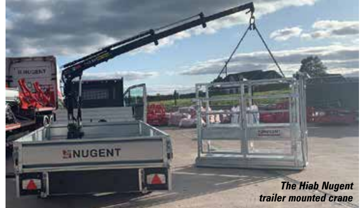
The Hiab Nugent trailer mounted crane

The SK487-AT3 City Boy has a maximum capacity of seven tonnes at a radius of 11.96 metres and can handle 1,700kg at its maximum radius of 40 metres. The crane offers four tower heights - 21, 24, 27 and 30 metres - and jib luffing angles of 15, 30 and 45 degrees for a maximum lift height of 55.45 metres. It can be operated as a full battery electric machine or used as a plug-in hybrid model with a low emission Euro 6 diesel. The new crane will be delivered mid next year.