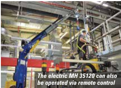
The electric MH 35120 can also be operated via remote control

German aerial lift manufacturer Hematec has launched the electric Helix MH 35120 mast boom fall arrest crane. The model was developed in response to a request by German engineering company Bosch, which will use it as a mobile fall arrest harness anchor point, rather than a lift crane.