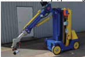
Helix MH 35120 fall arrest crane

The overall design is based on the company's 35500 crane with an overall width of 980mm, five section mast and three section telescopic jib, providing a maximum outreach from the edge of the machine of 3.5 metres, when the jib is horizontal, and a maximum height of almost 10 metres at a radius of 1.5 metres. It is certified and tested for individuals up to 120kg on a fall arrest lanyard. The machine can be operated via remote control.