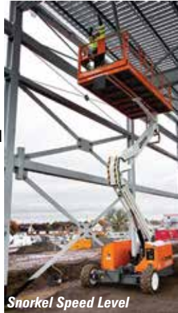
Snorkel Speed Level