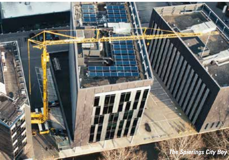
The Spierings City Boy