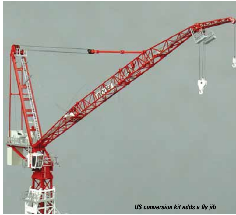
US conversion kit adds a fly jib