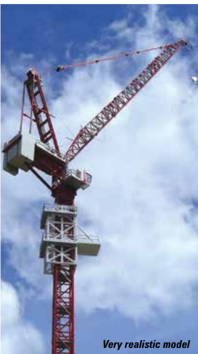
Very realistic model