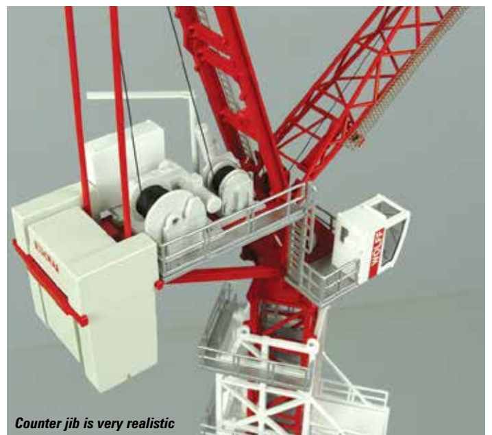
Counter jib is very realistic