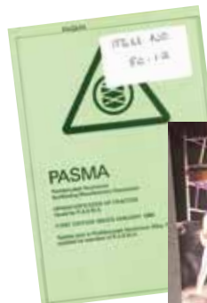
Items from the collection.