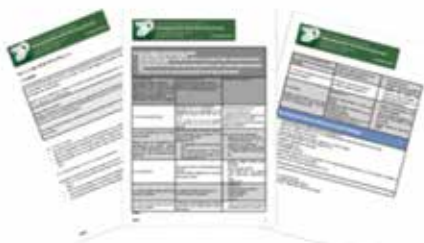
Safety Steps guides are available to download.