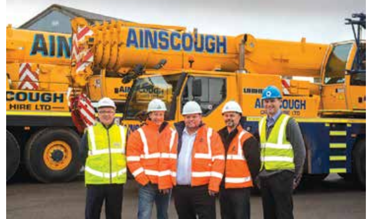
The opening was marked by open days for Ainscough customers in the region