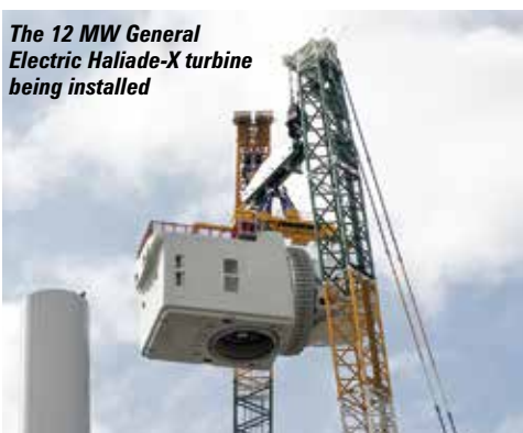
The 12 MW General Electric Haliade-X turbine being installed