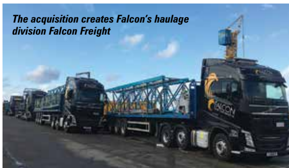
The acquisition creates Falcon's haulage division Falcon Freight

Falcon said: "With depots in Norfolk, Manchester, Scotland and now Dunstable we are perfectly placed to deliver a good, reliable service to both our crane business and existing TJ Robins customers."