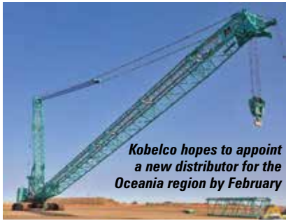
Kobelco hopes to appoint a new distributor for the Oceania region by February

Kobelco has reached a mutual agreement with its long time crane dealer for the Oceania region - Australian Crane and Machinery (ACM) - regarding the termination of their distribution partnership effective the end of December 2019. In a surprise