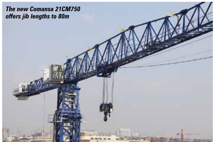
The new Comansa 21CM750 offers jib lengths to 80m