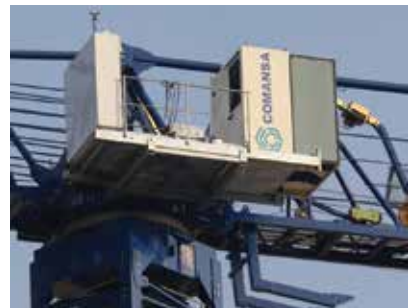
The Cube cab

Maximum jib length is 80 metres with a jib tip capacity of 7,300kg for the 35 tonner and 6,700kg for the 50 tonne version. The maximum free-standing height is 78.8 metres. Features include Comansa's Cube Cab, automatic changing of the double trolley and high speed hoists. The 37.5 tonne model can be converted to handle 50 tonnes by changing the front trolley and hooks.