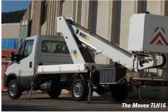
The Movex TLH16

Talleres Vellila says the increasingly tough rules for carrying out work within city centres is driving its development programme towards more hybrid and all electric machines in order to meet demand.