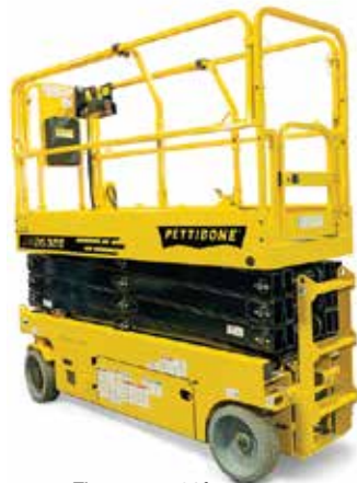
The narrow 26ft Pettibone S2632E

The 'E' signifies the direct electric drive while the other is the more traditional hydraulic wheel motor drive configuration. They include a common control box with LED screen and deck extensions as standard. The units will make their public debut at the ARA show next month.