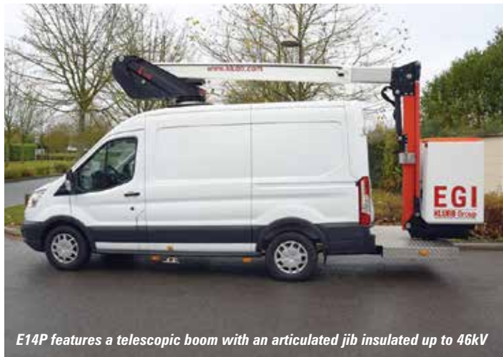
E14P features a telescopic boom with an articulated jib insulated up to 46kV

Klubb acquired French insulated platform manufacturer EGI in August last year and offers a range of insulated van and truck mounted lifts with working heights ranging from 10 to 65 metres.