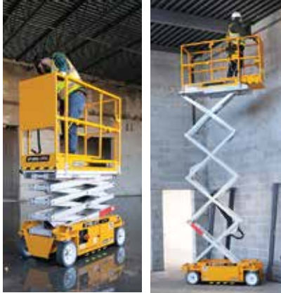
The Custom's new Hy-Brid PS-1930

The PS-1930 will be the first and largest model in its new 'Pro Series' range, featuring a significantly lower stowed platform compared to current products on the market. At less than 1.9 metres high and 762mm wide it will pass easily through a standard single doorway and into elevators without folding down the guardrails. The company also claims that it will have the lowest step-in height in the industry. Platform capacity is 300kg and the unit weighs just over 900kg including its 762mm long deck extension. The new machine will also be the first Hy-Brid model to be rated for both indoor and outdoor use, although the working height is restricted when working outdoors.