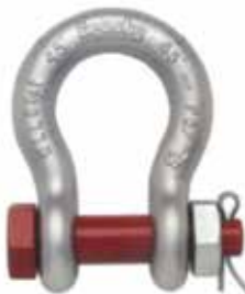
G-2130 / S-2130

Hook block, shackle and lifting tackle manufacturer Crosby has issued a safety alert for some of its 6.5 ton S-2130, G-2130, G-213, S-213, G-209, S-209 and G-2130C lifting shackles. The alert says that some shackles may have a reduced capacity from published values, while the shackle bow may be defective resulting in loss of load, severe injury, or death. The shackles concerned are the 7/8" 6.5t shackles with Product Identification Code 5VJ.