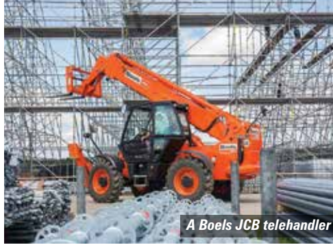
A Boels JCB telehandler

The units will be delivered to Boels locations in Belgium, the Netherlands, Germany, Poland, Slovakia, Austria and Italy. Boels has been a JCB customer for some time having placed orders for around 1,600 machines in recent years.