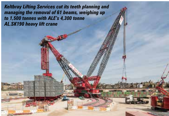
Keltbray Lifting Services cut its teeth planning and managing the removal of 61 beams, weighing up to 1,500 tonnes with ALE's 4,300 tonne AL SK190 heavy lift crane

The division has expanded since then to support other parts of the group. With a team of experienced lifting engineers now in place along with £1 million worth of specialist lifting gear, Keltbray Lifting Services is now offering its expertise to other contractors as consultants and contract lift providers.