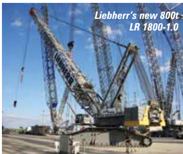
Liebherr's new 800t LR 1800-1.0

Liebherr says that the main features of the new LR 1800-1.0 crawler crane are its load chart and efficient transport as well as its luffing jib and derrick system. The crane has a standard main boom of 84 metres and an 84 metre luffing jib but can also be configured with a main boom of up to 102 metres, while the luffing jib can also be extended to 102 metres. Liebherr claims the new LR 1800-1.0 is the most powerful crawler crane on the market with a three metre wide transport width.