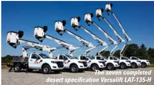
The seven completed desert specification Versalift LAT-135-H

Time Versalift has appointed Al Ain Distribution Company of the UAE as sole supplier of a new line of desert specification 4x4 pickup mounted Versalift platforms.