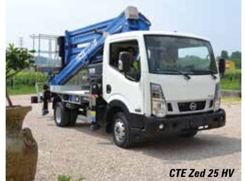
CTE Zed 25 HV