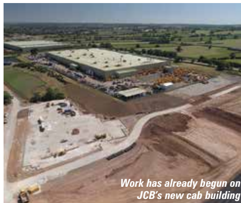
Work has already begun on JCB's new cab building

The new building, which should be completed sometime next year, represents an investment of around £50 million and will double the current in-house production of cabs to around 100,000 a year. The facility will include a computer controlled production line, fully automated paint facility and robotic welding. It is expected to employ around 200 additional staff by 2022.