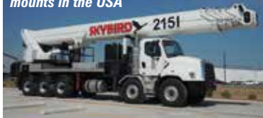
Time Versalift mounts and distributes large Ruthmann truck mounts in the USA