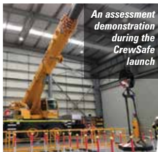
An assessment demonstration during the CrewSafe launch

The Crane Industry Council of Australia (CICA), has formally launched its operator training and certification initiative CrewSafe. The initiative is a collaborative effort with crane owners, equipment manufacturers and trainers both in Australia and overseas to increase onsite safety by introducing recorded machine specific assessments that confirm and document an operator's competency on a specific crane.