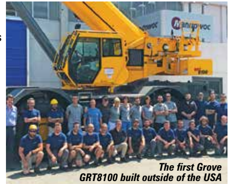
The first Grove GRT8100 built outside of the USA