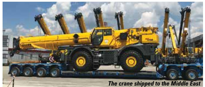
The crane shipped to the Middle East