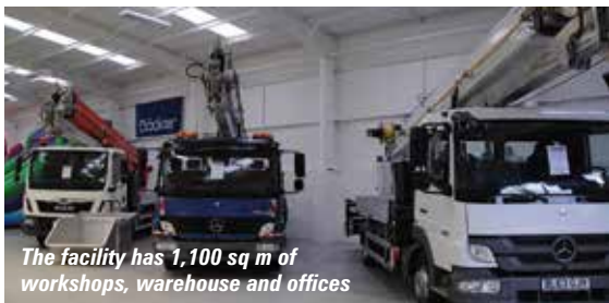
The facility has 1,100 sq m of workshops, warehouse and offices