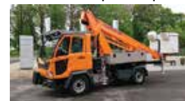
A Hubmeister platform

German aerial lift manufacturer and service company Blumenbecker Technik has sold its Hubmeister truck mounted lift manufacturing business to Zweiweg Verwaltung , part of the Zagro group. The deal includes the rights to the Hubmeister product range and Blumenbecker's production and assembly subsidiary in northern Italy. No details of the transaction have been disclosed. The Blumenbecker plant in Bad Lauchstädt, Germany which was involved with Hubmeister production has been closed following the sale. The company will continue to provide parts and service support for Hubmeister products and other aerial work platforms including Giraffe and MBB aerial work platforms for which it owns the brand rights.