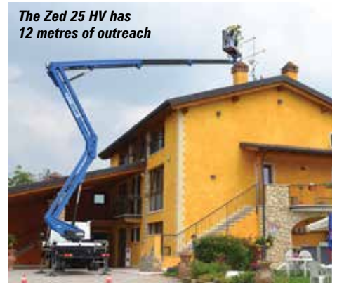
The Zed 25 HV has 12 metres of outreach

Slew is 320 degrees in either direction and platform rotation a full 180 degrees. Features include a variable outrigger set-up with automatic extension and pressure sensing with CTE's S3 Smart Stability System which automatically adapts the working envelope to suit the actual outrigger configuration selected.