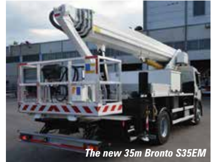
The new 35m Bronto S35EM

The new machine has a five section telescopic boom topped by an articulated jib. Maximum outreach is 29 metres and maximum platform capacity 500kg with the standard 2.04 metre platform, 450kg with a 2.4 metre basket and 350kg with the extendable 3.4 metre platform. The control system is the latest Bronto 5+ with touch screen, easy navigation and modifiable main menu. Outrigger set-up is completely variable and the unit has an overall length of 9.5 metres with an overall height of 3.7 metres.