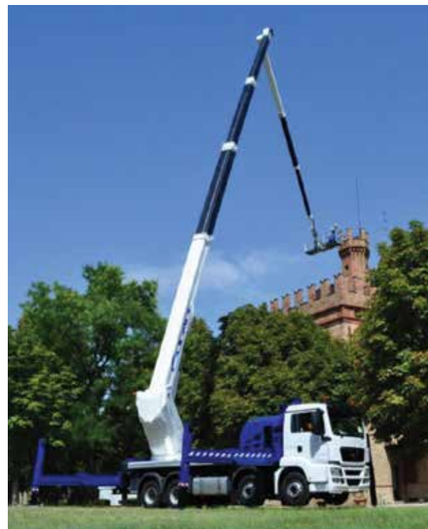
The Socage 54TJJ on a four axle European chassis.

As part of the partnership agreement Aichi will provide sales and product support for all Socage products in Japan. Aichi already manufactures its own truck mounted lifts with working heights of up to 29 metres, alongside its self-propelled boom and scissor lifts.