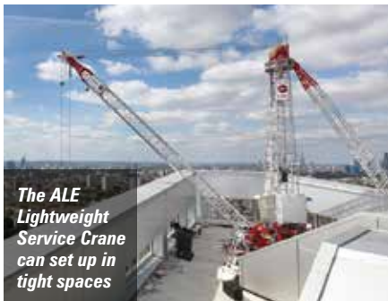
The ALE Lightweight Service Crane can set up in tight spaces

The crane was launched in 2016 and can be assembled by hand from components small enough to fit into a service elevator and be installed on a high rise city centre building roof where space is limited. Specialized Hoisting has locations in New Jersey and Georgia and provides specialised high rise lifting and rigging solutions for window washing and medical equipment.