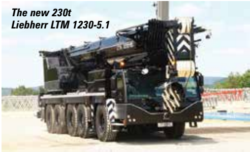
The new 230t Liebherr LTM 1230-5.1

tailswing from 4.8 to 5.7 metres, while various jib configurations are available for a maximum hook height of 111 metres. The crane uses Liebherr's single engine concept with a six cylinder chassis mounted engine driving a 12 speed ZF Traxon transmission. Features include Variobase, EcoMode and EcoDrive to maximise fuel efficiency while reducing noise and emissions and the 'Hill Holder' feature to assist with hill starts. The crane has an asymmetric outrigger base with a front spread of 7.4 metres and a rear spread of 8.1 metres to provide additional capacity over the rear quadrant.