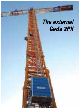
The external Geda 2PK