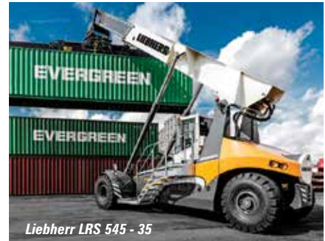
Liebherr LRS 545 - 35

The LRS 545 - 35 has a maximum lift capacity of 35 tonnes in the second container row, while the LRS 545 Log Handler can lift up to 30 tonnes - with a grapple capacity of 8.2 square metres - which it can take out to 8.5 metres with a stacking height of up to 8.9 metres, it is also capable of log handling from a point below ground level.