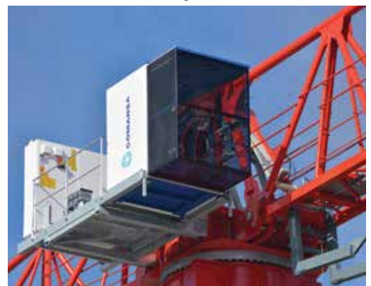
Going forward the Comansa brand will replace Linden Comansa.

Cranes manufactured in Pamplona previously marketed under the Linden Comansa brand and cranes manufactured in Hangzhou, China, distributed under the Comansa CM name, will all now be branded as Comansa. The LC and CM crane nomenclature system will not change.