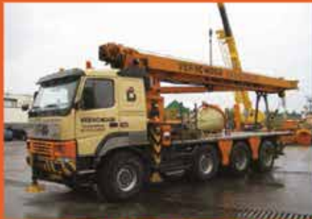
Manitex 30124 kr 58 2001-1