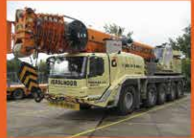
Grove GMK 5130-2 2016