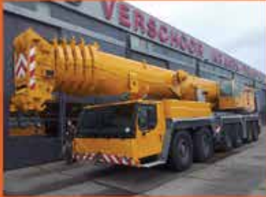
LIEBHERR LTM 1250-6.1 2011