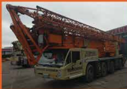
Spierings SK 597 AT-4 2008