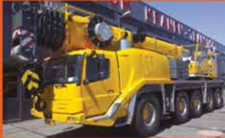
Grove GMK 5095 2009