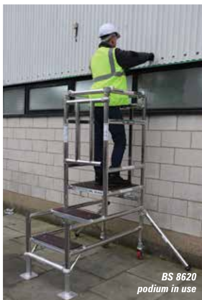
BS 8620 podium in use