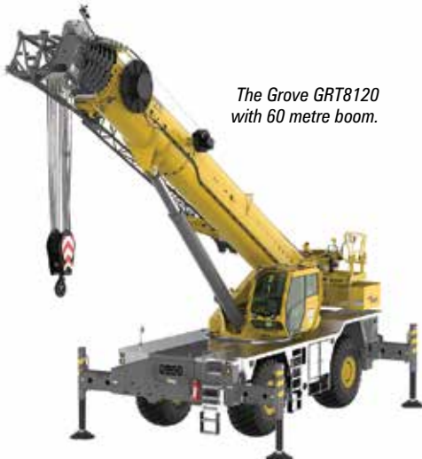
The Grove GRT8120 with 60 metre boom.

Based largely on the 100 ton GRT8100, the GRT8120 features the company's MAXbase variable outrigger set up and CCS Crane Control System systems, along with a new wider cab with 20 degrees of tilt. Product manager John Bair said: "Many of our customers wanted to fill a void in the 120 ton class, and increase their crane utilisation with easier transport, greater reach and capacity. We were able to accomplish this through an all new carrier design along with several other new features debuting on this crane. The boom length its strong load charts put this crane at the top of its class."