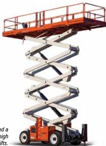
Snorkel has unveiled a range of heavy duty, high capacity scissor lifts.

For more information on these and other new Snorkel launches see the Conexpo show review starting on page 39.