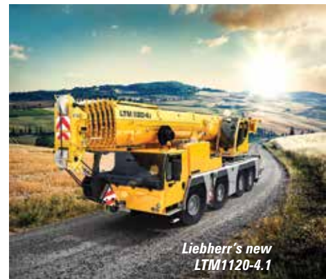
Liebherr's new LTM1120-4.1

It can handle a nine tonne load on the fully extended boom or 12.1 tonnes on a 60 metre boom - some 18 percent better than the manufacturer's 100 tonne LTM 1100-4.1. Maximum tip height is almost 95 metres. Axle loadings range from 12 tonnes with 2.5 tonnes of counterweight to the maximum of 16.5 tonnes with 20 tonnes of counterweight on board. Total with VarioBallast is 31 tonnes. Overall travel width is just over 2.5 metres, with an overall length of less than 14.9 metres. Maximum outrigger spread is just over seven metres. Deliveries will begin late in the third quarter.