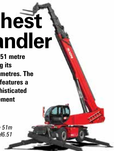
The 51m Magni RTH6.51

Magni has unveiled its record-breaking 51 metre RTH 6.51 360 degree telehandler beating its previous highest - the RTH 6.46 - by six metres. The two machines look similar but the 6.51 features a seven section telescopic boom and sophisticated working envelope and overload management system.