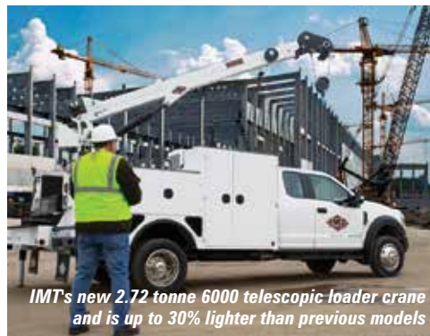
IMT's new 2.72 tonne 6000 telescopic loader crane and is up to 30% lighter than previous models

The compact crane can handle 2.49 tonnes at a height of 7.3 metres or 770kg at a radius of 6.4 metres. The company says the new crane is up to 30 percent lighter than previous models while the upgraded Dominator body offers payload capacities of up to 450kg.