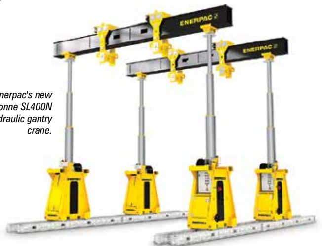
Enerpac's new 400 tonne SL400N hydraulic gantry crane.

Technology product line director, Pete Crisci, said: "The SL400N's design is based on the significant growth in industrial markets and the need for greater lifting capacities in tighter spaces where moving to a wider track to achieve a higher lifting capacity is not an ideal solution. The new crane provides improved lift capacities over existing narrow track gantry cranes and is an ideal replacement for traditional cranes that are too big or too expensive for the job."