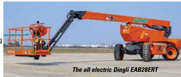
The all electric Dingli EAB28ERT

Dingli has unveiled a new 86ft articulated all electric EAB28ERT boom lift - the first in a seven model electric boom lift range which will include articulated models up to 92ft and telescopic up to 80ft. Maximum platform capacity is 454kg with an unrestricted platform capacity of 230kg. Outreach of 19.1 metres at an up and over height of just over nine metres. Based on the company's regular Italian designed diesel boom lifts the new model shares most of the componentry, maintaining the same four wheel drive, four wheel steer telehandler drive line with full differential locking. However, in place of a diesel engine is an 80 Volt/520Ah high capacity lithium battery pack feeding a large AC electric motor.