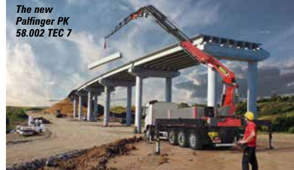
The new Palfinger PK 58.002 TEC 7

Maximum capacity on the PK 55 is 19 tonnes and 20 tonnes on the PK 58. Both cranes can take a one tonne load to a height of more than 20 metres and both offer a maximum tip height of up to 37 metres when equipped with the full polygon profile P-jib and extensions. Maximum radius is 33.7 metres. Mechanical extensions can be fitted to both the jib and the boom and integrated into the overload protection system.