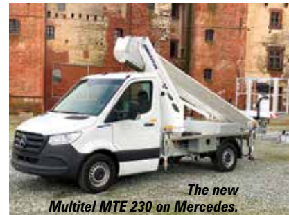
The new Multitel MTE 230 on Mercedes.