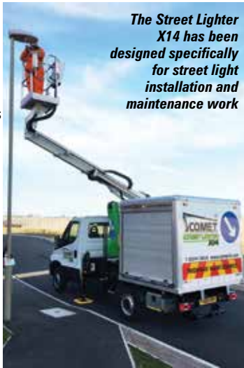
The Street Lighter X14 has been designed specifically for street light installation and maintenance work

Mounted on a 3.5 tonne Iveco chassis and featuring a sideways stowed X-platform it leaves the rest of the chassis free for a large storage compartment with a 400kg payload. Maximum outreach is 6.2 metres while the platform capacity is 150kg. Additional features include outriggers that can be set within the overall width of the vehicle, full hydraulic controls, front railed working/storage area and the ability to tow a trailer of up to 3,500kg.