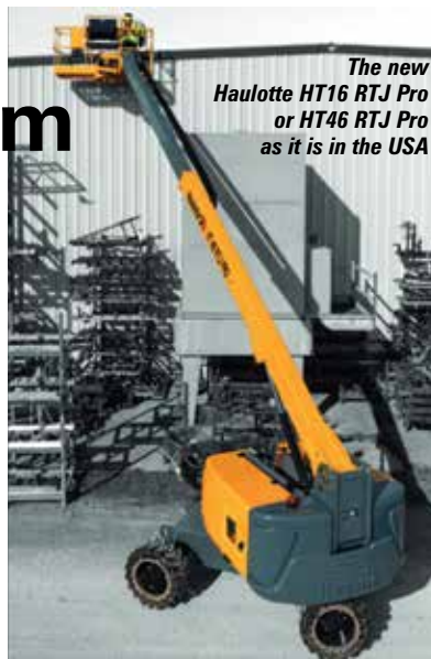
The new Haulotte HT16 RTJ Pro or HT46 RTJ Pro as it is in the USA

The lift is 2.29 metres wide and 2.27 metres high, although this increases to just over three metres when the platform is tucked under to reduce the transport length to 6.68 metres. Overall weight is 7,930kg. Standard features include an oscillating axle, 360 degree continuous slew, Haulotte's Activ' Shield bar, anti-entrapment system, Activ' Lighting System, Activ' Screen on-board diagnostics, limited slip differential with operator controlled lock, a Universal telematic plug, solid Rough Terrain tyres and rotating beacon.