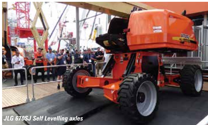
JLG 670SJ Self Levelling axles

the out of level condition and prevents the boom from being elevated above horizontal. On the 670SJ however, the boom comes to a stop just above horizontal while the machine automatically levels up on inclines of up to 10 degrees. Once the superstructure is level the boom can be elevated as if on level ground. In this configuration the machine will also operate in dynamic auto-levelling mode, allowing the operator to drive the machine at height with the chassis constantly adjusting to the changing ground conditions, maintaining a level platform. Finally, once the machine is loaded on a trailer the operator can press the travel mode button which lowers the chassis to a point where the base is just over 12mm above the deck for a lower load height and centre of gravity.