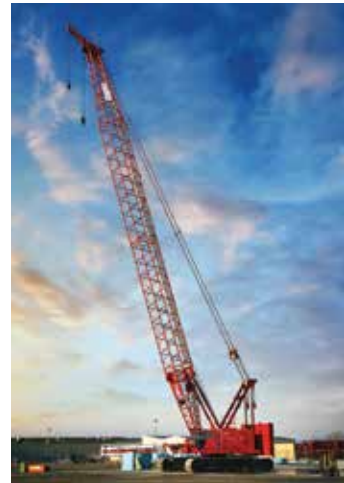
The Manitowoc MLC150-1

Alternatively a 52 metre luffing jib can be specified with a capacity of 46 tonnes. The new model is said to be faster and easier to rig, the boom butt section has a sheave for self-assembly and a button style rope termination, while the gantry is used to lift and install the counterweight. The boom base tip and sections have all been designed to stow together in a manner that reduces space for transport.