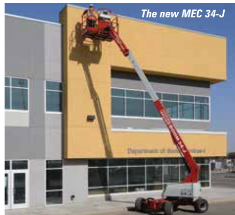
The new MEC 34-J

Maximum outreach is eight metres. Weighing 3,630kg, the 34-J is 2.33 metres wide, just over six metres long and 2.4 metres high. Four wheel drive and an oscillating axle are standard, while power comes from a Kubota Tier 4 Final diesel. The full size platform is 1.83 metres wide and a metre deep with three entrance gates and three fully proportional joystick controllers.