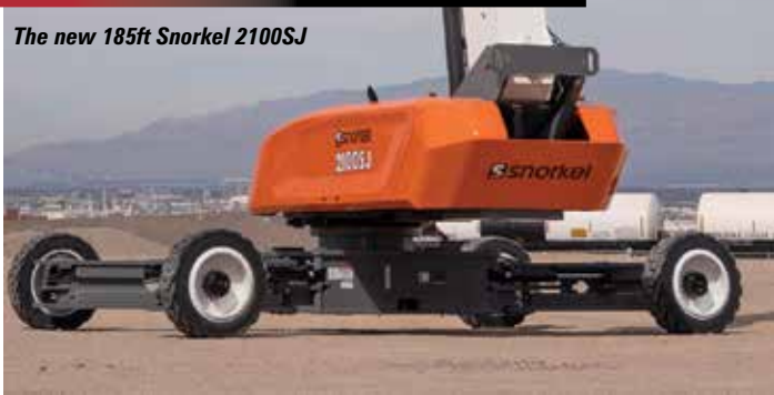
The new 185ft Snorkel 2100SJ