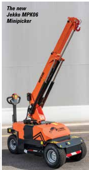
The new Jekko MPK06 Minipicker