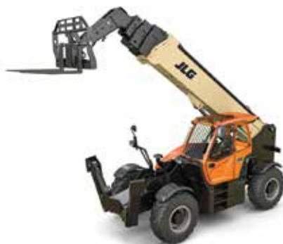
The JLG 23m/4.5t 1075

JLG also unveiled a 23 metre, 4,500kg North American fixed frame telehandler - the 1075 - with 18.3 metres of forward reach. JLG's Longitudinal Stability Indication (LSI) is standard, along with a two-way right side view camera system. Options include a wide range of attachments and remote controls allowing the operator to operate the machine from above.