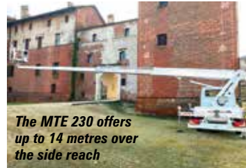
The MTE 230 offers up to 14 metres over the side reach

Outriggers can be set within the width of the vehicle or extended on one or both sides with live monitoring by Multitel's MUSA (Multitel-Self-Adapting outreach) system which adapts the work envelope to match the actual outrigger footprint set. The platform capacity with retracted outriggers is 100kg with up to 16 metres of outreach over the rear or nine metres over the side. With extended outriggers the outreach to the side is almost 14 metres.