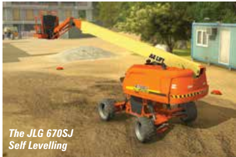
The JLG 670SJ Self Levelling

The machine essentially has three modes. With the boom retracted and horizontal it can travel like a regular boom with oscillating axle. In the case that it stops on uneven or sloping ground, the tilt sensor records