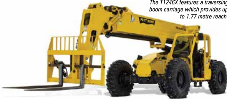
The T1246X features a traversing boom carriage which provides up to 1.77 metre reach.

Powered by a Tier IV diesel, the T1246X has an overall width of 2.6 metres, is seven metres long to the fork frame, has a ground clearance of 480mm and has a turning radius of 4.3 metres.