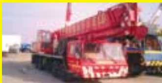
Kato NK 400E-3 1990