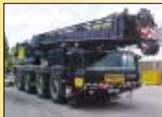
Tadano Faun, ATF70-4 Year 1996. Capacity 70 tonnes. All Terrain