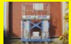
GENIE DPL35(1996/7/8 & 9) Choice of 4. Dual personel lift. 41' working height. Battery. Serviced & tested.