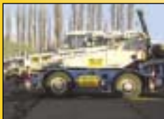
Kobelco RK200-3 Year 2000. Capacity 20 tonnes. City Crane