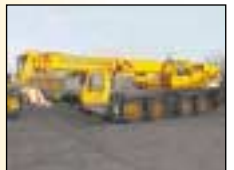
Grove, GMK4070 Year 1996. Capacity 70 tonnes. All Terrain