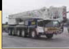
Liebherr, LTM1160 Year 1998. Capacity 160 tonnes. All Terrain