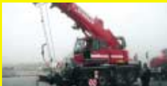
Demag AC 60-1 city crane 2003