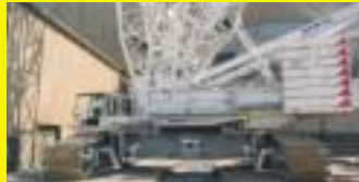
Demag CC2800 650 ton 4 pieces