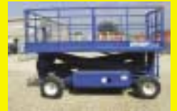
UPRIGHT SL26 (1990 & 1999) Choice of 2. Self propelled scissor lift. 32' working height. Diesel. 4wd Recently repainted, serviced & tested.