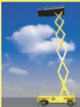
Scissor platforms Working height: 4 - 33 metres Platforms: sizes 0.74 x 1.30 m up to 2.80 x 6.64 m