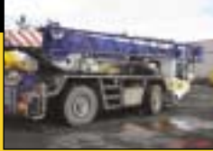
Demag AC95 Year 1996. Capacity 40 tonnes. All Terrain