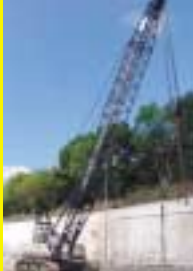
Demag CC200 50 ton brand new