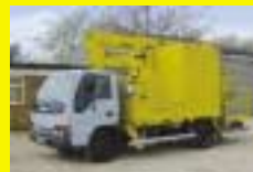
ISUZU CHASSIS CAB WITH K LIFT KT13.5 X reg. 45' working height. 37,259 km. Serviced and tested.