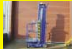
UPRIGHT UL40 (1998) Personel lift. 46' working height. Battery. Serviced & tested.