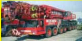
Demag AC 1200 1993 400 ton