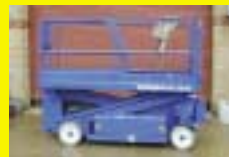
UPRIGHT SL20 (1994) Self propelled scissor lift. 26' working height. Battery. Serviced & tested.