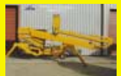
SPIDER TST29 (1999) Special high reach platform. 94' working height. Battery/mains electric. Repainted, serviced & tested.

Leewood Business Park, Upton, Huntingdon, PE28 5YQ Tel: +44 (0) 1480 891251 Fax: +44 (0) 1480 891162 e-mail: sales@accessplatforms.co.uk