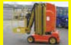
TOUCAN 1100A (1998) Self propelled boom. 32' working height. Serviced & tested.