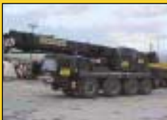
Liebherr LTM1070-1 Year 1994. Capacity 70 tonnes. All Terrain