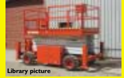
SNORKEL SL4084 (1998) Self propelled scissor lift. 4wd. 46' working height. Diesel. Repainted, serviced & tested.