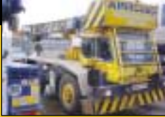
Grove AP415 Year 1996. Capacity 15 tonnes. Industrial Crane

Used Cranes for Sale Direct from the UK's largest Crane Hirer Visit our Website: www.ainscough.co.uk