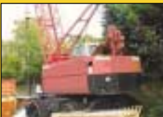
Jones 565 Year 1975. Capacity 30 tonnes. Mobile Lattice