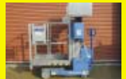
GENIE STOCKPICKER (1997) Personel lift. 20' working height. Battery. Serviced & tested.