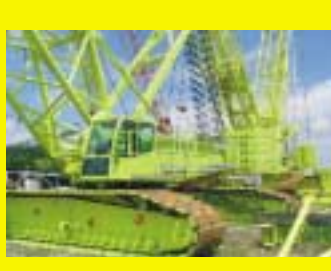
Demag CC2500SL 400 ton 2001