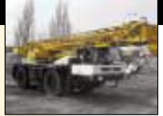
PPM 340ATT Year 1997. Capacity 30 tonnes. All Terrain