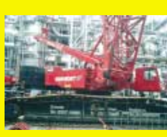
Demag CC1800 300 ton 1999