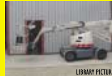
TEREX TA34 (2000) Self propelled boom. 40' working height. Battery. Repainted, serviced & tested.