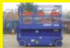
UPRIGHT X26N (1992) Self propelled scissor lift. 32' working height. Battery. Repainted, serviced & tested.