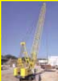
Kobelco CKE 2500 brand new 250 T