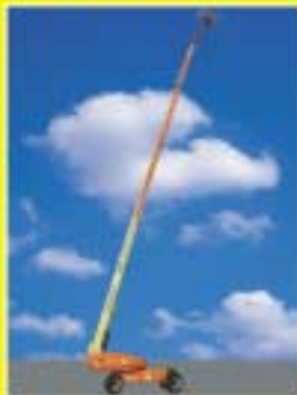
Telescopic and articulated telescopic platforms Working height: 1 - 43 metres Platform: sizes from 0.70 x 0.75 m to 1.00 x 1.50 m