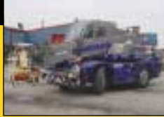
Kato CR100 Year 1998. Capacity 10 tonnes. City Crane