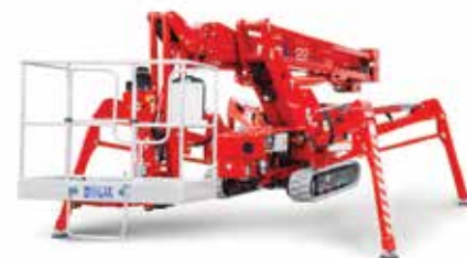
CMC's latest spiders includes the 21.6 metre S22HD.