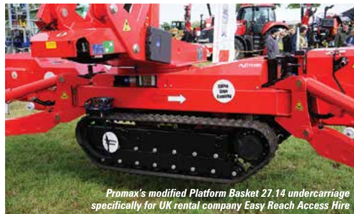
Promax's modified Platform Basket 27.14 undercarriage specifically for UK rental company Easy Reach Access Hire

as the 27.14 and the 33.17. It is also set to launch a new 43 metre model in the next few months.