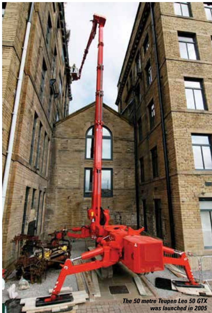
The 50 metre Teupen Leo 50 GTX was launched in 2005

The current range of the largest machines - 50/52 metres - have been around for more than a decade with three manufacturers participating in the market: Falcon - the 'descendant' of Falck Schmidt the inventor of the spider lift - Teupen and Palazzani. While the other manufacturers have all added larger machines to their product ranges, there appears to be little appetite to take the title of