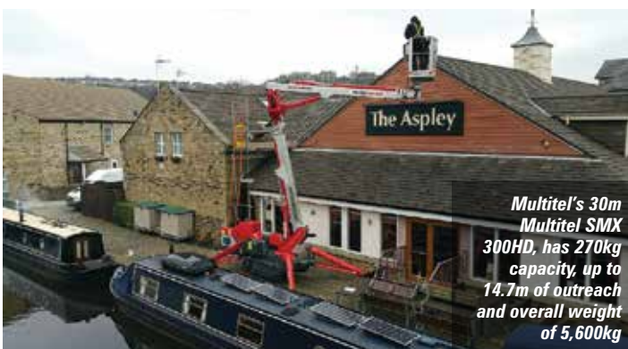
Multitel's 30m Multitel SMX 300HD, has 270kg capacity, up to 14.7m of outreach and overall weight of 5,600kg

About 70 percent of its production is currently made up of the 25 and 32 metre machines with only a few of its largest machine - the 41 metre S41 sold. The company says its next machine will be a 38 metre spider.