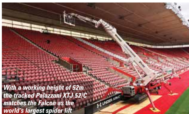
With a working height of 52m the tracked Palazzani XTJ 52/C matches the Falcon as the world's largest spider lift