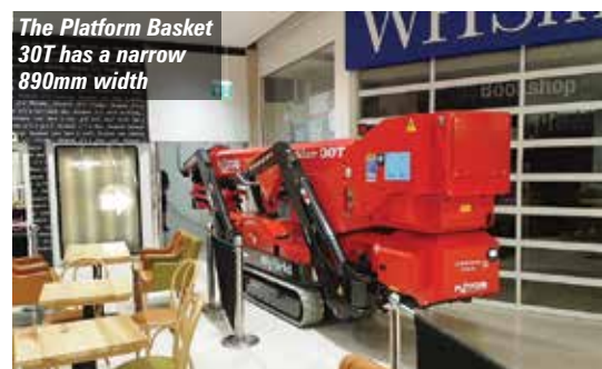
The Platform Basket 30T has a narrow 890mm width