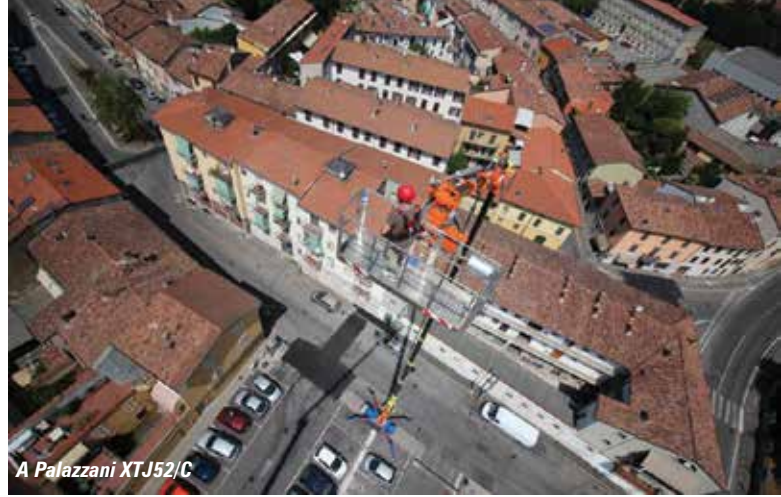
A Palazzani XTJ52/C

different design philosophy and has been particularly successful for high atrium applications, with models designed for narrow indoor applications as well as for rough terrain. Over the years most FS520C have been delivered directly to specific projects, usually on completion. Occasionally they are delivered early to help with fit out work as well, before staying in situ for maintaining and cleaning the windows and domes in shopping malls, airports, museums, hotels and prestige residential developments where its working height, low ground bearing pressure and double jib versatility are particularly useful as are its 1.25 metre stowed overall width and