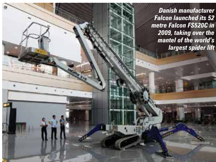
Danish manufacturer Falcon launched its 52 metre Falcon FS520C in 2009, taking over the mantle of the world's largest spider lift

While the race to build the biggest spider lift has been laid back, there has been a strong trend in recent years to build larger mainstream products, particularly among the many Italian manufacturers that dominate the industry. Most of these early manufacturers - including Oil&Steel, Hinowa, Heila/Italmec, Lionlift, RAM, Socage and Basket, now Platform Basket - began with 10 to 13 metre models followed by 15 to 16 metre versions, usually on the same chassis, but with dual sigma type riser, to gain the additional height. As a result, many buyers traded up to the larger models, given that the cost differential was outweighed by the perceived additional