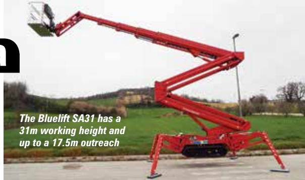
The Bluelift SA31 has a 31m working height and up to a 17.5m outreach

In the past year or two Platform Basket has been particularly active in the larger spider lift market, launching several models including its latest, the 30T telescopic as well