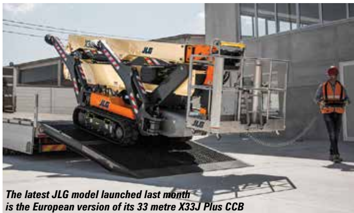
The latest JLG model launched last month is the European version of its 33 metre X33J Plus CCB

JLG is entering the ninth year of its partnership with Hinowa which provides it with modified and badged versions of Hinowa's lifts. The latest JLG model launched last month is the European version of its 33 metre X33J Plus CCB spider lift, following the launch of the US X100AJ version in prototype format at the Rental Show earlier this year. Hinowa publicly launched its own version - the 32.6 metre Lightlift 33.17 Performance IIS slightly later. Both versions have an outreach of 16.5 metres at an up and over