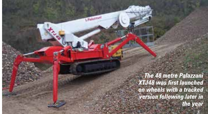
The 48 metre Palazzani XTJ48 was first launched on wheels with a tracked version following later in the year

double doors, cross delicate flooring and even climb stairs, making it indispensable for a certain type of work such as atrium cleaning and maintenance. However, in these applications the user often buys the machine so that they have it to hand. With only a few of them in rental fleets, the sector lacks the sales and marketing that might go with other products such as self propelled boom lifts over 50 metres. The first 50 metre spider lift - the Teupen Leo 50GT made its debut in 2004 with the first units delivered in Germany and the Benelux region. The Leo 50GTX arrived in late 2005. The first unit in the UK was ordered in 2006 and delivered the following year, not to a rental company but to Gladedale Capital for large office, retail and residential development. In those days there was also a good deal of interest from the electrical transmission market for work on pylons. However, it appears that truck mounted lifts have taken this market, with all wheel drive chassis and the greater use of easy to lay trackway.