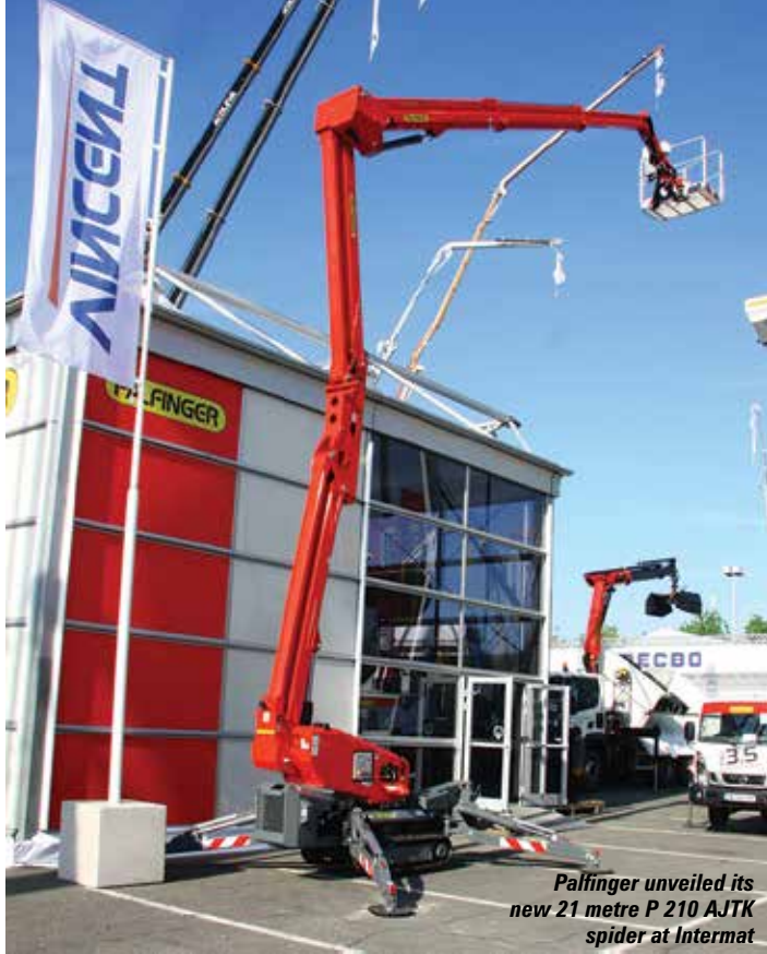
Palfinger unveiled its new 21 metre P 210 AJTK spider at Intermat

square metre mall in Moscow. The FS290 features a five section telescopic boom and dual arm articulated jib, providing 14 metres of outreach with an unrestricted platform capacity of 100kg, or around 13 metres with 200kg.