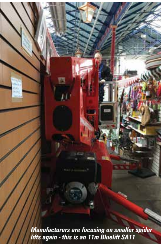
Manufacturers are focusing on smaller spider lifts again - this is an 11m Bluelift SA11