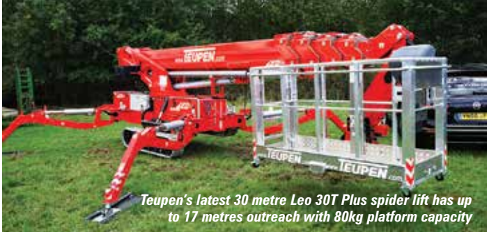
Teupen's latest 30 metre Leo 30T Plus spider lift has up to 17 metres outreach with 80kg platform capacity

Designed and fabricated inhouse the tracked undercarriage features an additional row of idlers giving increased clearance which is particularly appreciated for tree care work.