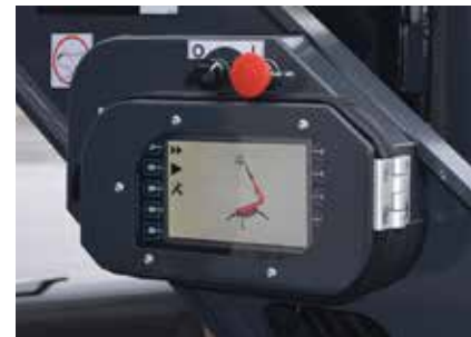
The LL33.17 is also equipped with Hinowa's RAHM control and remote diagnostics system with a full telematics suite.

Hinowa has also added a wider 1.6 metre platform rather than the 1.4 metres on its smaller models with standard 180 degrees platform rotation. The machine has an overall height of just under two metres, an overall length of six metres - with the basket removed, and a stowed overall width of 1.2 metres, although the extendable tracks increase this to 1.7 metres for improved stability when travelling on uneven ground.