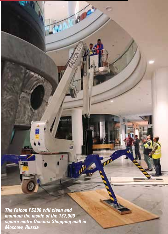
The Falcon FS290 will clean and maintain the inside of the 137,000 square metre Oceania Shopping mall in Moscow, Russia