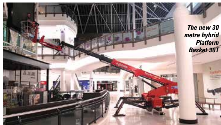
The new 30 metre hybrid Platform Basket 30T

UK distributor Promax Access which sold the first 30T in the UK to MBS has also developed a new undercarriage for the 27 metre Platform Basket 27.14 for Scottish rental company Easy Reach Access.