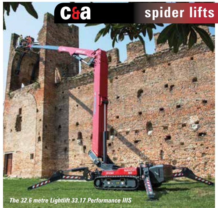
The 32.6 metre Lightlift 33.17 Performance IIS