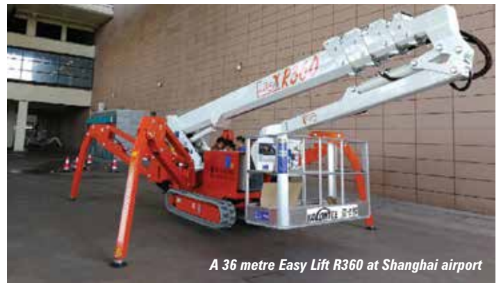
A 36 metre Easy Lift R360 at Shanghai airport

height of 17 metres, with an unrestricted platform capacity of 230kg. The lift mechanism features a four section telescopic lower boom which elevates to almost 90 degrees, plus a three section telescopic top boom topped by an articulating jib.