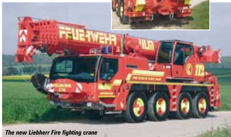
The new Liebherr Fire fighting crane