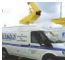
Latest van mounts for Aquarius

The new order comprises five of the new TDA135 telescopic 13.5 metre platforms on 3.5 tonne compact Ford Transit vans and five more heavy duty DA12.5 units on Iveco Daily 50C13 vans, this brings the Aquarius fleet of Priestman/Gardner Denver units on the Iveco Daily 50C13 van to 65 units.