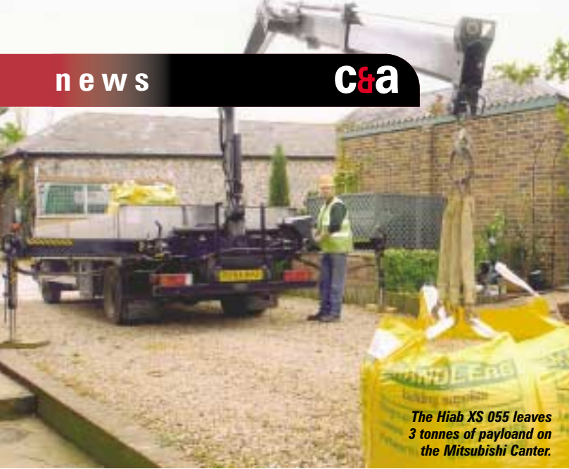
The Hiab XS 055 leaves 3 tonnes of payload on the Mitsubishi Canter.