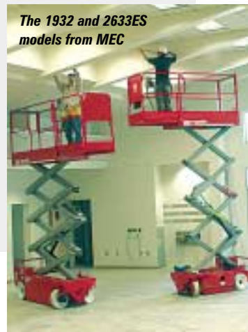
The 1932 and 2633ES models from MEC

Platform Sales Europe, trading as MEC Europe has been given the European master distribution rights and are looking to appoint local dealers. Arjan Roesle of MEC Europe told C&A that it already has good candidates for most, countries but is keen to find more prospects in Switzerland and Austria.