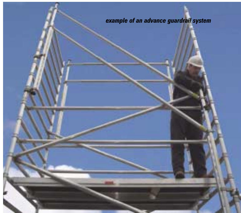
example of an advance guardrail system