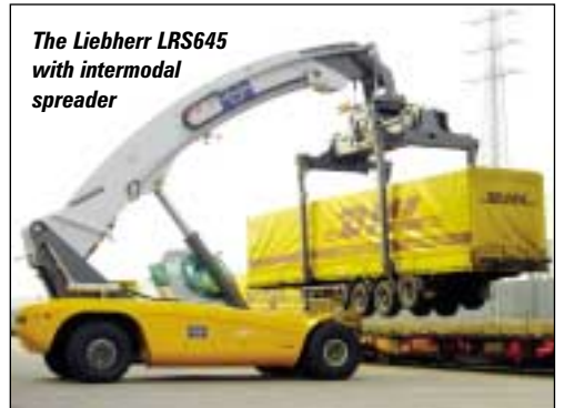
The Liebherr LRS645 with intermodal spreader

A number of options are now available, including a high capacity version for stacking fully loaded containers two and three deep, a movable cab to help improve visibility and an intermodal spreader.