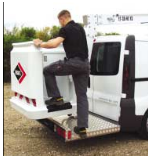
Versalifts walk-in insulated cage

A TEC Security is a specialist security systems integrator with specific expertise in the design, installation and maintenance of town centre CCTV systems. The new van mount has been acquired for use on a major security project and maintenance contract in the City of Westminster, London.