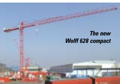
The new Wolff 628 compact

Complementing the new base is the UV 29, heavy duty tower section, at 4.5 metres it is compatible with other Wolff tower elements and combined with the new tower base. The new sections are designed to accommodate the standard Wolff bolt connection.