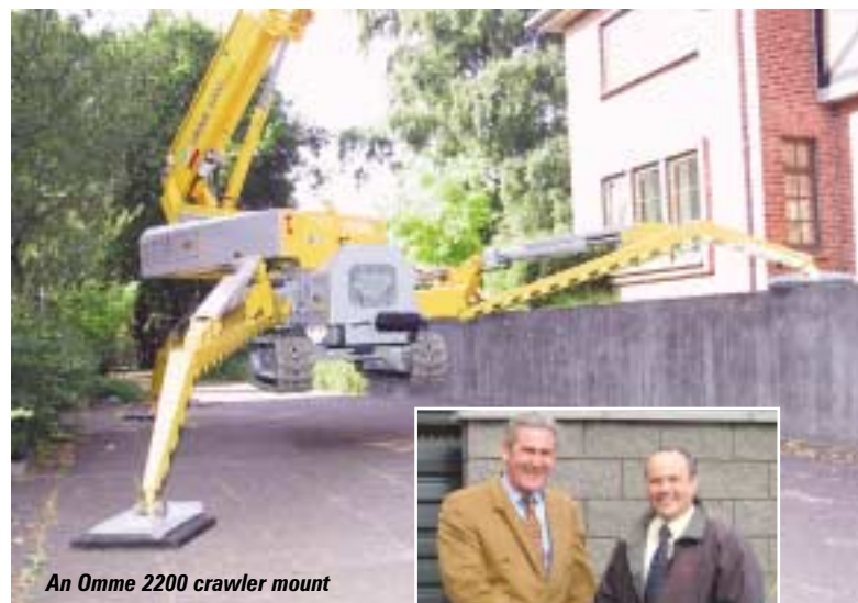
An Omme 2200 crawler mount

APS has built up a full range of quality powered access solutions which it sells to both end users and rental companies. Other brands distributed by APS include, Snorkel self propelled booms and scissors, Leguan skid steer narrow boom lifts and on a regional UK basis, Niftylift and the Genie range of portable aerial and material lifts. It also