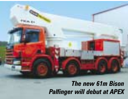
The new 61m Bison Palfinger will debut at APEX

Bison Palfinger will extend its range with a new 61 metre working height truck mounted lift at APEX in September.