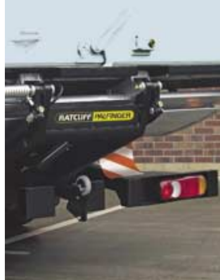
A Ratcliff-Palfinger "Tuckaway" tailift