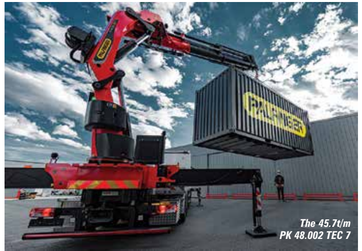
The 45.7t/m PK 48.002 TEC 7