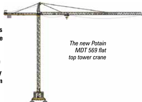
The new Potain MDT 569 flat top tower crane

Potain has added the MDT 569 flat top tower crane to its Topless range. The new crane offers maximum capacities of between 20 and 32 tonnes with a maximum jib length of 80 metres and jib tip capacity of up to 4.2 tonnes. Maximum hoist speed is 195 metres a minute. The crane can be used with the manufacturer's new eight metre cross-shaped base, which is said to be easier to assemble compared to previous bases, while its modular design allows for easier erection and more efficient transport.