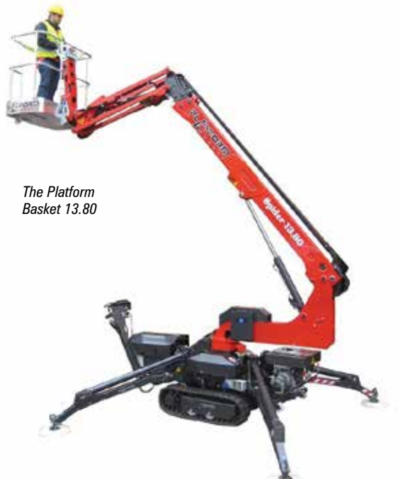
The Platform Basket 13.80

Once the machine is set up and levelled, the remote controller sits in a cradle in the basket and in the case of any battery issues it can be plugged into a spare connector below the cradle to create a tethered controller. The Pro package is only available on a new machine and cannot be retrofitted. Shipments are due to begin in July.