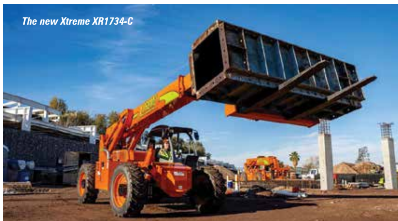
The new Xtreme XR1734-C

The XR1734-C can take 5.9 tonnes to its maximum lift height and handle 2.9 tonnes at its maximum forward reach of 5.1 metres. Weighing just over 15 tonnes, the new telehandler is powered by a Cummins Tier IV diesel and includes frame levelling of up to 11 degrees.