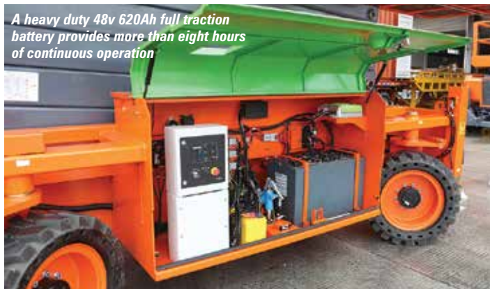
A heavy duty 48v 620Ah full traction battery provides more than eight hours of continuous operation