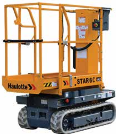
Haulotte's new tracked Star 6 mast type lift

Haulotte has launched a tracked version of its 12.5ft Star 6 mast type lift. The new battery powered lift offers a working height of 5.8 metres and a maximum platform capacity of 200kg - with a two person rating for indoor and one person rating for outdoor applications.