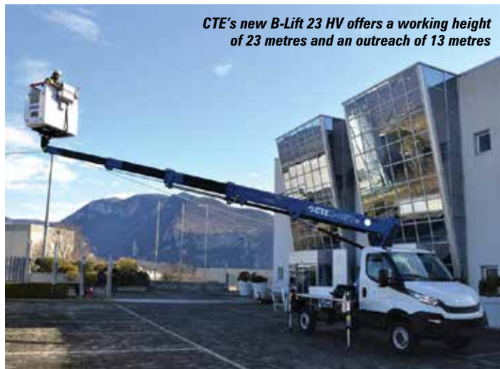
CTE's new B-Lift 23 HV offers a working height of 23 metres and an outreach of 13 metres

The company's Connect telematics system is standard and includes diagnostics, machine location and remote setting of work envelope parameters such as a maximum working height or outreach.