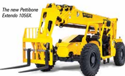
The new Pettibone Extendo 1056X.

The new North American style telehandler can take two tonnes to its maximum lift height and manage 408kg at its maximum forward reach of 12.2 metres. Weighing 12.5 tonnes, power comes from a Cummins Tier 4 Final diesel or an optional Deutz Tier 4 Final engine. It has an overall width of 2.6 metres, is seven metres long to the fork frame, offers 460mm of ground clearance and has a turning radius of 4.37 metres. The 1056X joins three other models in the Extendo range including the four tonne/1.35 metre 944X, the 5.4 tonne/14 metre 1246X and the 5.4 tonne/17.8 metre 1258X.