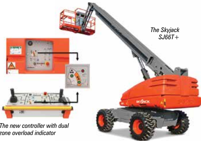
The Skyjack SJ66T+

When the platform reaches the edge of the restricted/high capacity zone with a heavy load, an amber light warns the operator before extension functions lockout. The operator then can only bring the platform back into the restricted zone. When the machine is overloaded in the unrestricted capacity zone, functions are locked out until the excess weight is removed. The emergency lowering system remains active. The SJ40T+ and SJ60T+ will only be available in the Americas, while the 45T+ and 66T+ are global machines. See Boom lifts on page 27.