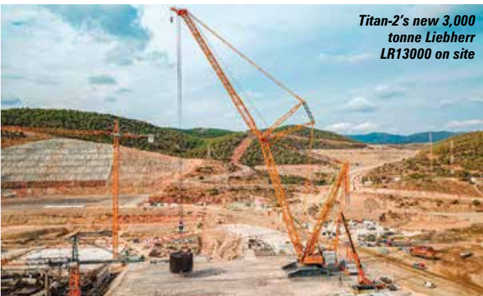
Titan-2's new 3,000 tonne Liebherr LR13000 on site