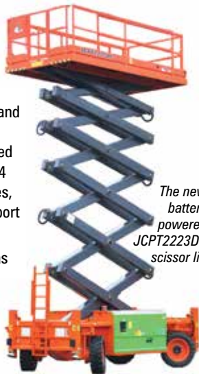
The new battery powered JCPT2223DC scissor lift

The combination of big battery pack and efficient drive train is said to provides more than eight hours of continuous operation under typical heavy working conditions.