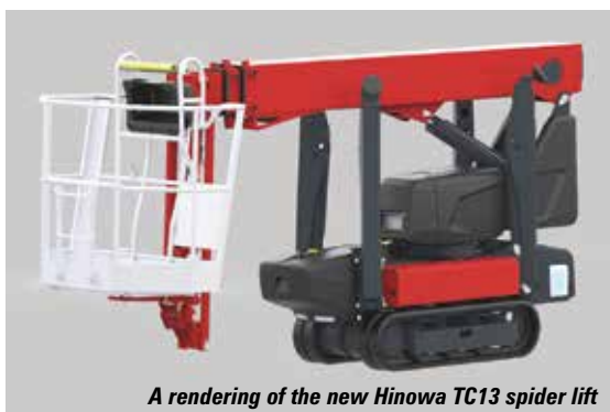
A rendering of the new Hinowa TC13 spider lift

The TC13 lift has an overall length with basket removed of just under 3.7 metres, an overall width of 748mm and an overall height of 1.95 metres. The extended outrigger footprint is 2.45 by 2.9 metres - the width of a single parking space. Other features include automatic control of telescopic and elevate functions so that it can lift or lower parallel to the work to a height of nine metres, as well as 'go home'/'go back' functions to stow the machine or return to the last working position with the press of a single button.