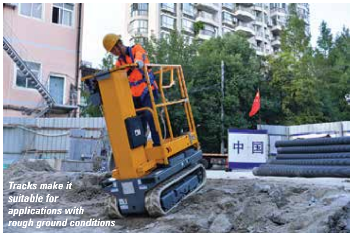
Tracks make it suitable for applications with rough ground conditions

Weighing 1,175kg, the Star 6C has an overall width of 760mm, is 1.44 metres long and has a stowed height of 1.72 metres. All components are water proofed and easily accessed for maintenance while the four section telescopic mast uses a multistage hydraulic cylinder, eliminating the need to inspect or maintain chains or cables. Shipments are due to begin in Europe and Asia/Pacific later this year.