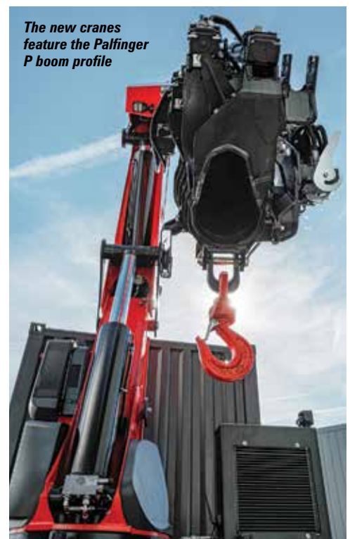
The new cranes feature the Palfinger P boom profile

The TEC 7 model is equipped with Palfinger's 'Weigh' function allowing the operator to accurately weigh a load directly with the crane while also helping with set-up. The system automatically saves the last 10 weighing operations and can add them up if required, useful when loading a truck.