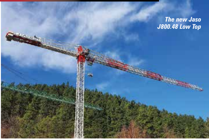
The new Jaso J800.48 Low Top