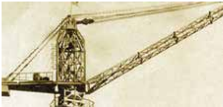
XCMG's first crane.