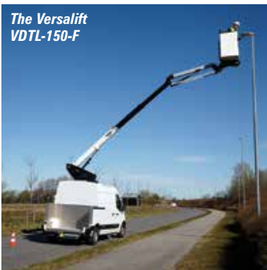
The Versalift VDTL-150-F

The VDTL-150-F has an overall length of 5.9 metres and a stowed height of 3.3 metres, while the stabiliser footprint falls within the overall width of the wing mirrors. It also offers 350kg of payload in addition to a driver, passenger and a full tank of fuel.