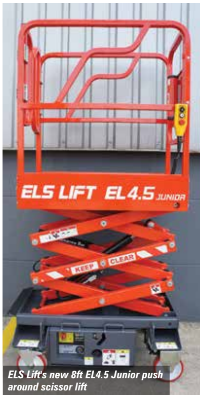
ELS Lift's new 8ft EL4.5 Junior push around scissor lift

The EL4.5 offers a working height of up to 4.5 metres with a platform capacity of 240kg. Weighing 365kg, it has a stowed height of 1.77 metres and an overall width of 750mm, allowing it to easily pass through single doorways and travel in the smallest of elevators. Features include integrated fork lift pockets, saloon style entry gate and an audible alarm when the platform is descending. The EL4.5 joins the company's 11.5ft EL5.5 Junior push around scissor lift and the EL5.5 Junior SP self-propelled lift.