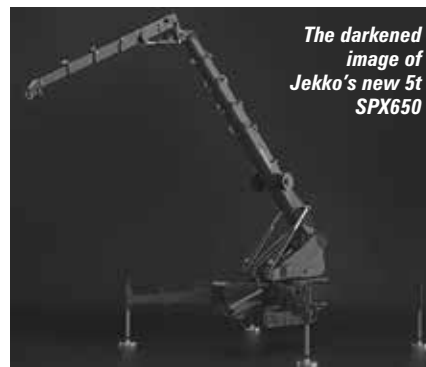
The darkened image of Jekko's new 5t SPX650

The launch is scheduled via a live streaming event in July with shipments due to begin later in the year.