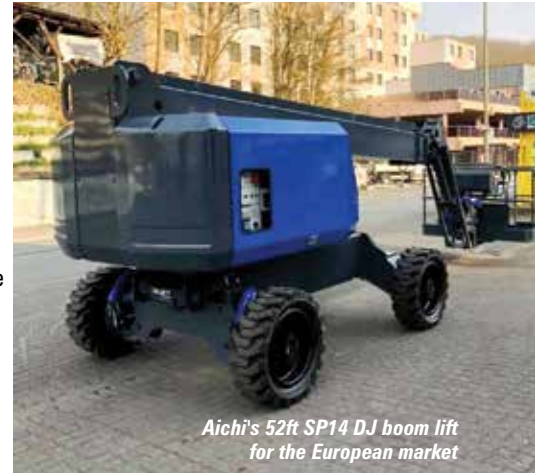
Aichi's 52ft SP14 DJ boom lift for the European market

The SP14DJ features a three section telescopic boom topped by an articulated jib to offer a maximum working height of 15.9 metres, an outreach of 12.6 metres and an unrestricted platform capacity of 270kg. It has an overall width of 2.3 metres, a transport length of 7.75 metres and can pass under a 2.5 metre overhead obstruction. Weighing 8,450kg and powered by a Stage V Yanmar diesel with particulate filter, the new boom is fully compliant with the latest EN280 standards.