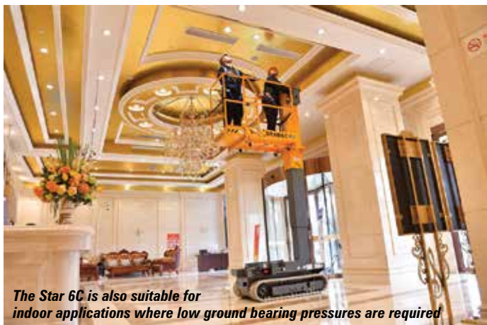
The Star 6C is also suitable for indoor applications where low ground bearing pressures are required