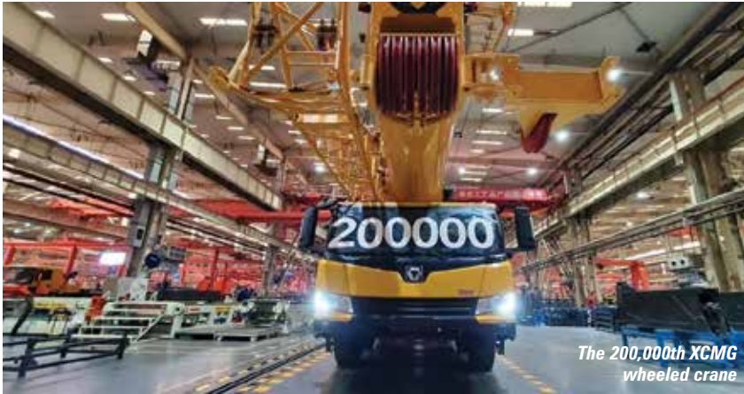
The 200,000th XCMG wheeled crane