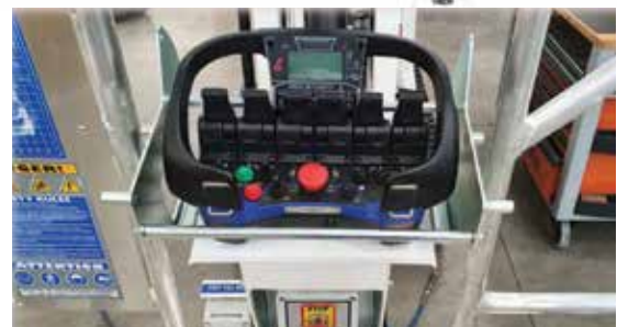
The new Scanreco remote controller in the basket cradle.