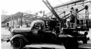
XCMG's first wheeled crane in 1963 - a 5 tonne truck crane.