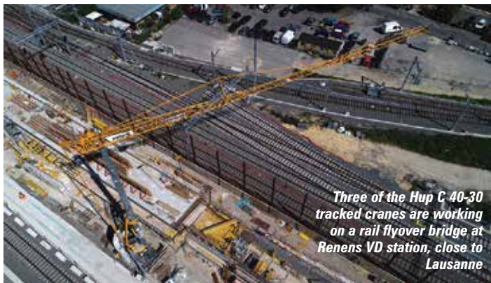
Three of the Hup C 40-30 tracked cranes are working on a rail flyover bridge at Renens VD station, close to Lausanne

with a jib tip capacity of 7,300kg for the 35 tonner and 6,700kg for the 50 tonner version. The maximum free standing height is 78.8 metres. The new crane shares several jib sections with the wider 2100 series, while the modular design of the jib and counter jib provides up to six different configurations. Features include Comansa's Cube Cab, automatic changing of the double trolley and high speed hoists. The 37.5 tonne model can be converted to handle 50 tonnes by changing the front trolley and hooks.