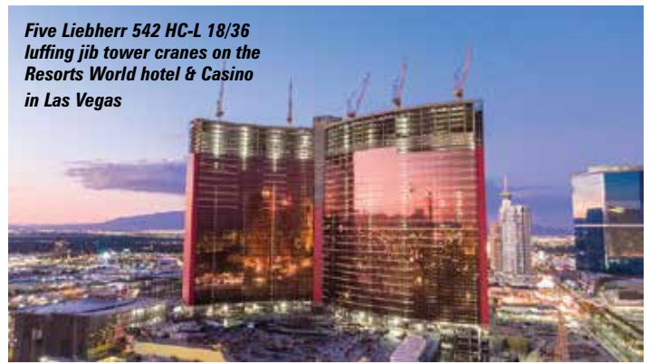
Five Liebherr 542 HC-L 18/36 luffing jib tower cranes on the Resorts World hotel & Casino in Las Vegas

The cranes, which can handle 4,300kg at the maximum radius of 65 metres, were chosen, says