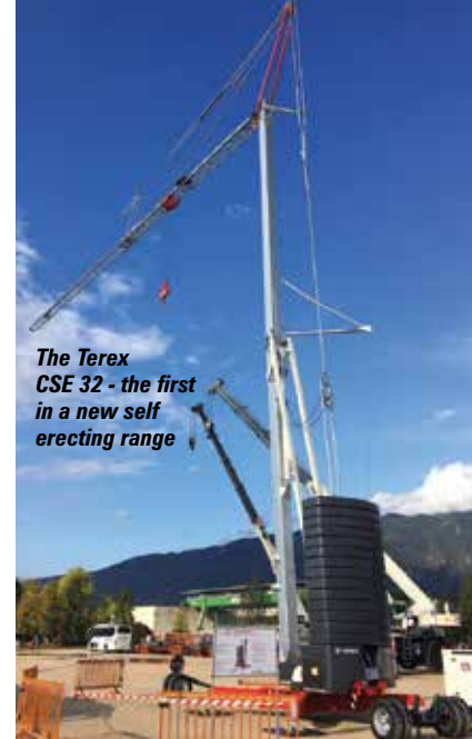
The Terex CSE 32 - the first in a new self erecting range

Finally the company has also launched its own "easy to install" operator hoist - the T-Lift - an external mounted rack and pinion operator elevator with a 200kg