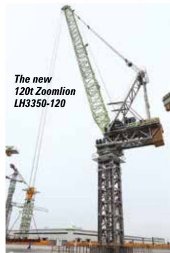
The new 120t Zoomlion LH3350-120

In terms of new products, the company unveiled its new 120 tonne LH3350-120 luffing jib tower crane with a 73 metre internal climbing shaft allowing few climbs for ultra-high buildings and uses a relatively compact 3.25m x 3.25m cross section tower.