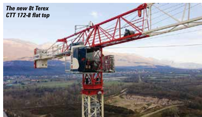
The new 8t Terex CTT 172-8 flat top