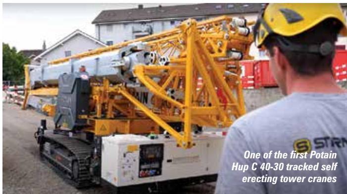
One of the first Potain Hup C 40-30 tracked self erecting tower cranes