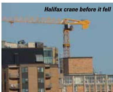
Halifax crane before it fell

Nova Scotia experiences the tail end of many Atlantic hurricanes