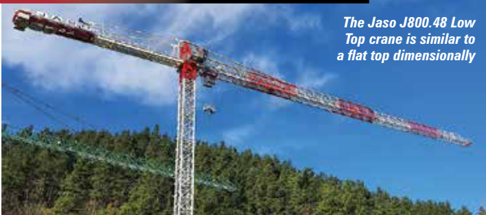
The Jaso J800.48 Low Top crane is similar to a flat top dimensionally

of the new crane, the company's second largest tower crane behind the 64 tonne J1400 unveiled last year at Bauma.