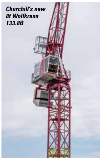
Churchill's new 8t Wolffkran 133.8B

Based in Ringwood, Churchill took delivery of the first Wolff 133.8B last year. The latest three went straight to sites in Burnham, Hythe and Taunton. The purchase is part of the company's plan to convert its entire saddle jib crane fleet to luffing jib models.