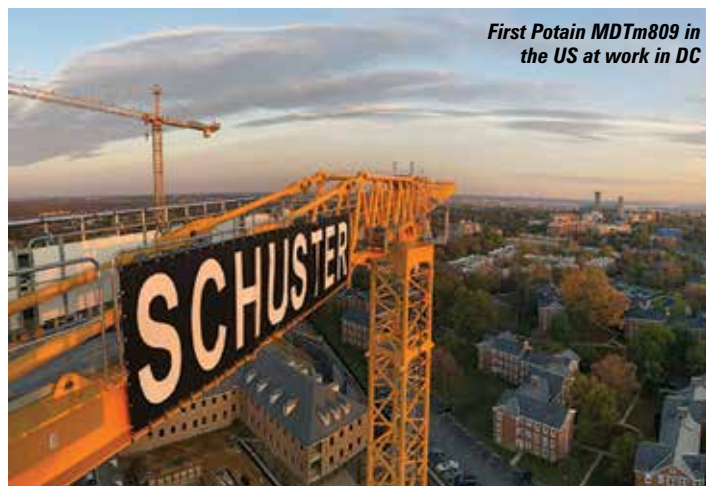
First Potain MDTm809 in the US at work in DC

Spanish tower crane company Jaso was in the process of finalising the details for the launch of the second crane in its new high capacity range - the 48 tonne J800.48 - when Covid-19 hit Spain hard, upsetting some elements of its launch plans. We can however provide details