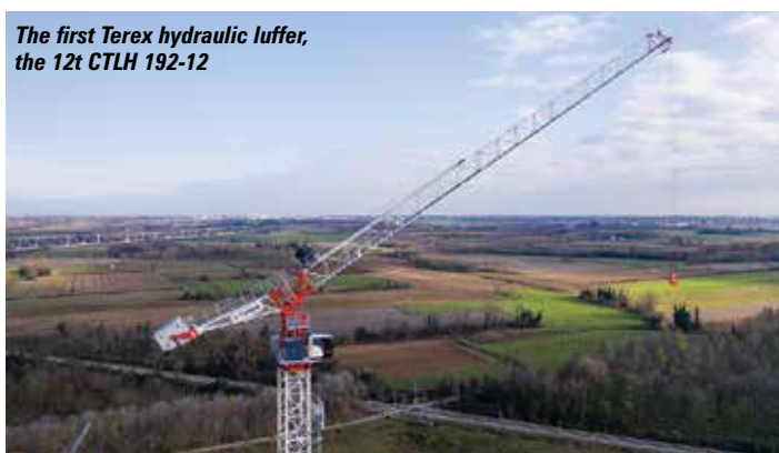
The first Terex hydraulic luffer, the 12t CTLH 192-12