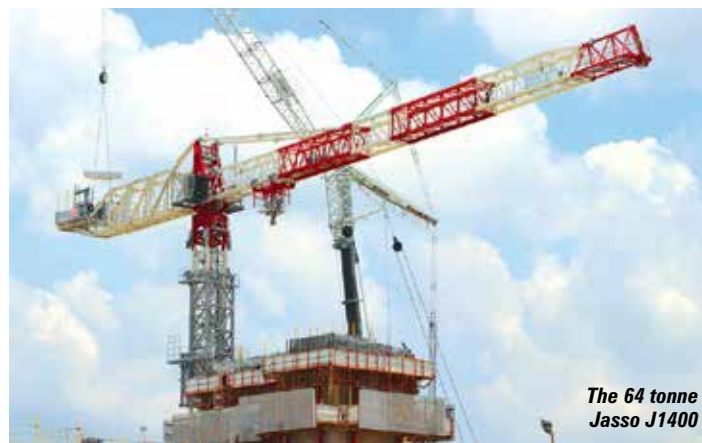
The 64 tonne Jaso J1400