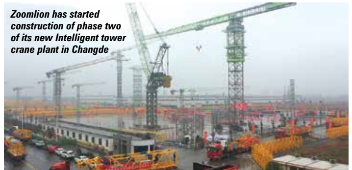
Zoomlion has started construction of phase two of its new Intelligent tower crane plant in Changde