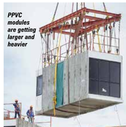
PPVC modules are getting larger and heavier