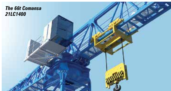
The 66t Comansa 21LC1400

entire crane to ship in standard 40ft shipping containers.