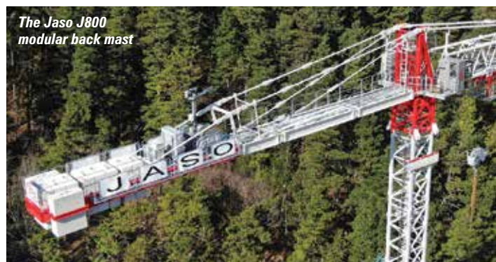
The Jaso J800 modular back mast

Launched last year at Bauma, Jaso's largest crane, the J1400 is also a Low Top unit and offers a maximum capacity of 64 tonnes with jib lengths to 80 metres at which the maximum capacity is 10.5 tonnes. The tower head is just 5.57 metres high but stands just three metres proud of the jib's top chords and less than a metre above the substantial counter jib which can be rigged with lengths of between 18 and 29 metres. It also folds for easy transport, allowing the