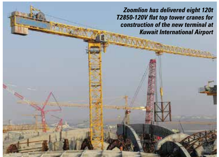
Zoomlion has delivered eight 120t T2850-120V flat top tower cranes for construction of the new terminal at Kuwait International Airport

Morrow, for their capacities, fast line speeds and level luffing feature, the controller automatically adjusts the hoist gear so that the hook and load move horizontally on the single control movement. The client is local contractor W. A. Richardson.