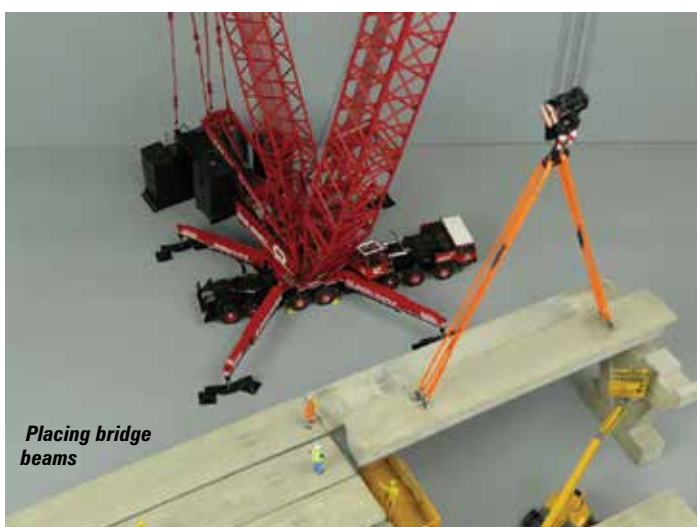
Placing bridge beams