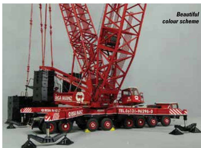
Beautiful colour scheme