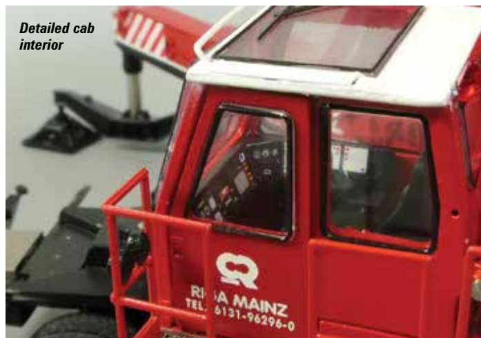
Detailed cab interior