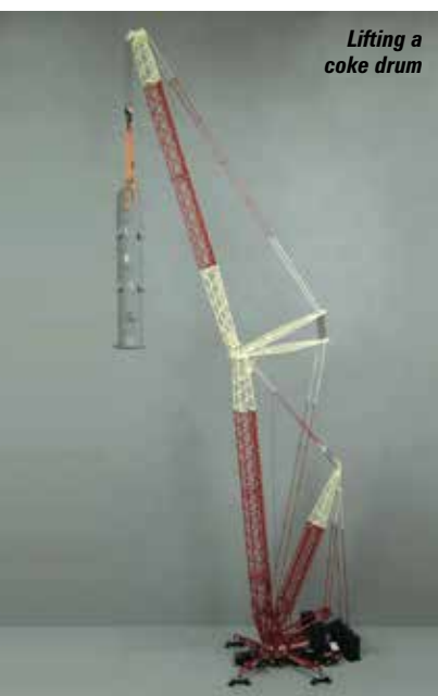
Lifting a coke drum