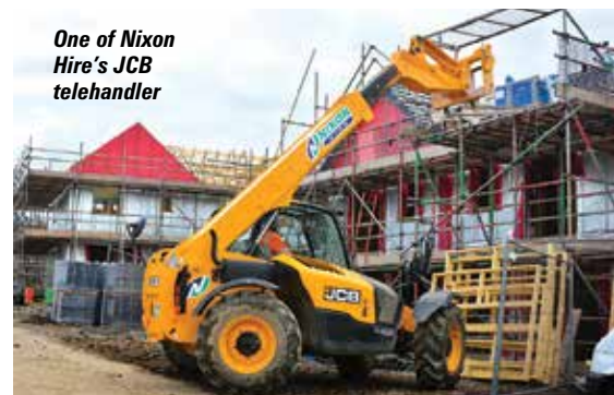
One of Nixon Hire's JCB telehandler

Nixon runs a fleet of 410 telehandlers, making it the ninth largest fleet in the UK. Last year it purchased 163 new telehandlers.