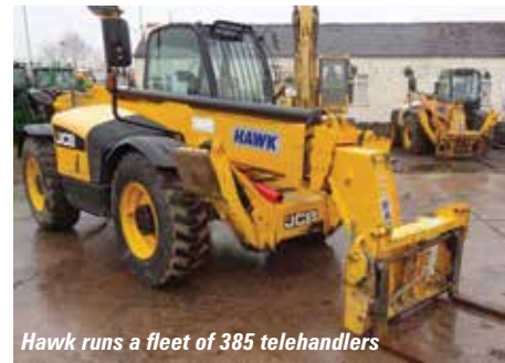
Hawk runs a fleet of 385 telehandlers

In spite of this no warning was given by the company or auditors KPMG when group accounts were filed. The group employed 420 staff, but 83 were let go on appointment of the administrators. Since then Bristol-based Plantforce Rentals acquired the Hawk business operations and assets at the Hinkley Point C nuclear power plant in Somerset, including around 100 employees. Hawk is owned by senior managers and Business Growth Fund.