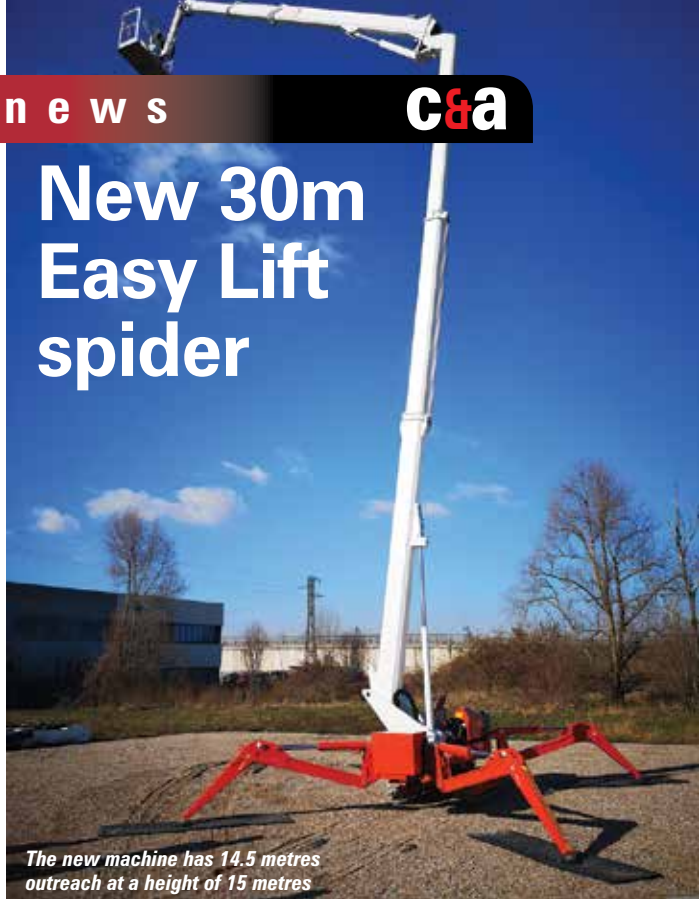
The new machine has 14.5 metres outreach at a height of 15 metres

Italian aerial lift manufacturer Easy Lift will launch a new 30 metre articulated tracked spider lift at Bauma. The new machine - the RA31 - employs a three section telescopic riser/lower boom and three section top boom crowned by a 1.8 metre jib with 170 degrees of articulation, providing a working height of 30.2 metres and 14.5 metres outreach at an up and over height of 15 metres. Maximum platform capacity is 230kg and total weight of the hybrid model is 4,300kg.