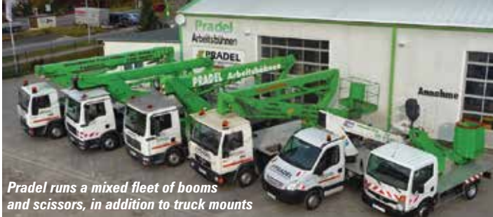
Pradel runs a mixed fleet of booms and scissors, in addition to truck mounts