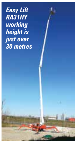
Easy Lift RA31HY working height is just over 30 metres

The outriggers have a variable footprint, while the overall stowed width is 890mm although the tracks extend for greater stability when travelling. Overall height is 1.9 metres and overall length with basket removed 6.1 metres. Standard equipment includes Scanreco radio remote controls as well as a fixed control console in the platform and electric auxiliary/emergency pump.