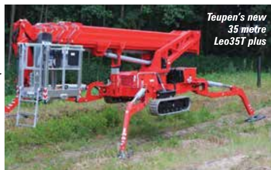
Teupen's new 35 metre Leo35T plus

The remote control is also equipped with an engine start/stop function. The outriggers have several set up positions to cope with different work areas and also allow the lift to level up on slopes of up to 30 percent. The machine is available with four different platform sizes with widths ranging from 900mm to two metres.