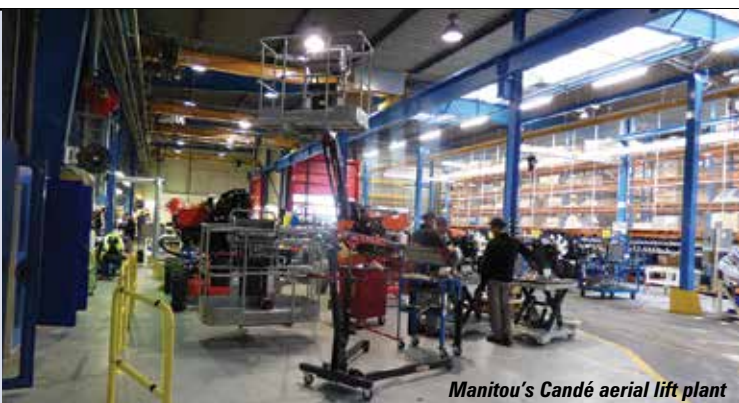
Manitou's Candé aerial lift plant

Manitou says that its sales of aerial lifts have reached a point - apparently more than €200 million in 2018 - that requires more capacity. As a result, the company has approved a €26 million investment in additional production facilities at the Candé aerial lift plant, which should be completed by the end of 2020.