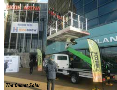
The Comet Solar