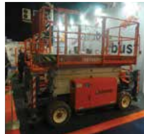
Snorkel's S2755RT - now built in the UK.