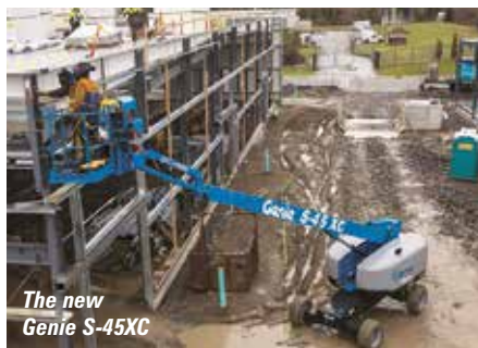
The new Genie S-45XC

The Grove GMK3060L will be launched at Bauma