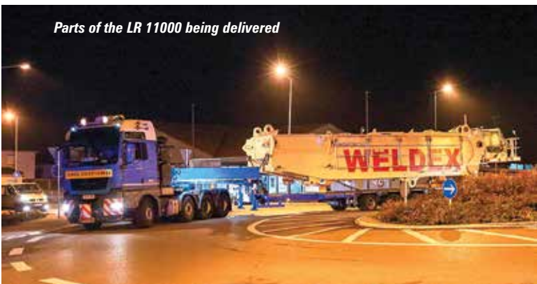
Parts of the LR 11000 being delivered

The LR 11000 includes 108 metres of main boom, 114 metre luffing jib, derrick system and ballast trailer. The LTR 1060 features a 40 metre main boom, plus a 9.5 to 16 metre bi-fold swingaway extension.