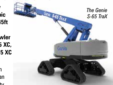
The Genie S-65 TraX