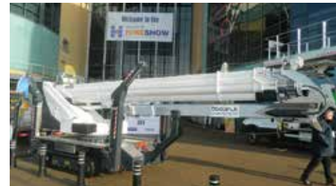
The show entrance with the Böcker RK 36/2400 tracked crane.