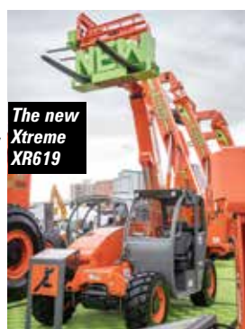
The new Xtreme XR619

The third new machine is the compact 2.7 tonne/5.8 metre XR619 with a forward reach of 3.35 metres. It replaces the Xtreme XR5919 and is the smallest model in the range. It weighs 4,672kg and is powered by a Deutz Tier 4 Final diesel. Overall width is 1.8 metres and overall height 1.9 metres. The boom features long-life boom rollers and a lift point for suspended loads. A choice of three cab configurations is available. Production is expected to begin during the second quarter.