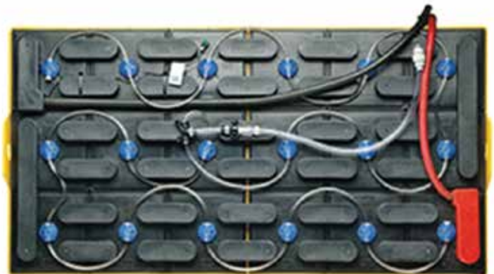
The low profile Stealth Watering System from TVH fills all battery cells to the same level at the same time and claims to take one tenth the time of doing it manually.

owners are still spending a good deal more on battery replacement and maintenance than is necessary.