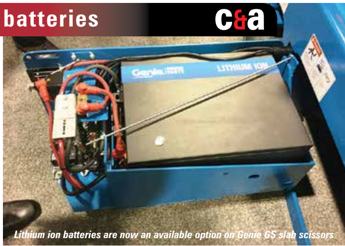
Lithium ion batteries are now an available option on Genie GS slab scissors