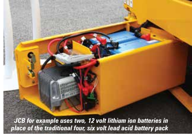
JCB for example uses two, 12 volt lithium ion batteries in place of the traditional four, six volt lead acid battery pack

The reason that they have not until now spread to other platforms is price and until recently the lack of a standard off the shelf product that could simply replace the six volt lead acid unit. Products are now coming on the market but are double or triple the cost of a wet lead acid battery, but it can be argued that you can use fewer of them. JCB for example uses two, 12 volt lithium ion batteries in place of the traditional four, six volt lead acid battery pack. The company added them as an option on its slab scissor lifts after landing a large order from the Dutch rental start up Hoogwerkt. Given that the JCB scissors use traditional hydraulic wheel drive motors, battery life between charges is unlikely to be