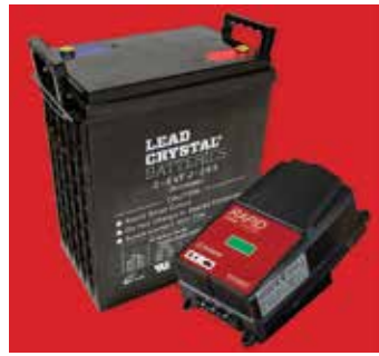
A Lead Crystal battery with Ecobat's Rapid Charger.