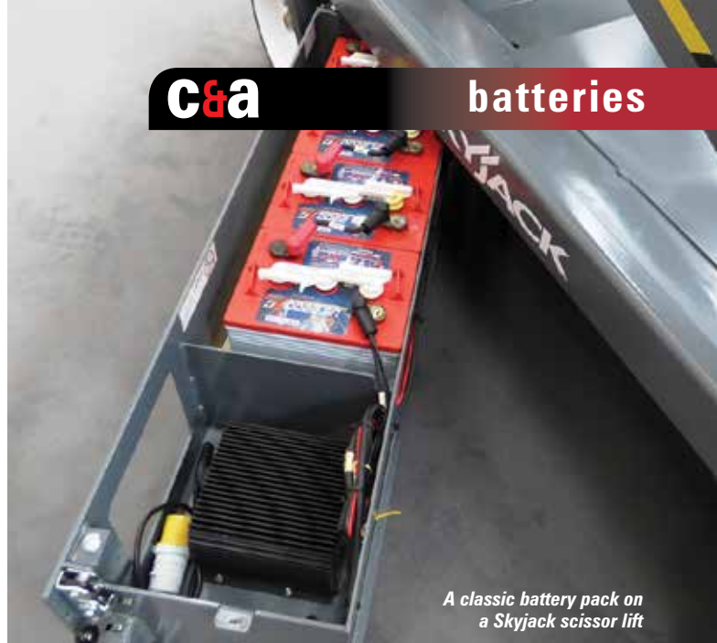
A classic battery pack on a Skyjack scissor lift