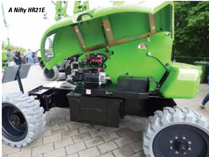
A Nifty HR21E

they would last before needing to be replaced. Hinowa says that apart from some early failures during the warranty period, they have yet to replace a single battery pack.