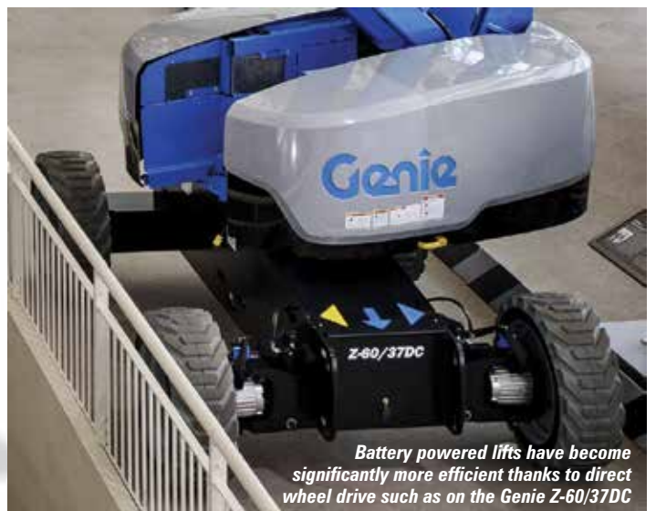
Battery powered lifts have become significantly more efficient thanks to direct wheel drive such as on the Genie Z-60/37DC

increasing use of lithium ion battery packs on spider lifts, which have chalked up a good track record, since Hinowa pioneered them in 2009. The first ones have been in service for almost 10 years now, and in most cases substantially outperformed the original claims in terms of battery life, both between charges and in the number of years