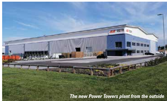
The new Power Towers plant from the outside