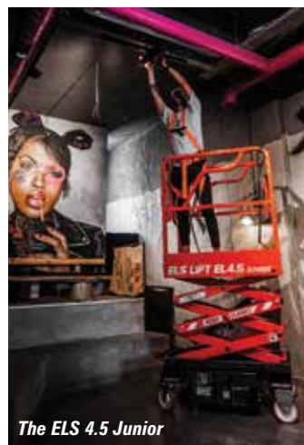
The ELS 4.5 Junior