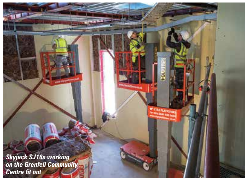
Skyjack SJ16s working on the Grenfell Community Centre fit out

Deciding on the height is the starting point, while the overall weight can be critical due to floor loading limitations. Then maybe platform size is an issue, or perhaps capacity? Although not usually critical at this level, something like the Bravi Lui HD -which offers a 4.9 metre work height, with extended platform of 1.7 metres and 180kg capacity, yet weighs just over