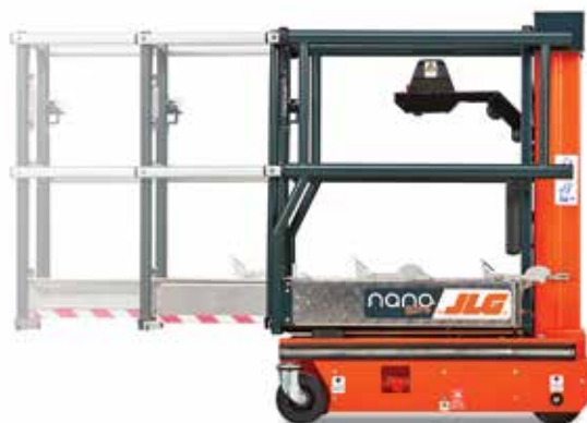
The Peco Lift in new colours...and Nano SP+ self-propelled with dual deck extension