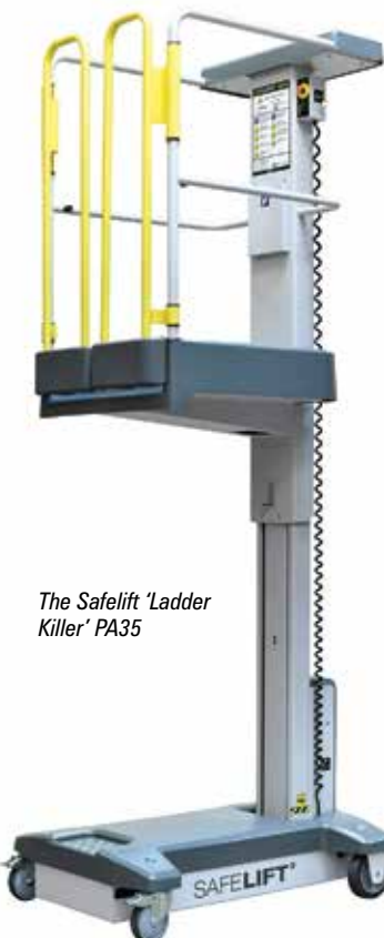
The Safelift 'Ladder Killer' PA35

two button operation, self-locking wheels to prevent movement when elevated and an excellent retractable sliding guardrail system, which allows the operator to quickly switch from full length guardrails to a smaller square which allows the platform to pass through suspended ceiling panels. It also includes a laser locator for easy positioning directly below the target work, a maintenance free sealed battery, extra large wheels and saloon style entrance.