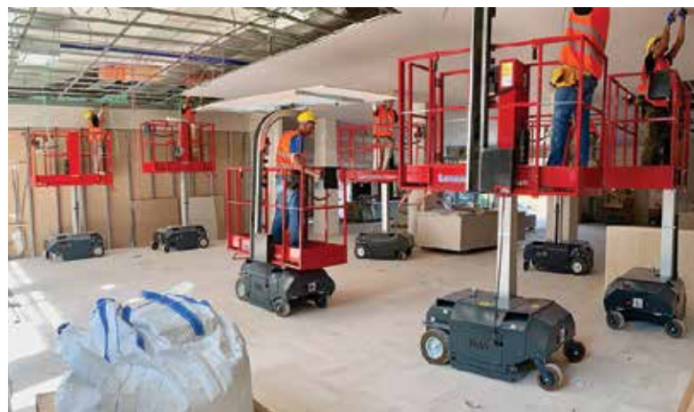
If a big deck and light weight is what you need then go for the Bravi.

There has been talk of competitors to the manually powered Pecolift but the only one we have details on is the new Zarges LiftMaster U, with 4.3 metres working height and a crank handle to raise and lower the platform. Details are scant but it weighs 165kg, has a platform