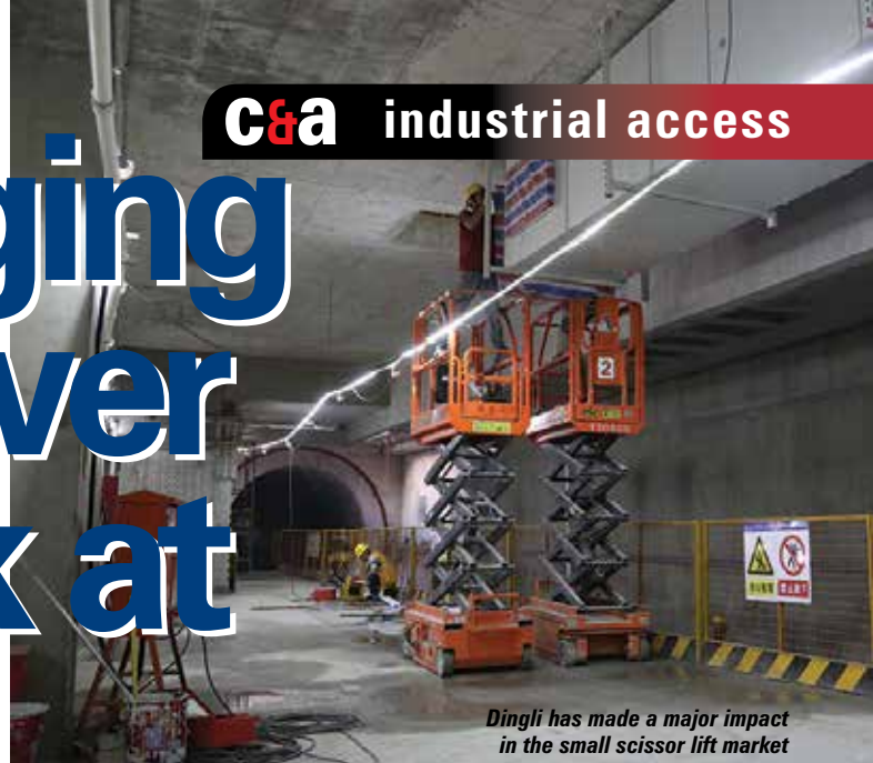
Dingli has made a major impact in the small scissor lift market

Working at heights of up to five metres is by far and away the biggest cause of life changing injuries and fatalities resulting from falls at height. It is also a major cause of minor strains and muscle pulls, as tradesmen move or climb ladders and steps. And yet not only are low level work platforms safer, but they are also more efficient and therefore cost effective! We take a look at the market and some of the latest new products.