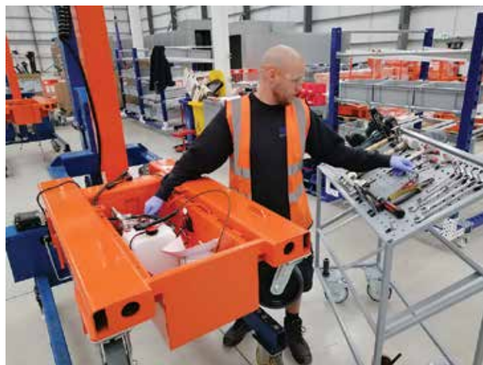
The new assembly lines promise to be a great deal more efficient, especially when the suite of new production line fixtures arrive.

engineers. Their most recent project has been adapting the product range to meet the new ANSI standards.