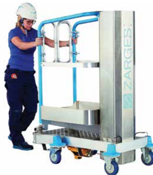
The Zarges LiftMaster U offers a working height of 4.3 metres.