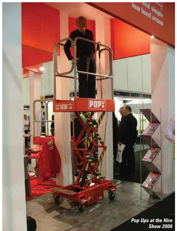
Pop Ups at the Hire Show 2006

Rules covering the temporary work at height have been changing steadily over the past 15 years, with an increased focus on the way work is carried out at lower levels. In Europe this was kick started by the implementation in 2005 of the European Council Directive 2001/45/EC minimum safety and