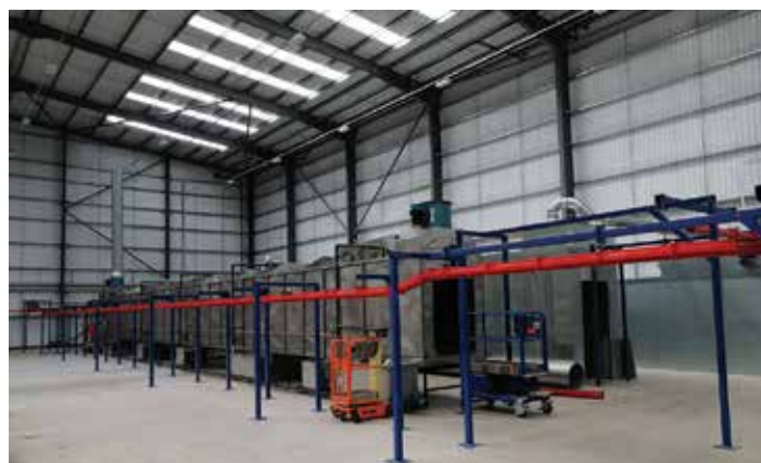
Installation of an all new state of the art paint booth is underway.

Even on a virtual tour, it is clear that the not only will the new plant substantially boost efficiency, helping lower production costs and boost production capacity, but it will also help improve quality and aid