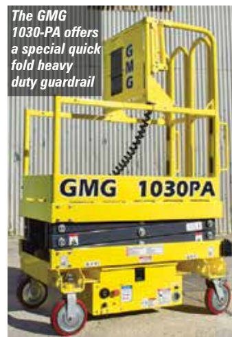
The GMG 1030-PA offers a special quick fold heavy duty guardrail

capacity of 120kg, and an overall retracted width of 740mm. But it also has wheeled stabilisers - due to its light weight - which extend the width to 1.65 metres and is all aluminium.