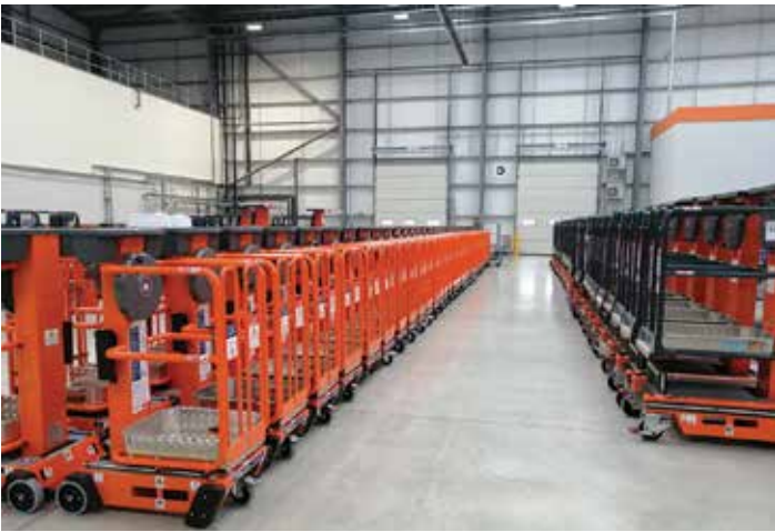
The new facility has plenty of space for both indoor storage of stock machines and a large yard for larger JLG platforms.

the environment, thanks to an array of built in 'green' measures such as automatic LED lighting, grey water collection and recycling for a wash down in the yard, solar panels on the roof and onsite waste recycling, complete with a compactor/baler which has substantially cut the amount of material going to land fill.