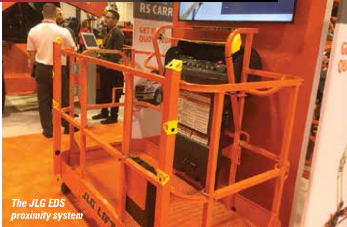
The JLG EDS proximity system