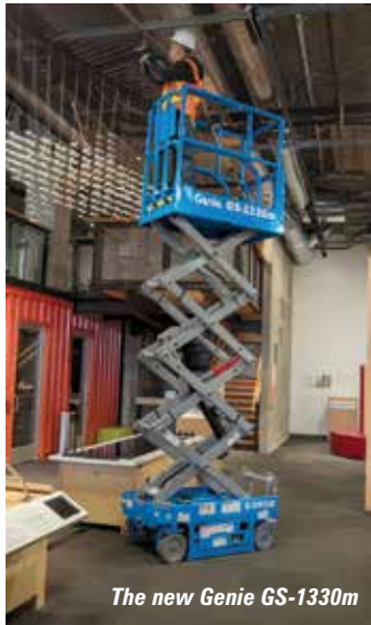
The new Genie GS-1330m

replaces the HB1230. The 16ft unit weighs 934kg while the 12ft weighs 755kg. Platform capacity on both is 250kg although the ZT1630 is limited to one person, while the ZT1230 can handle two. Overall length of both machines is 1.57 metres with a 760mm overall width, making them longer than the original but with a