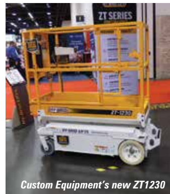
Custom Equipment's new ZT1230