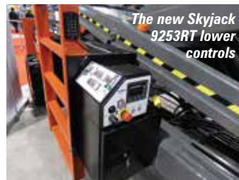
The new Skyjack 9253RT lower controls

While the range is based on the popular SJ9250RT, it is in reality a totally new machine with a new scissor stack, a new drive train - adopted from the company's boom lifts, new levelling jacks, a new smaller Kubota engine which is mounted transversely so that it does not need to pull out to service, new cushion-type solid RT tyres, a totally new Skycoded control system and improved hose routing. Most of the changes have zero cost or save money allowing the company to maintain pricing on a significantly improved machine.