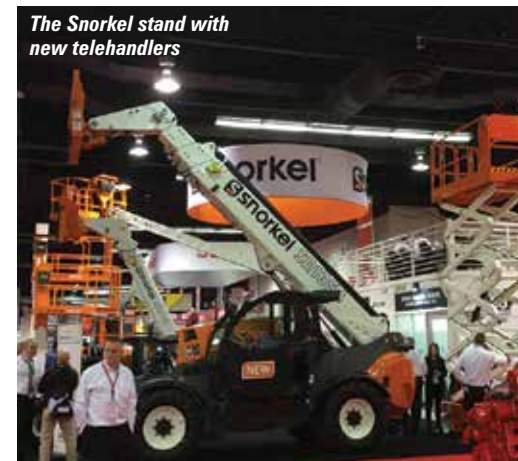
The Snorkel stand with new telehandlers