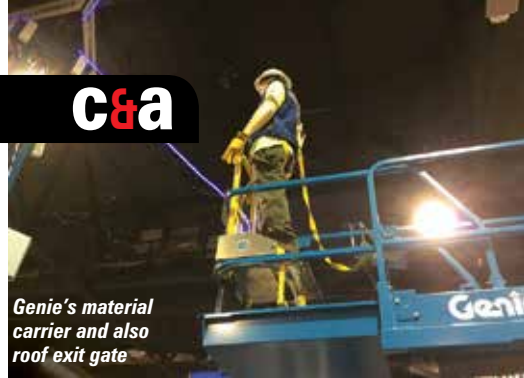
Genie's material carrier and also roof exit gate

charging is much faster and short spells of 'opportunity charging' are possible. The battery also holds its charge when stored, requires zero maintenance and will last a good deal longer than lead acid batteries. Genie also launched a number of accessories - initially for the North American market - including a material carrier and the Access Deck attachment - a step up device to reach difficult areas. One is also available on boom lifts.