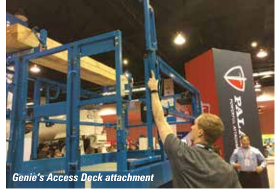
Genie's Access Deck attachment

Finally, for many the ARA was the first chance for many to see the new 13ft GS-1330m micro scissor lift. There were numerous similar machines at the show, with all but one of them made in China.