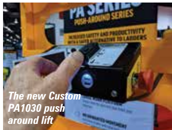
The new Custom PA1030 push around lift