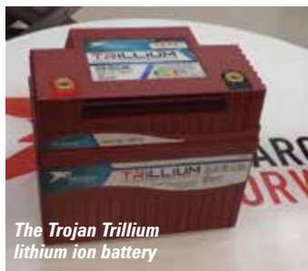
The Trojan Trillium lithium ion battery

Finally Trojan battery generated a good deal of interest with its new Trillium fully self contained lithium ion battery which can easily replace regular lead acid cells.