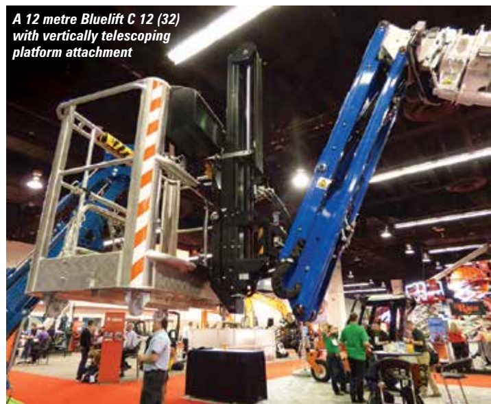
A 12 metre Bluelift C 12 (32) with vertically telescoping platform attachment