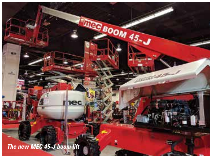
The new MEC 45-J boom lift