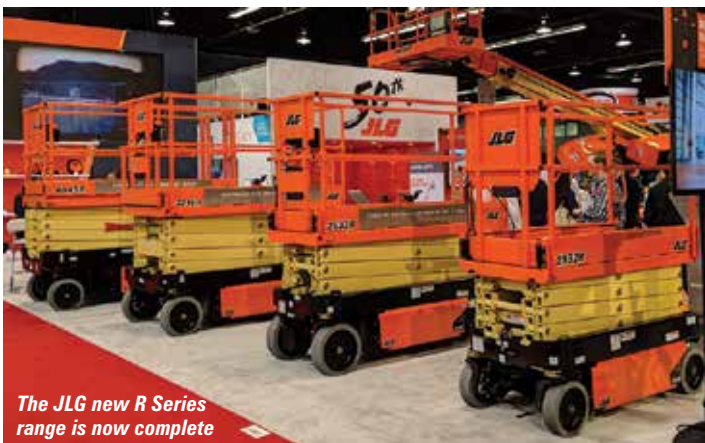
The JLG new R Series range is now complete