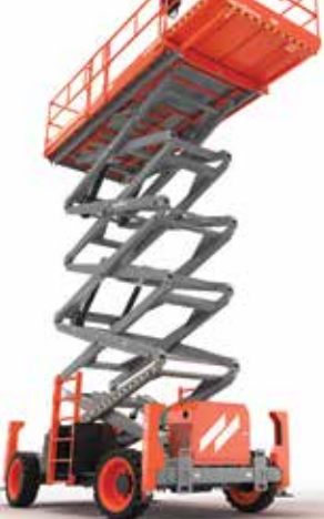
Skyjack's new SJ9253RT