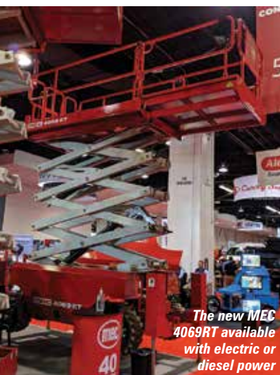
The new MEC 4069RT available with electric or diesel power

MEC unveiled a new 45ft straight boom - the 45-J - with two section boom and jib joining the 60ft boom and 45ft articulated boom lift, and a new compact Rough Terrain scissor lift range - the 40ft 4069 and a 33ft 3369 - both available in diesel or electric versions.