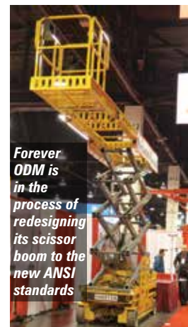
Forever ODM is in the process of redesigning its scissor boom to the new ANSI standards