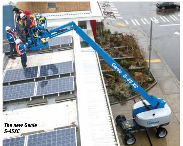
The new Genie S-45XC