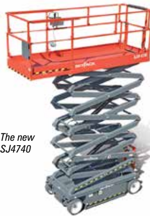
The new SJ4740

logical nomenclature - SJ3219, SJ3226 etc, so for example the 40ft SJIII 4740 now becomes the SJ4740.