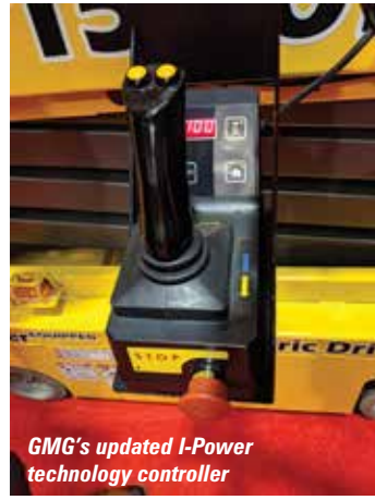
GMG's updated I-Power technology controller