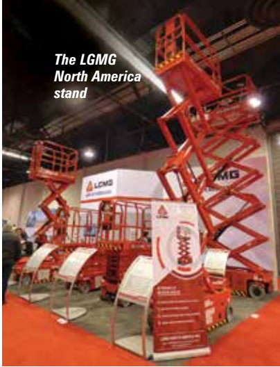
The LGMG North America stand