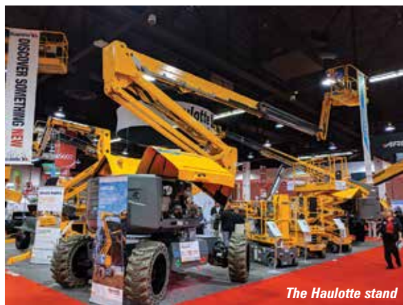
The Haulotte stand