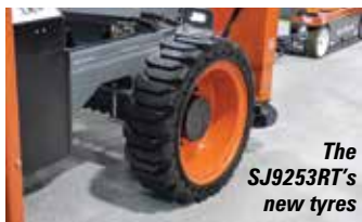
The SJ9253RT's new tyres

Skyjack launched its new four model big RT scissor lift range from the 1,250kg capacity 33ft SJ9233RT to the 63ft SJ9263RT. The other two models are the 43ft SJ9243RT and 53ft SJ9253RT which now provides an 18 metre working height.