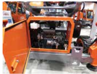
The SJ9253RT's new Kubota installation.