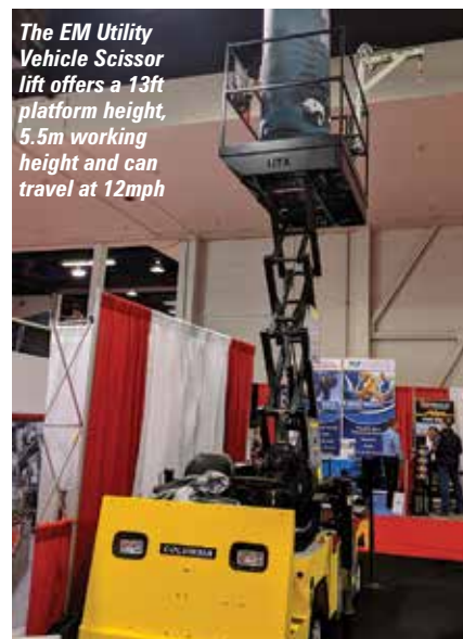
The EM Utility Vehicle Scissor lift offers a 13ft platform height, 5.5m working height and can travel at 12mph