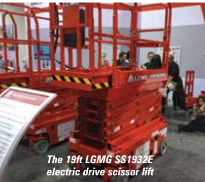
The 19ft LGMG SS1932E electric drive scissor lift

Other products included the new Enhanced Detection System (EDS) with multiple ultrasound beams and cut-outs for working around