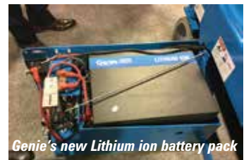
Genie's new Lithium ion battery pack

The company is offering three years' free subscription to the service with every new model. It also surprised with the unveiling of an optional lithium ion battery pack for its slab scissor lift range. Installed on a 19ft GS-1932, it has the same life between recharges as the standard battery pack, however