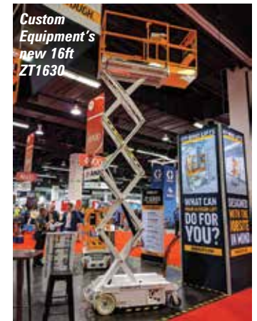
Custom Equipment's new 16ft ZT1630