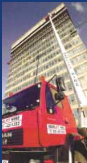
Ireland's tallest lift sold to Manlift Hire

Manlift Hire Ltd of Cork, has purchased, what it claims is the highest aerial lift in the Republic of Ireland. The unit a 45 metre, Wumag WT450 truck mounted lift, is mounted to an MAN 18 tonne four wheel drive chassis. The unit was supplied by SkyKing the UK/Ireland distributor for Wumag.