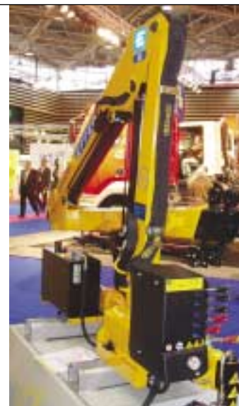
The new Effer 20 Easy Power Baby articulated crane

This new model takes the Effer range up to 31 basic Models with almost 300 different configurations.