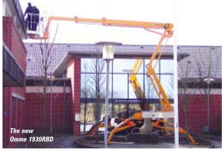
The new Omme 1930RBD