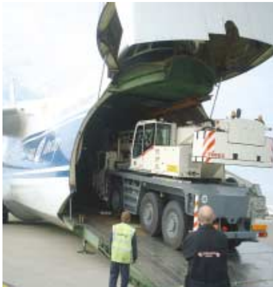
Two 50 tonne Demag AC50-1 were recently sent by air to Kuwait