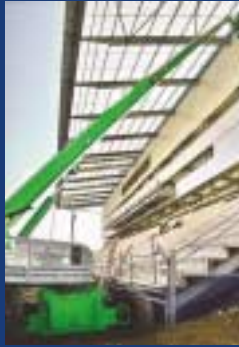
The £1 million order from A-Plant included S80's

A-Plant, part of the Ashtead group has ordered over a million pounds of new Genie aerial lifts, including one of the first 24 metre Genie Z80/60 articulating booms to be delivered to a UK hirer. Other units include S85's straight booms, Z60/34's and Z45/25 articulating booms and GS1932, GS 2646 and GS 5390 scissor lifts.