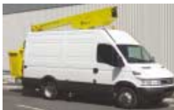
The all new TDA145 from Gardner Denver