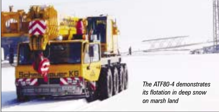
The ATF80-4 demonstrates its flotation in deep snow on marsh land