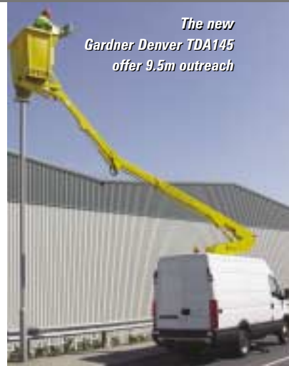
The new Gardner Denver TDA145 offer 9.5m outreach

Gardner Denver, has announced a new 14.5 metre, van mounted platform with a massive 9.5metres of outreach. The TDA145 will be unveiled at SED on the Gardner Denver stand. Typically a van mount this size offers around 7.5 metres. More information in our next issue.