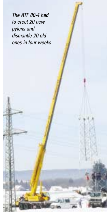
The ATF 80-4 had to erect 20 new pylons and dismantle 20 old ones in four weeks

It was clear, due to the extreme ground conditions, complicated by heavy snow, that the ATF 80-4 needed extra flotation. The crane was fitted with an off the shelf twin tyre system, made by the Swiss company, Schaad. The system was modified by the Schmidbauer Team and installed on the crane. The modification included a method to install the extra tyres in a single man/hour.