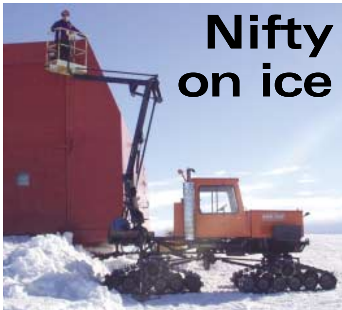
The Nifty 12 mounted to a Sno-cat in Antarctica

In 1991 Niftylift supplied the British Antarctic Survey with a 12 metre high working platform to be fitted to a Sno-cat. The unit has been used for all manner of access duties since then, in temperatures as low as minus 30 degrees Celsius.