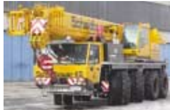
The Tadano-Faun ATF 80-4 with Schaad outrider tyres

could not be used to lift from. The job called for Superior rough terrain capability, a relatively low