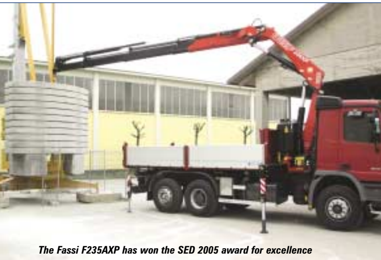
The Fassi F235AXP has won the SED 2005 award for excellence