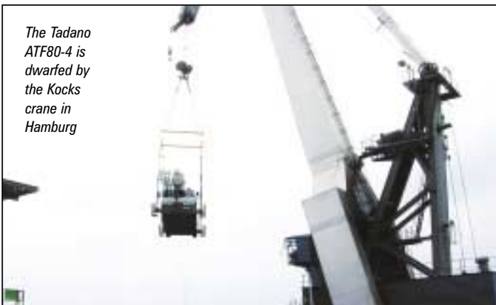
The Tadano ATF80-4 is dwarfed by the Kocks crane in Hamburg

In fact it looked like a toy in comparison....