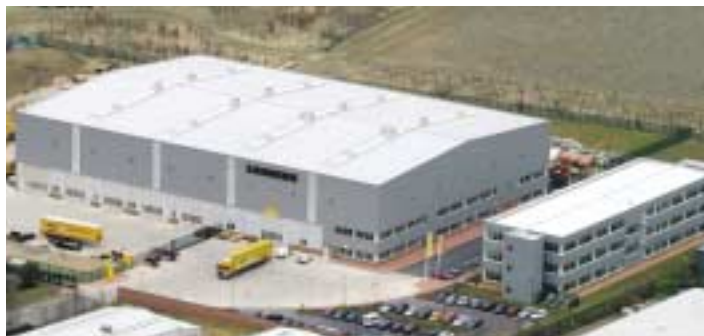
Liebherr GB's new Biggleswade facility

The new facility represents a £15 million investment in the UK market and is in addition to other substantial support facilities in Wigan and Bathgate. The Biggleswade site covers over 9 acres (3.7 Hectares) with workshops, parts and testing buildings of over 5,000 square