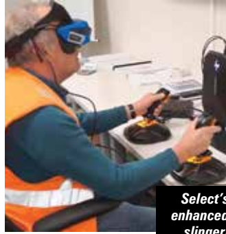
Select's enhanced slinger/signaller course includes VR sessions

Accredited by NOCN and CPCS, candidates that successfully complete the course receive an enhanced slinger signaller training certification by NOCN on their CPCS cards. The course is available at the company's dedicated training centre in St. Neots as well as a number of sites throughout the UK.