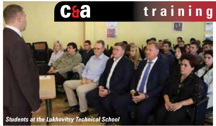
Students at the Lukhovitsy Technical School