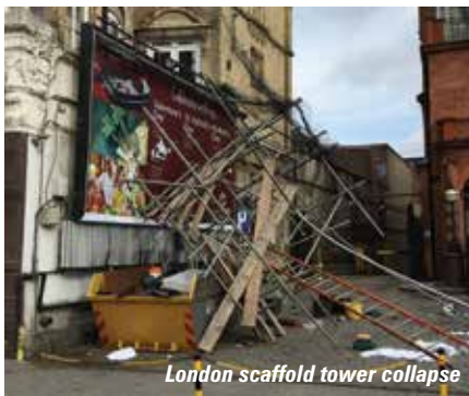
London scaffold tower collapse