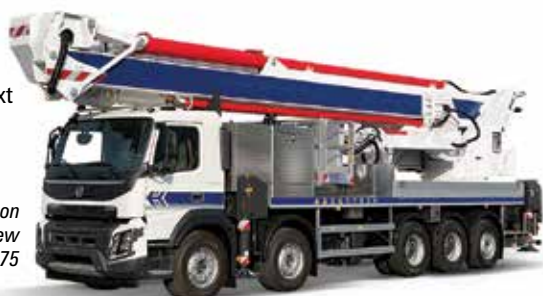
Coming soon the new Multitel MJ775