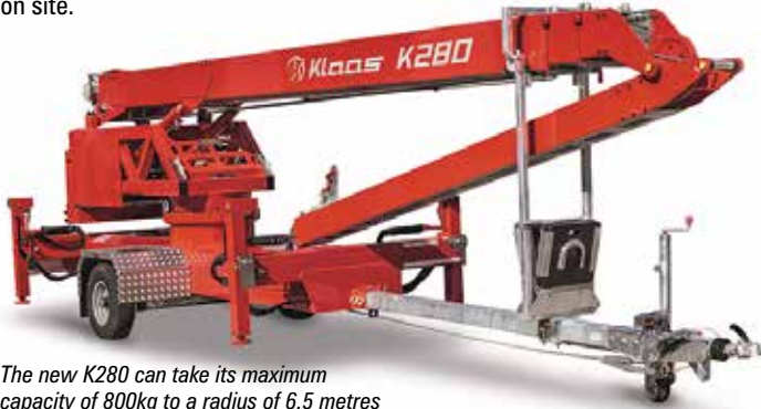
The new K280 can take its maximum capacity of 800kg to a radius of 6.5 metres

Features includes a new remote controller with digital readout and variable outrigger widths from 2.9 to 4.93 metres with automatic levelling and outrigger footprint sensing. The ASC support monitoring system also constantly checks the stability of the crane, taking into account wind and ground conditions. Powered by a petrol/gas engine, the crane has an overall weight of 2.8 tonnes and a self-propelled drive mechanism for manoeuvring on site.