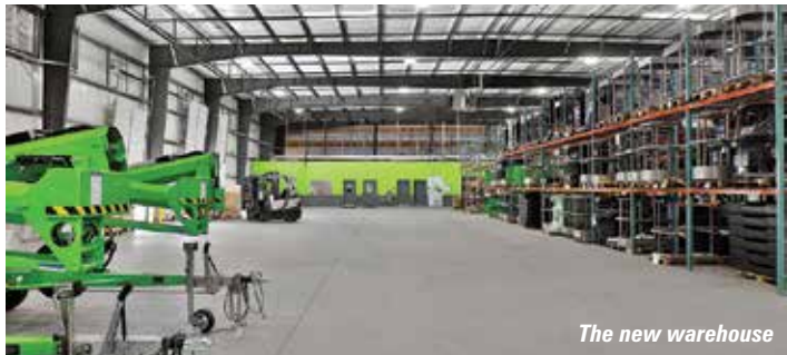
The new warehouse