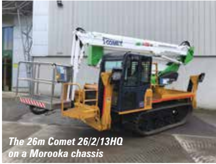
The 26m Comet 26/2/13HQ on a Morooka chassis

Mantis Access - part of Anglo Irish Mantis Cranes - has mounted a 26 metre Comet 26/2/13HQ aerial work platform on a Morooka MST800VDL All Terrain tracked carrier for Scottish specialist equipment sales and rental company John M Paterson. The lift utilises a dual sigma type riser topped by a two section telescopic boom and articulated jib to offer up to 13 metres of outreach at an up & over height of 11.5 metres.