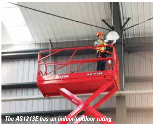
The AS1213E has an indoor/outdoor rating

stowed height of 1.94 metres - with guardrails folded - while overall width is 1.3 metres and length is 2.8 metres. Weighing 3,500kg it features forklift pockets on both the side and rear of the chassis and is compliant with CE, ANSI, EAC and ISO.