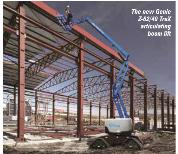
The new Genie Z-62/40 TraX articulating boom lift

Total weight is just under 12,500kg, roughly 2.25 tonnes heavier than the standard wheeled model, while the overall width is slightly wider at 2.58 metres.