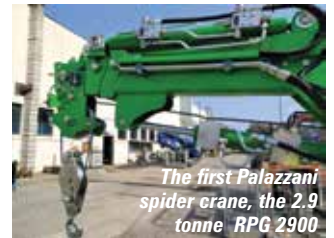
The first Palazzani spider crane, the 2.9 tonne RPG 2900

Features include 360 degree continuous slew, a radio remote controller with display, self-load/unload capability and the ability to level on grounds with a 21 percent variation. The crane is diesel powered with a single or three phase electric motor available for indoor use. The company has also announced plans for the next model in the range, the 3.7 tonne RPG 3700.