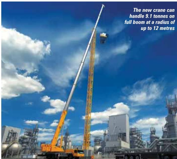
The new crane can handle 9.1 tonnes on full boom at a radius of up to 12 metres

The new crane also features the first of a new modular, convertible hook block range, that are not only lighter, but can be changed for different configurations and loads. For example, a three sheave hook block, which previously weighed 700kg, weighs just 500kg but can be quickly and easily upgraded to 700kg when required.