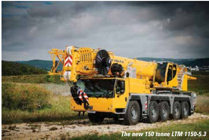
The new 150 tonne LTM 1150-5.3