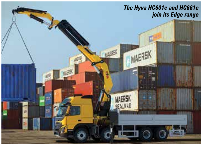
The Hyva HC601e and HC661e join its Edge range

The company has also launched 60 tonne/metre marine versions in the form of the VR60MNG and VR62MNG.