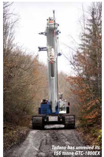
Tadano has unveiled its 156 tonne GTC-1800EX

The GTC-1800EX was originally shown as a Demag TCC 160 scale model on the Terex stand at Bauma 2019 prior to Tadano's acquisition of Demag last year. Developed at the Demag plant in Zweibrücken, it will be the first Tadano crawler crane built in Germany.