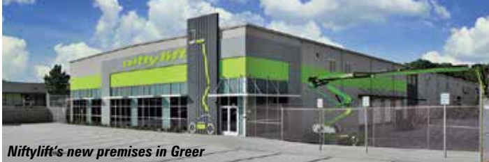
Niftylift's new premises in Greer