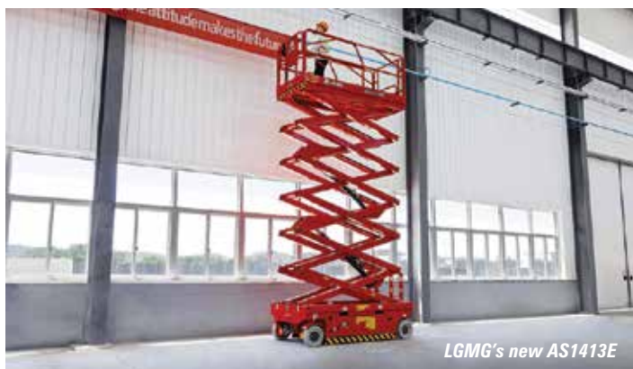
LGMG's new AS1413E

The company said: "The new model competes with the current market leaders in terms of across the board performance, but with a higher standard specification and a significantly lower price tag". Wireless remote controls, non-marking tracks and the company's 'Imer View' GPS remote diagnostics and management system are all standard along with a five year warranty.