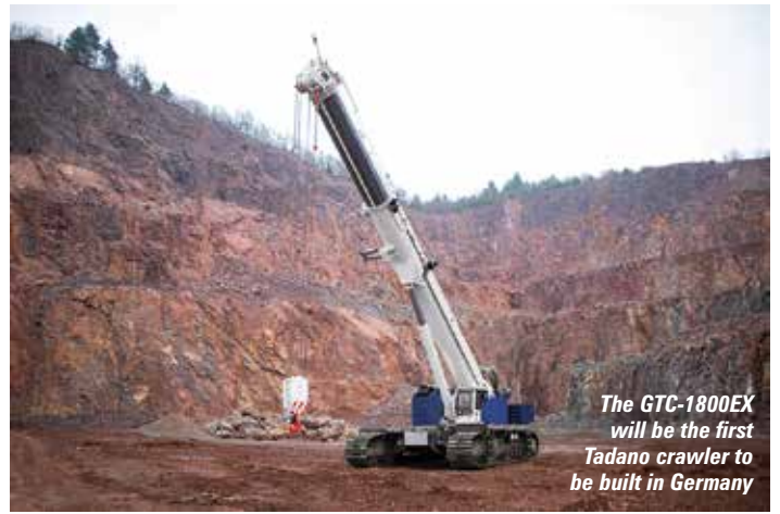
The GTC-1800EX will be the first Tadano crawler to be built in Germany