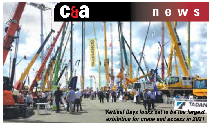
Vertikal Days looks set to be the largest exhibition for crane and access in 2021