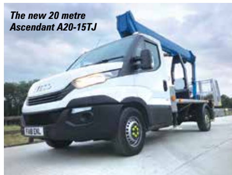
The new 20 metre Ascendant A20-15TJ