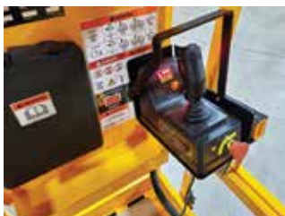
Hy-Brid Lifts new control panel for its Pro-Series scissor lifts.

The panel includes indoor/outdoor selection and movement controls with an enable button that automatically deactivates the controls when not in use. A digital display screen shows battery charge level, percentage of load in the platform and hours on the machine, along with diagnostic information and platform overload and tilt angle warnings. such as platform overload and tilt angle. Operators can cycle through the display with the information button, while active load sensing informs the operator how close they are to maximum capacity.