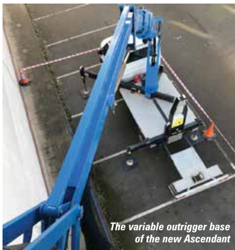
The variable outrigger base of the new Ascendant

All four outriggers are beam and jack, with the rear being regular out and down, while the front ones extend out forward and down. The unit can work with outriggers retracted, partly extended or fully extended on one or both sides. Overall length is just under 7.9 metres, with an overall height of 3.1 metres. 180 degree platform rotation is standard.