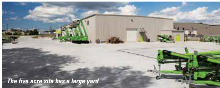
The five acre site has a large yard