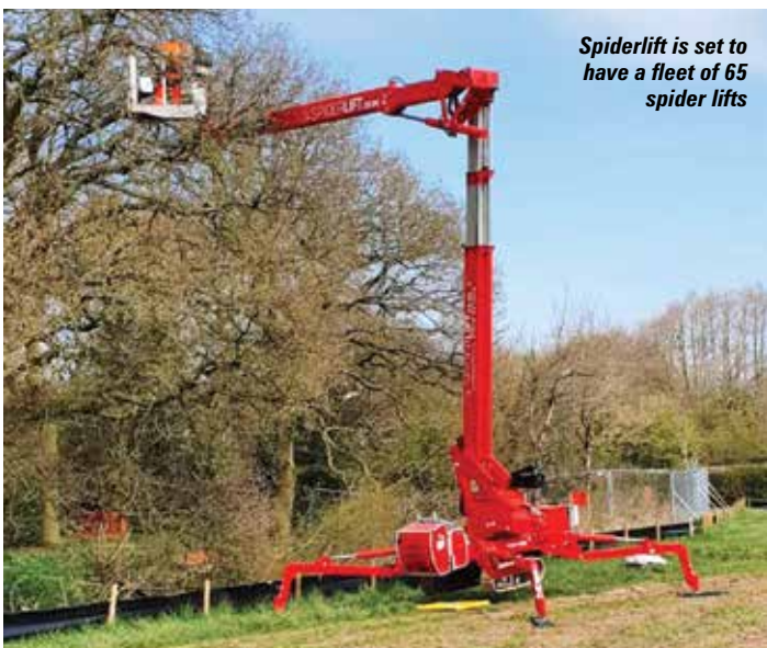
Spiderlift is set to have a fleet of 65 spider lifts