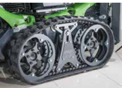
The higher track design on Leguan spiders provides faster and smoother drive capabilities.

New features specifically suited to the arb sector include increased protection for control levers, hoses and booms and a chassis mounted service display providing operator guidance, troubleshooting and after sales support. Steel plates have also been added under and at each end of the chassis for ground protection.