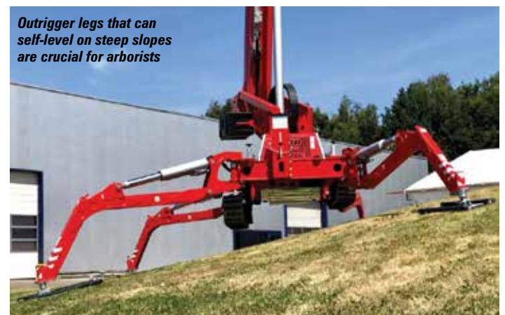
Outrigger legs that can self-level on steep slopes are crucial for arborists

With more than 30 manufacturers and hundreds of models to choose from, it is easy to see why end users struggle to find the most suitable model. The vast majority have been designed to cover as wide a range of applications as possible, both indoor and outdoor, from tree work and construction, to cleaning and retail maintenance. Few are specifically designed for