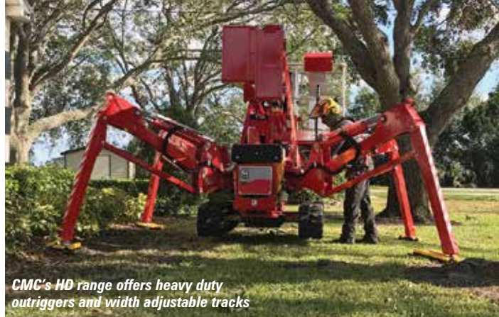
CMC's HD range offers heavy duty outriggers and width adjustable tracks

What arborists rarely ask for when choosing a spider lift is whether it will be suitable for the environmental is it being used in. Russell Woodward of Tracked Spider Sales (TSS), the CMC distributor in