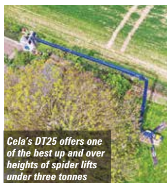
Cela's DT25 offers one of the best up and over heights of spider lifts under three tonnes

a constant stream of heavy duty work and abuse that the tree care or utility sector typically doles out, such as traversing boggy fields, dense forests and tracking through streams or being struck by falling limbs or tools etc... Historically manufacturers such as Teupen, Platform Basket, Ommelift, CMC, and Hinowa have developed models for this type of activity and done well in these sectors.