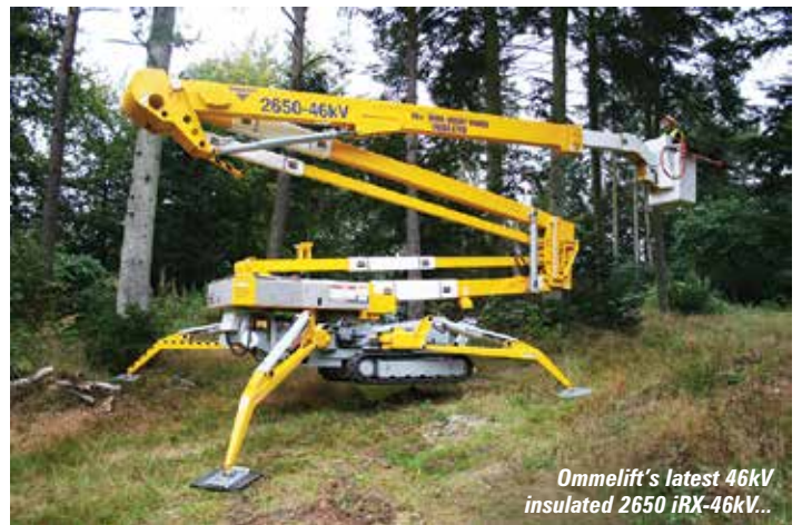
Ommelift's latest 46kV insulated 2650 iRX-46kV...

10kV X18D and its 17 metre 46kV X17E spider lifts. The X18D features a long riser/lower boom, a three section telescopic boom made of hot dip galvanised steel sections, topped by a fibreglass articulating jib and a fibreglass two man platform. The machine offers a 200kg platform capacity and up to 7.2 metres of outreach. The hydraulically adjustable tracks extend from