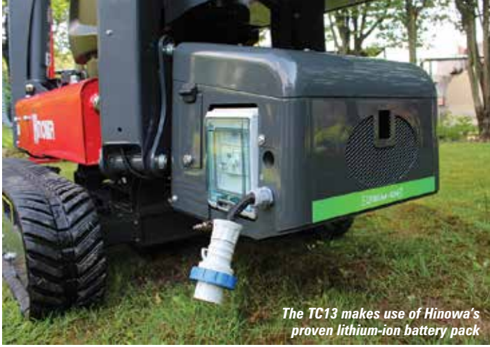
The TC13 makes use of Hinowa's proven lithium-ion battery pack

Mounted on a direct electric drive tracked chassis with permanent magnet motors capable of coping with wet, muddy and dusty ground conditions, the company claims it is four times more efficient than its traditional hydraulic drive systems. The TC13S can last up to five hours on a single charge, features either 110V or 230V onboard chargers and can be charged whilst working. First deliveries are about to begin, so it is perhaps a little early to know how it might cope with the demanding requirements of the arb sector, not to mention distance from a power outlet, but it certainly has a number of features which make it ideal for residential/urban applications.