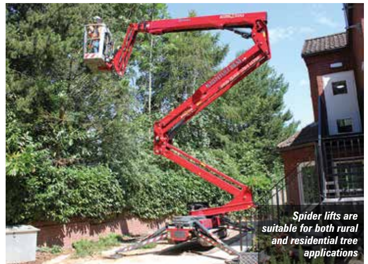
Spider lifts are suitable for both rural and residential tree applications

The spider lift market is unusual in that sales to end users exceed sales to rental companies. This is no coincidence given that spider lifts are most widely used by arborists and residential applications, such as property maintenance. Their appeal comes from the fact that they offer the best working height and outreach in relation to their weight and stowed/transport dimensions. Take a self-propelled boom lift for example – one that offers a 20 metre working height will weigh anything from six and 10 tonnes, whereas a 20 metre spider lift is often less than three tonnes. In most countries this allows them to be transported on a standard two axle