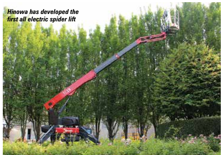
Hinowa has developed the first all electric spider lift

Hinowa has a strong reputation within the tree sector, particularly over 20 metres, however its latest model takes on the other end of the range. The all new 13 metre TC13S has become the world's first all electric telescopic spider lift on the market. Powered by Hinowa's well proven lithium-ion battery pack, it features a three section boom, topped by an articulated jib, while offering up to 6.4 metres of outreach with 230kg unrestricted platform capacity. Total weight is 2,050kg while its outrigger footprint is 3.1 by 2.8 metres. A narrow outrigger version - TC13N - with a 2.9 by 2.4 metre footprint is also available but with a reduced one person, 136kg platform capacity. It also comes in slightly lighter at 1,900kg.