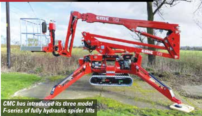
CMC has introduced its three model F-series of fully hydraulic spider lifts

As to which features he thinks are particularly suited for tree care, he says: "It important to make sure you have good ground clearance and long tracks – if they are too short they are more prone to tipping over or nose diving on undulating ground. Having wider or extendable tracks also gives you better stability when tracking. You also want a durable platform made from solid steel, a protected underside and to make sure all wires, cables and cat-track are protected within the boom, otherwise when you track over the scrub or telescope through the canopy you run the risk of damaging the machine. Finally you want to make sure the outriggers can level up on the terrain where arborist tend to use them, which are often much more extreme than with other industries."