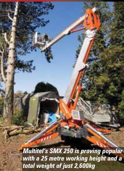
Multitel's SMX 250 is proving popular with a 25 metre working height and a total weight of just 2,600kg