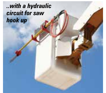
...with a hydraulic circuit for saw hook up

766mm to 1.15 metres while also increasing the ground clearance and overall height by 134mm. Overall weight is 2,380kg. Geared more towards utility companies with 46kV insulation, the 17 metre X17E offers a maximum 9.8 metres outreach with a 230kg platform capacity, transport length is 7.2 metres, with an overall width of 890mm and 3,800kg GVW.