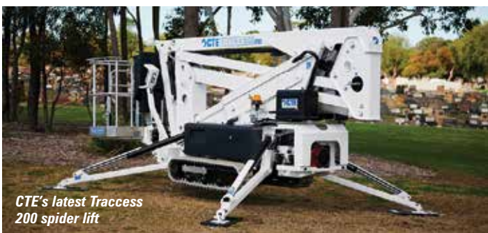
CTE's latest Traccess 200 spider lift

CMC has taken a back to basics approach with a three model range of fully hydraulic spider lifts in the form of the S13F, S15F and S18F with working heights of 13, 15 and 18 metres respectively. Woodward says: "Not only does the new range cost less to build - but they are also so simple and easy to use, maintain and repair - especially for engineers with basic knowledge of these machines. For a hire fleet, its back to good old fashioned fully hydraulic stuff which you can almost hit it with a hammer again!"