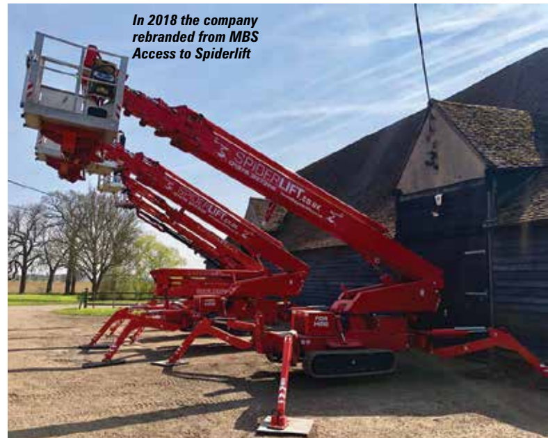
In 2018 the company rebranded from MBS Access to Spiderlift

"When we buy spider lifts, we always look for a simple to use machine that has a clear process to go from transport mode to setting up and being operational. We also look for features that benefit the customer. Height and width adjustable tracks to offer greater ground clearance and stability over rough terrain. Whether the basket is mounted underneath or flush with the bottom will also ensure it doesn't catch on branches. Same applies for hoses, hydraulics and cat-tracks making sure they are all enclosed. If any of these are exposed these can get caught up in the tree, break the cat-track or