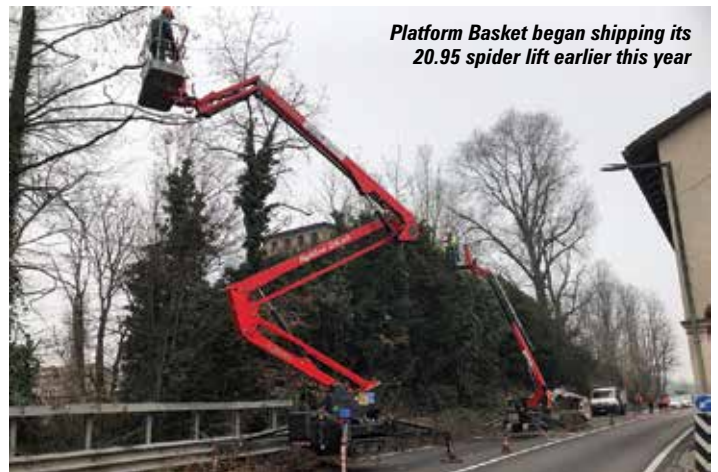
Platform Basket began shipping its 20.95 spider lift earlier this year

Last month Imer added the 15.1 metre IM R15 DA articulated spider lift to its line-up. The model is the first in its range with a dual sigma type riser, in this case, topped by a two section telescopic boom and articulated jib. Maximum outreach