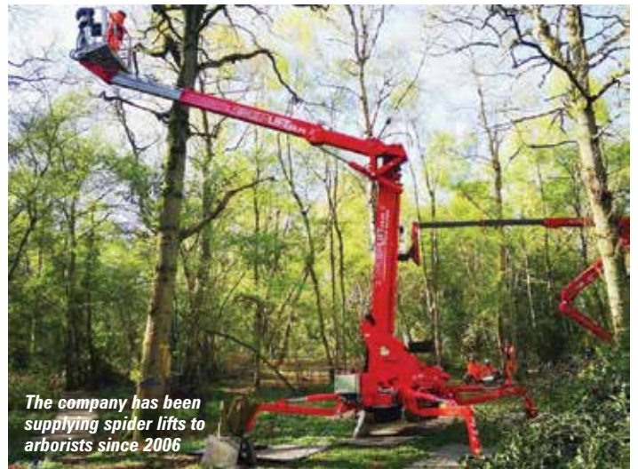
The company has been supplying spider lifts to arborists since 2006