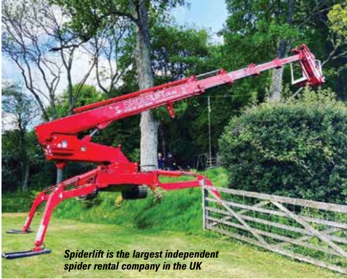
Spiderlift is the largest independent spider rental company in the UK