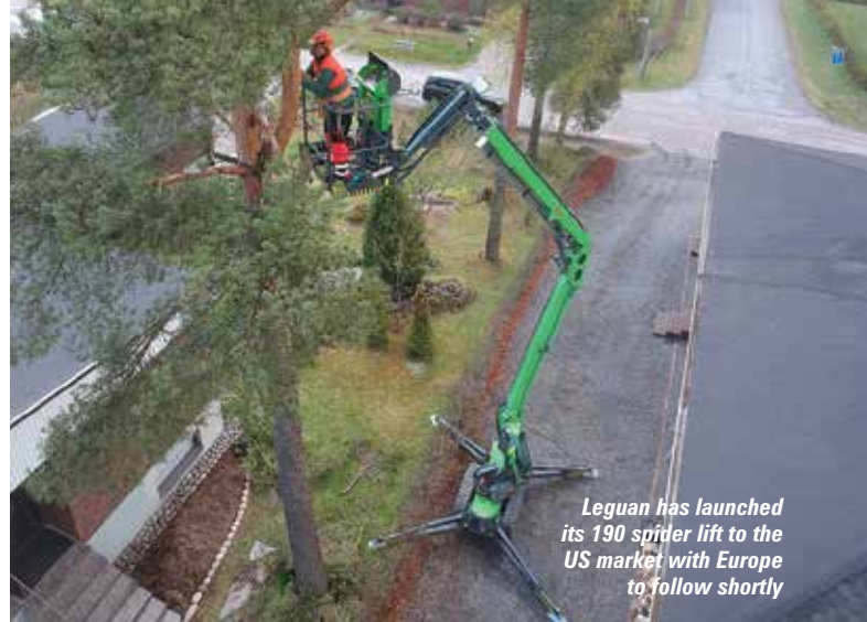
Leguan has launched its 190 spider lift to the US market with Europe to follow shortly