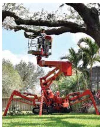
CMC offers a range of spider lifts which have been designed with arborists in mind

Italian manufacturer CMC is one of a several that offers arb-specific models. It introduced its first model - a 19 metre S19HD - several years ago and has extended the range to include four models with working