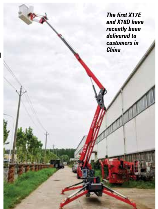
The first X17E and X18D have recently been delivered to customers in China