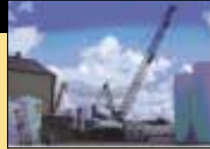
Demag MC300 Year 1980. Capacity 90 tonnes. Mobile Lattice