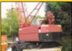
Jones 565 Year 1975. Capacity 30 tonnes. Mobile Lattice