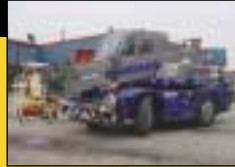
Kato CR100 Year 1998. Capacity 10 tonnes. City Crane