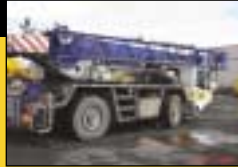
Demag AC95 Year 1996. Capacity 40 tonnes. All Terrain