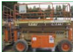
SELF PROPELLED SCISSOR PLATFORM 1998 JLG 40RTS. 14m. working height (46ft.). Deutz diesel. Choice of machines.