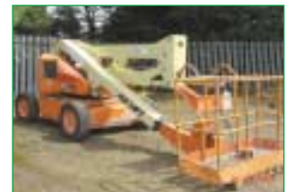
SELF PROPELLED TELESCOPIC PLATFORM 1998 JLG 45DC 15m. working height (50ft.) D.C. Battery Powered Choice of several machines.

Tel +44 (0) 1291 421155 Fax +44 (0) 1291 423930