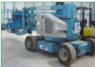
3SELF PROPELLED TELESCOPIC PLATFORM 1998 GENIE Z45/22. Bi-fuel 15m. working height (50ft.). Kubota Diesel & D.C. Battery Power. Choice of several machines.