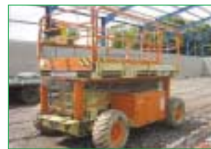
SELF PROPELLED SCISSOR PLATFORM 1999 JLG 33 RTS 12m. working height (39ft.). Deutz Diesel. Choice of several machines.