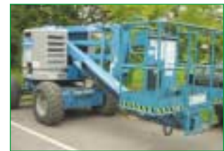
SELF PROPELLED TELESCOPIC PLATFORM 1998 GENIE Z45/22 15m. working height (39ft.). Deutz Diesel Choice of 20 machines.