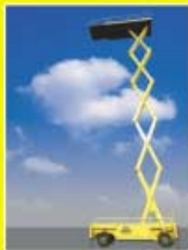
Scissor platforms Working height: 4 - 33 metres Platforms: sizes 0.74 x 1.30 m up to 2.80 x 6.64 m