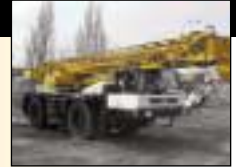
PPM 340ATT Year 1997. Capacity 30 tonnes. All Terrain