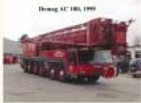
Demag AC 180, 1999