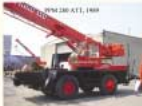
PPM 280 ATT, 1999

We also have the following in stock: Kato NK 200, 1993 Kato NK250, 1991 Demag AC25 x 4, 1997-2001 Grove ATT03, 1996 PPM ATT 400, 1999 Demag AC40-1 x 2, 1999 Demag AC50, 2000 PPM 6002, 2002 Demag AC90, 2002 Liebherr LTM 1070, 1998 Grove GMK 4070, 1993