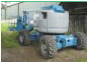
SELF PROPELLED TELESCOPIC PLATFORM 2002 GENIE Z45/22 4x4 15m. working height (46ft.). Oscillating axle. Deutz Diesel. Choice of 5 machines.