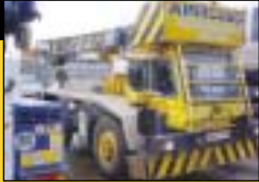
Grove AP415 Year 1996. Capacity 15 tonnes. Industrial Crane