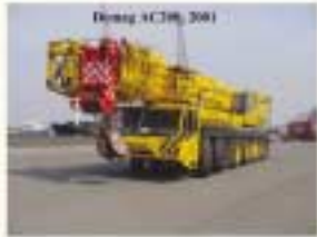
Demag AC25, 2001