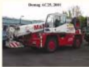
Demag AC25, 2001