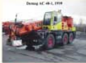
Demag AC 48-L, 1999