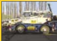
Kobelco RK200-3 Year 2000. Capacity 20 tonnes. City Crane