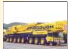
Liebherr LTM1400 Year 1998. Capacity 400 tonnes. All Terrain