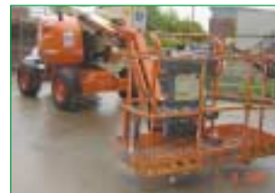
SELF PROPELLED TELESCOPIC PLATFORM 2000 JLG 450AJ 15m. working height (51ft.). Deutz Diesel. Choice of several machines.