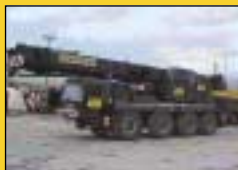
Liebherr LTM1070-1 Year 1994. Capacity 70 tonnes. All Terrain