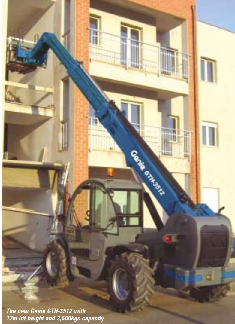
The new Genie GTH-3512 with 12m lift height and 3,500kgs capacity