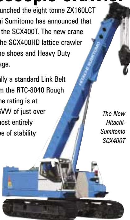
The New Hitachi Sumitomo SCX400T

The fully assembled unit has a transport length of 12.47 metres with a 2.92 metre overall height and 3.35 metre overall width. The new model will be shown at this years SED in May.