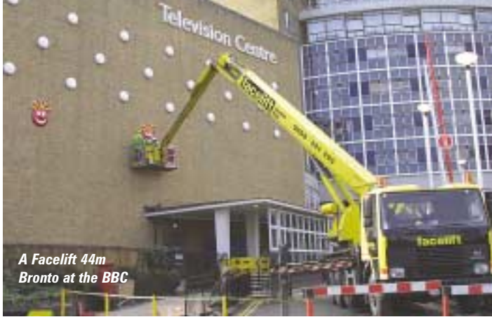
A Facelift 44m Bronto at the BBC