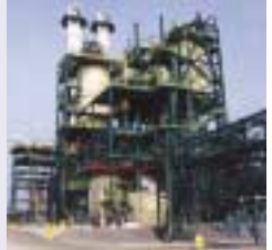
The Dow Corning plant

It was not possible to either dismantle the machine or remove the Drive Ring, which is fixed at one end of the mill, meaning that the centre of gravity and most of the weight was completely to one end.