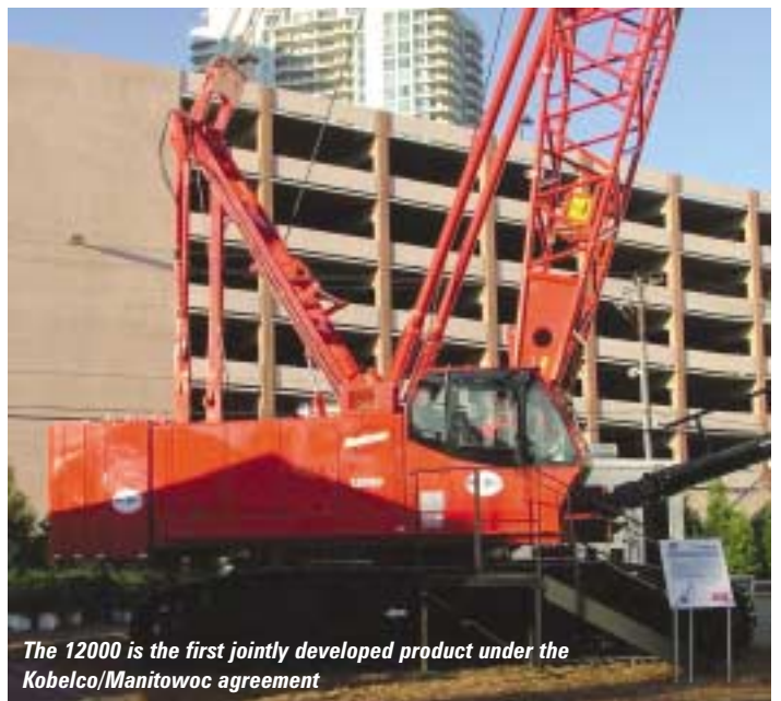
The 12000 is the first jointly developed product under the Kobelco/Manitowoc agreement

Manitowoc has announced that it has reached an accord with Kobelco cranes to extend its OEM agreement for the supply of Kobelco crawler cranes of 110 tonnes and under to Europe and Africa. The agreement mirrors that which has been running in North America for the past 12 months. Kobelco Cranes UK will continue to sell those products under its own brand and in competition with Manitowoc. The deal becomes effective from the third quarter 2005.