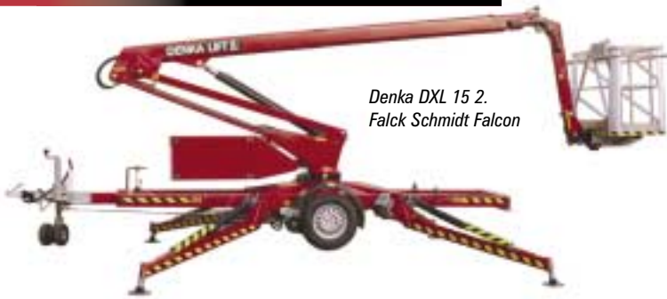
Denka DXL 15.2. Falck Schmidt Falcon