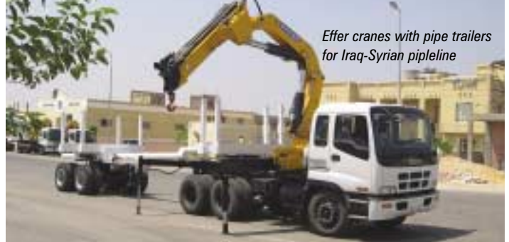
Effer cranes with pipe trailers for Iraq-Syrian pipeline

"We were very pleased with the VC15 and the exceptional service provided by Trevor Vanson and his workforce. There should be more of these cranes in circulation for projects like this one, especially given site safety and HSE manual handling rules etc." continued Lock.