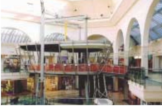
The Vanson VC15 and the Sky Café it assembled

Vanson cranes had a novel challenge recently when it was asked to provide a crane to build the futuristic Sky Café within the existing Triangle shopping mall in Manchester.