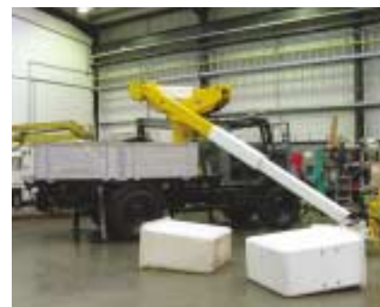
Versalift carry out regular rebuild and recertification of insulated booms

With its wide range of equipment including large overhead cranes it is ideally suited for larger work and recently completed a slew ring replacement on a 500 tonner within two days.