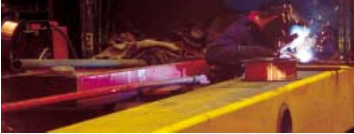
Boom and structural repairs are available from a number of specialised suppliers.