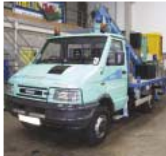
A skylift truck mount gets its gloss back after a Dakota shine treatment.

With most UK rental companies painting their equipment in company colours, one area that comes up for refurbishment more often than users would like is the paintwork. The UK is a relatively inexpensive location for full machine repaints, certainly compared to Germany or Scandinavia. However an increasing problem is the workload that specialist painting companies have. Particularly for cranes and larger truck mounted