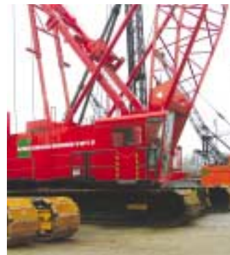
"A Manitowoc 4600 recently rebuilt by Adrighem&Barnhoorn"

Of the three large mobile crane suppliers in the UK Liebherr has invested a vast amount in its new facility in Biggleswade, part of the strategy for this new facility is to be in a position to carry out more rebuild and refurbishment work as it builds its UK operation into a full customer service operation. At present Liebherr only refurbishes and rebuilds its own cranes, apart from work on units that it takes in trade. The longer term plan though is to build this part of the business up in order to offer a refurbishment service for all makes of crane.