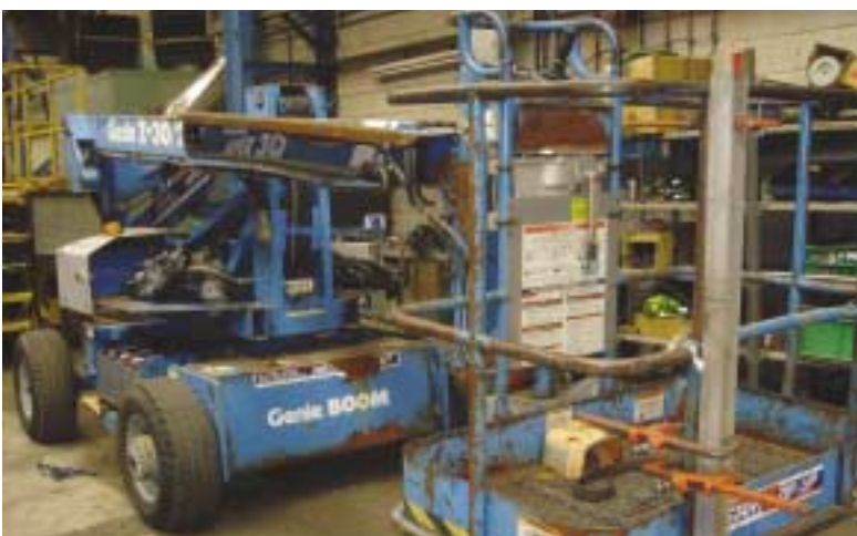
A Genie boom arrives for mid life refurbishment at Sam Walkers

spend a high proportion of the new cost to rebuild it.