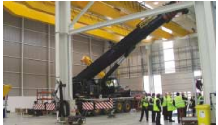
Liebherr has developed a purpose built facility in the UK which will offer a wide range of repairs and refurbishment work

The Crane market has for some time had a strong rebuild and refurbishment culture given the cost of the equipment and the need to depreciate it over a longer period. However unlike the aerial lift market which is developing along production line methods with complete makeovers, crane refurbishment is far more of an individual and local affair,