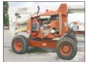
An old Snorkel 60ft Articulated boom before and...