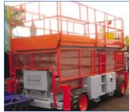
A Skyjack 9250 after a Sam Walker refurbishment

This makes the job exceptionally expensive and in these days of tight margins can blow a machines profitability in one go. Last year Future Products began importing an alternative called Dakota Shine, while nothing like a proper blast and repaint job, it does restore the shine and colour to a faded/oxidised machine. The other benefit is that any touch up work done prior to the application of the Dakota shine, (a practice that usually makes the machine look worse than before)