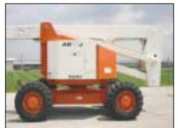
the same unit after the factory refurbishment

rebuild, but also has local rebuild centres within its Service plus business. Genie takes a slightly different approach and tends to work with certain local outlets rebuilding only Genie units.