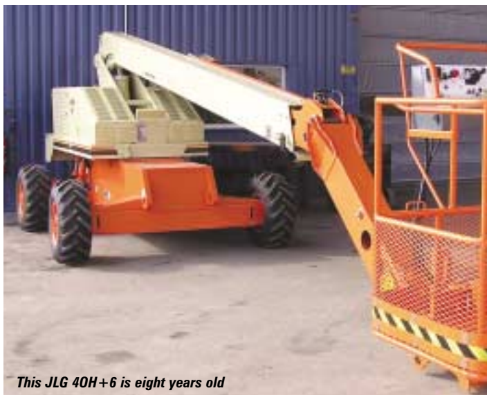
This JLG 40H+6 is eight years old

A major trend emerging in North America is the reconditioning and even rebuilding of older aerial work platforms, particularly booms and big scissors. We take a look at refurbishment, repairs and rebuilds for Cranes, Telehandlers and Aerial lifts on this side of the pond.