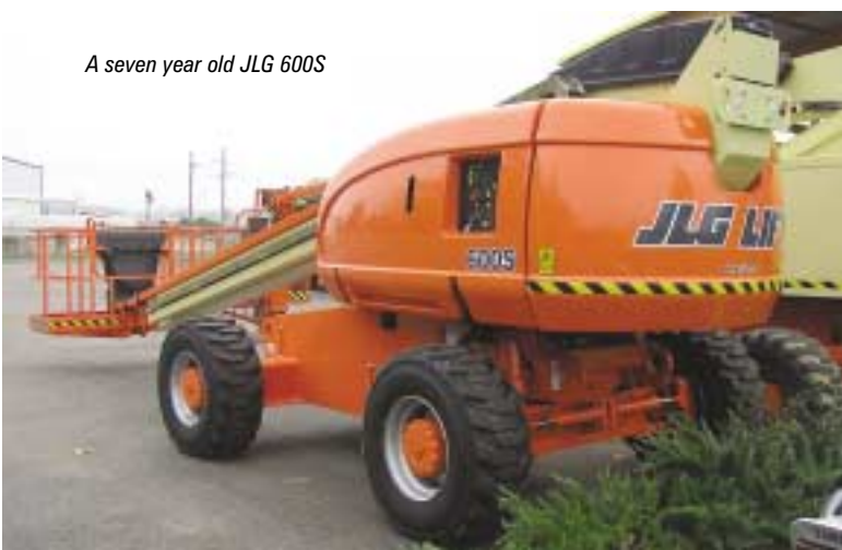
A seven year old JLG 600S

Liebherr is also planning to offer a wide range of crane training courses starting off with Operator training and expanding into appointed person, slinger/banksman and other programmes.